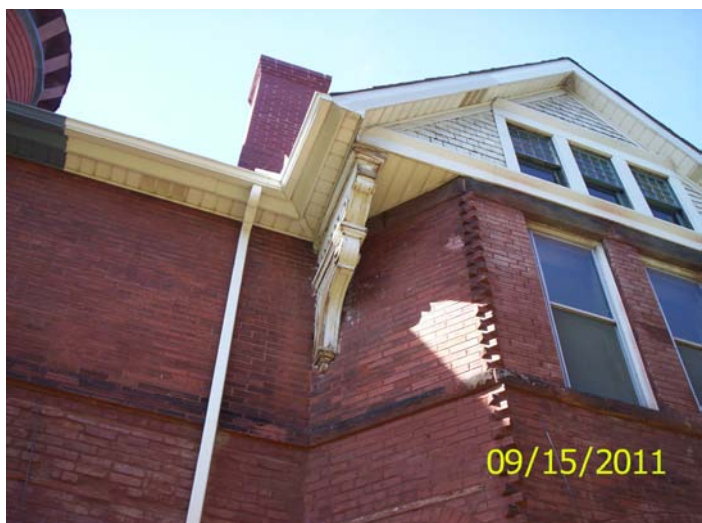
Missing caulk, open wall