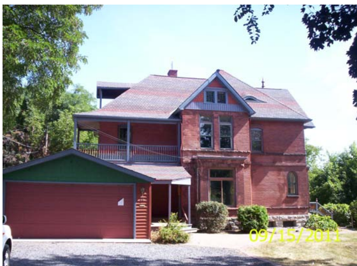
West side and garage