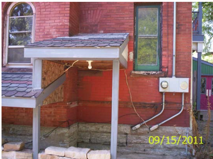
Unapproved exterior electrical wiring

HP District: Property Name: O.A. Beal House Survey Info: RA-SPC-1952