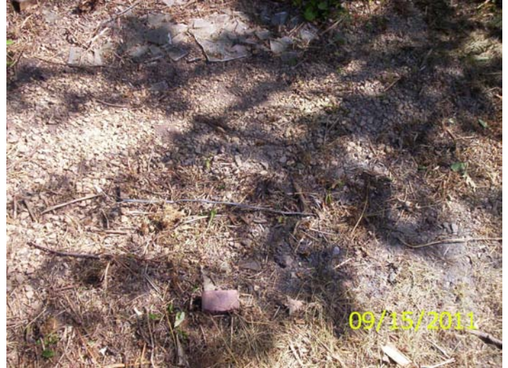
Electrical conductors coming out of the ground