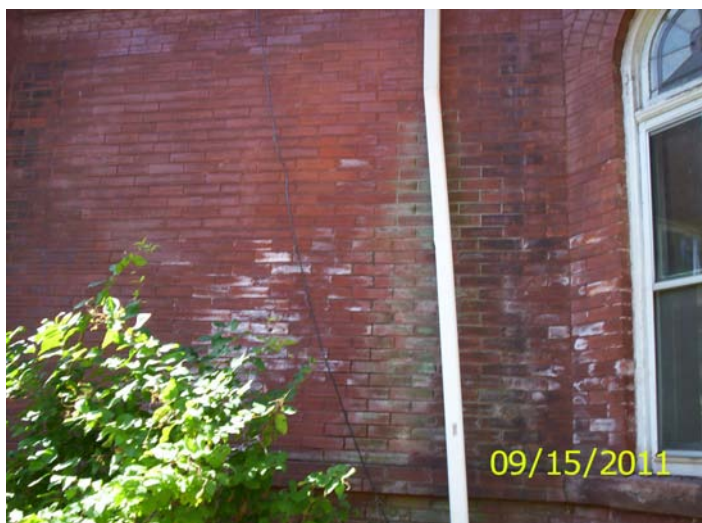
Water damaged masonry