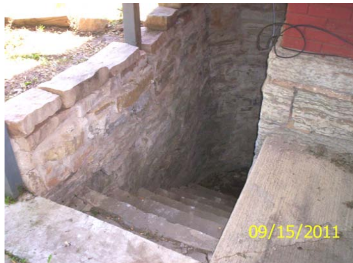
Bulge in wall, deteriorated masonry