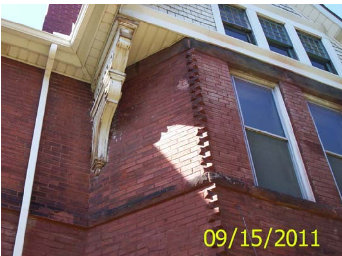
Missing caulk, open wall