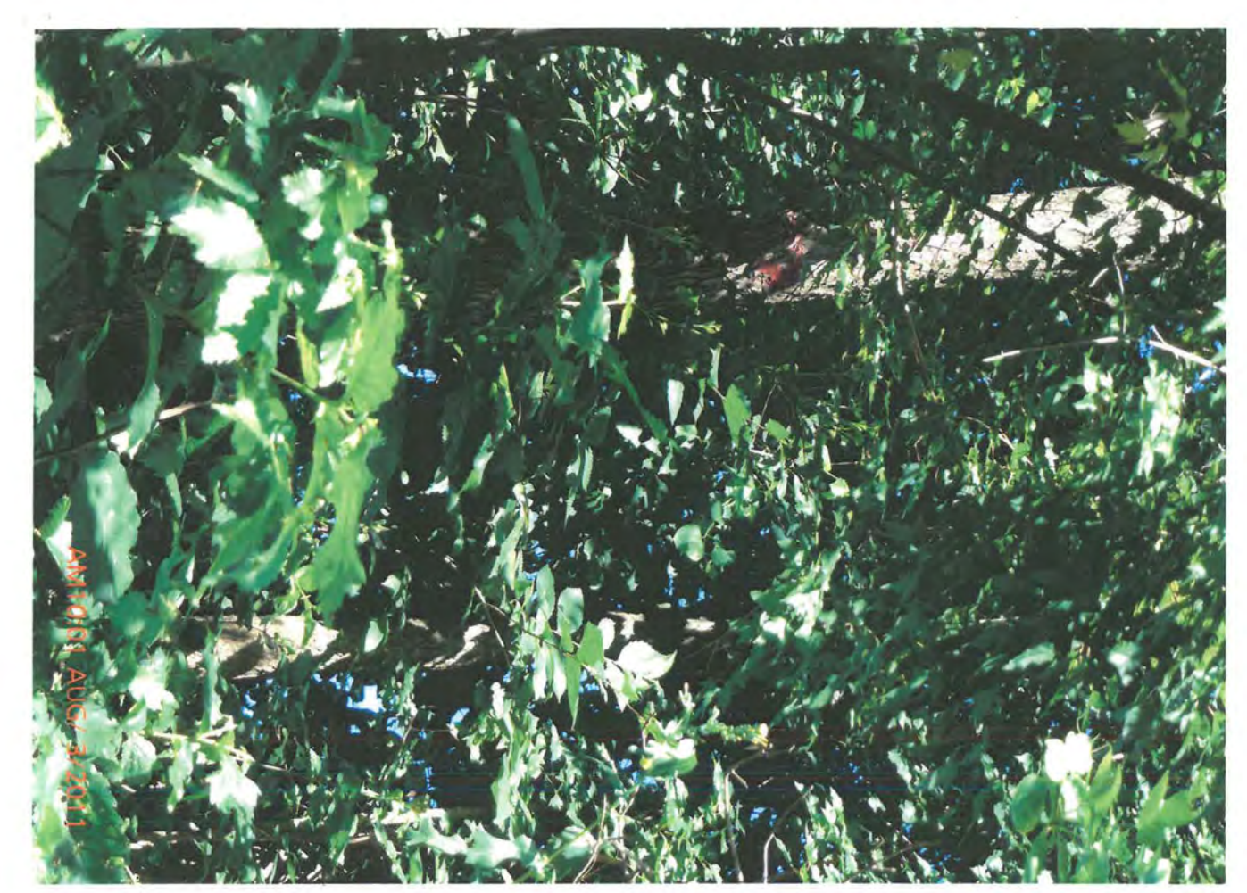
17-70 BURNS AVE