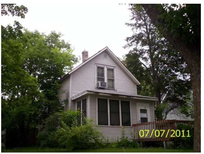
North and west sides