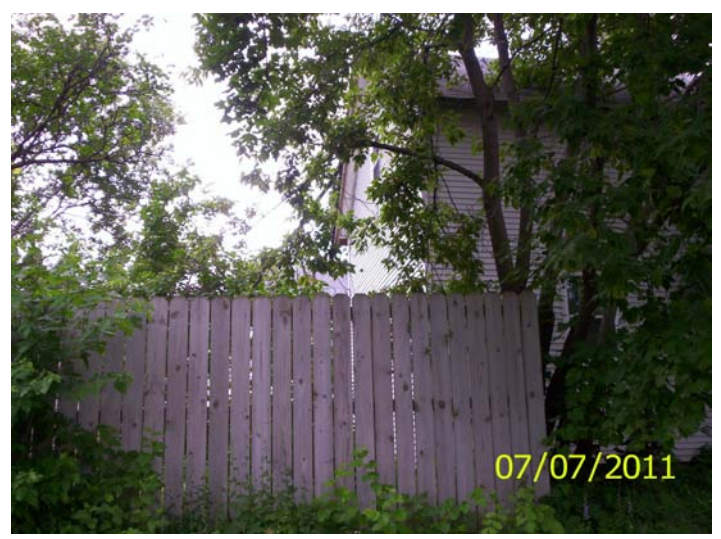
Eave and roof damage