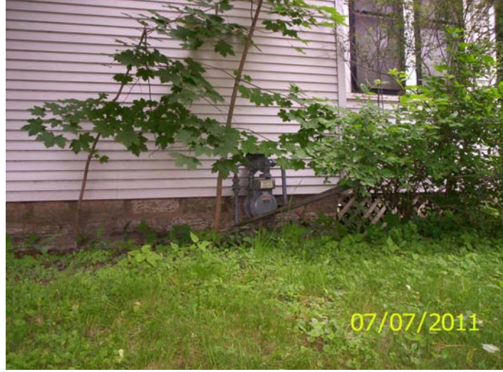
Gas meter locked off