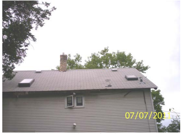
Missing shingles and chimney flashing