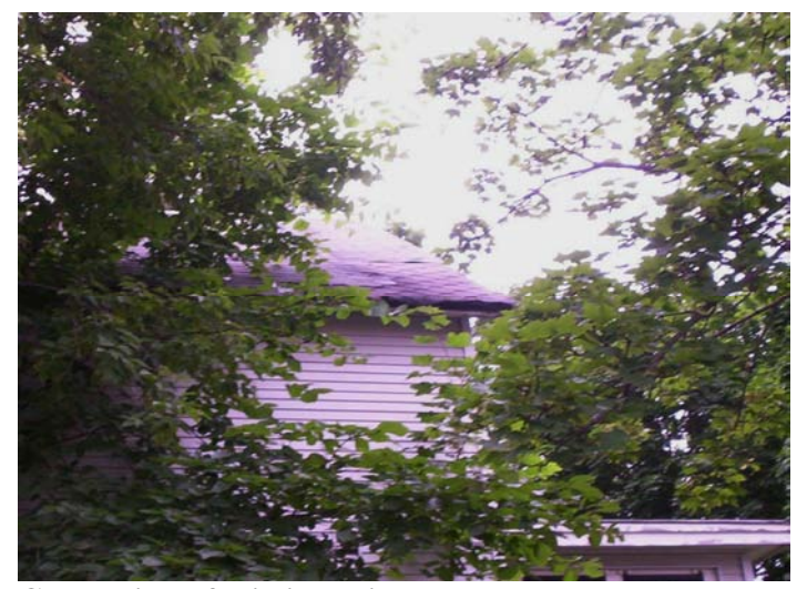
Closer view of missing shingles and damaged eave