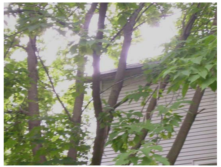
Eave damaged by tree and rot