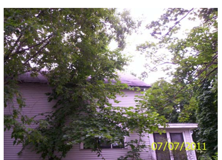
Missing shingles, damaged, open eave

Folder Name: 846 SMITH AVE S PIN: 072822330185