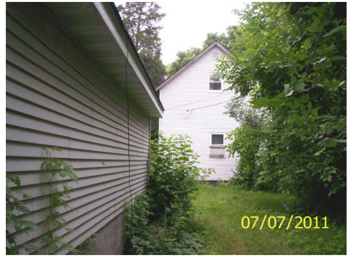
30-amp electrical service drop