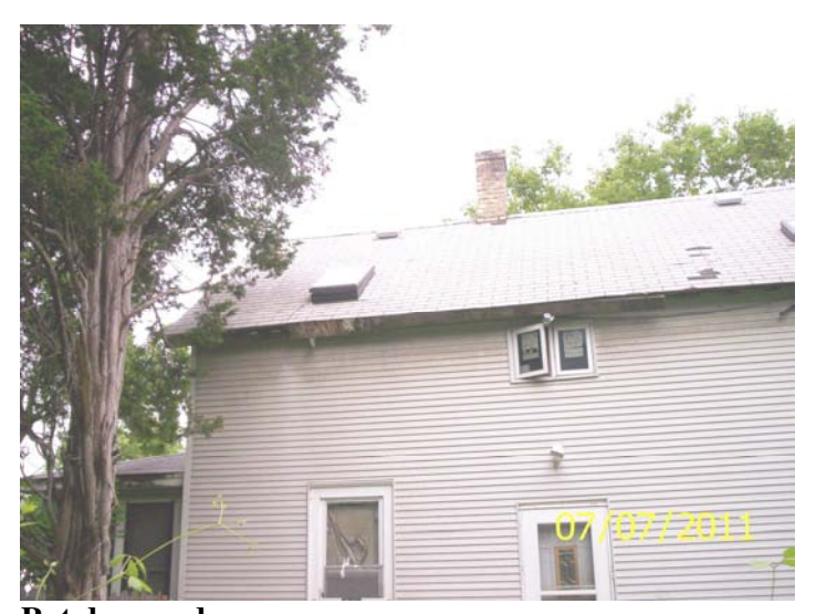
Rot damaged, open eave