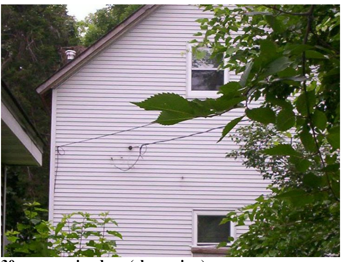
30-amp service drop (closer view)