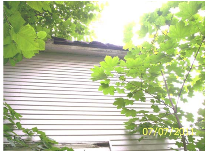
Damaged, open eave and roof