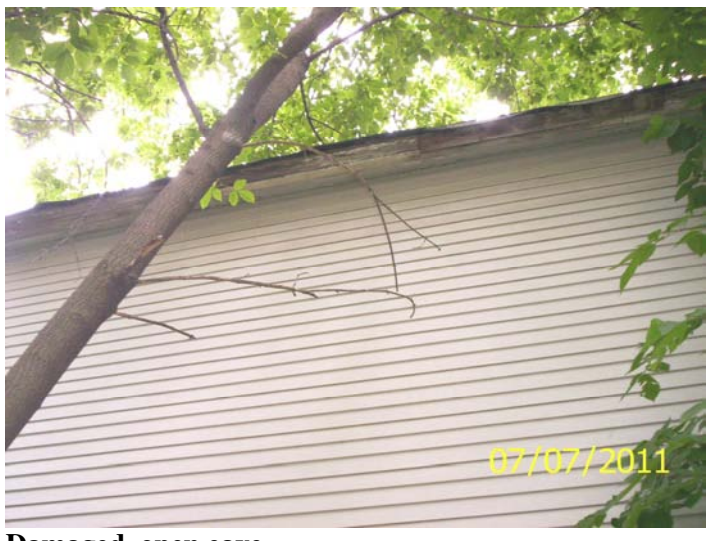
Damaged, open eave