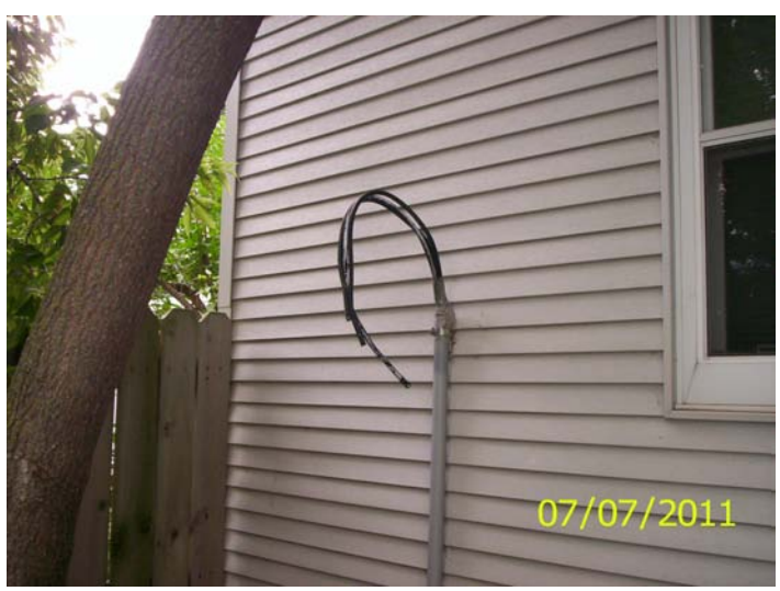
Unfinished electrical upgrade