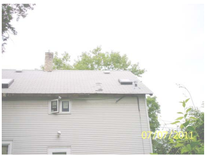
damaged, open eave