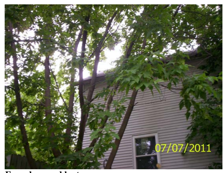
Eave damaged by tree