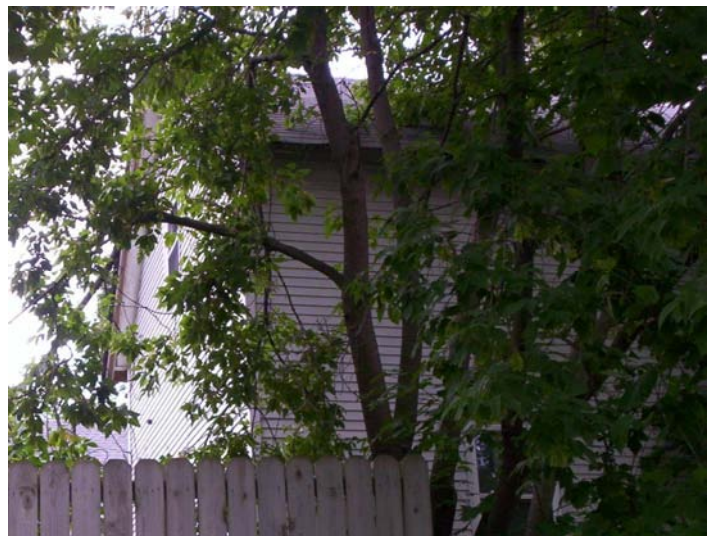
Eave damaged by tree (closer view)