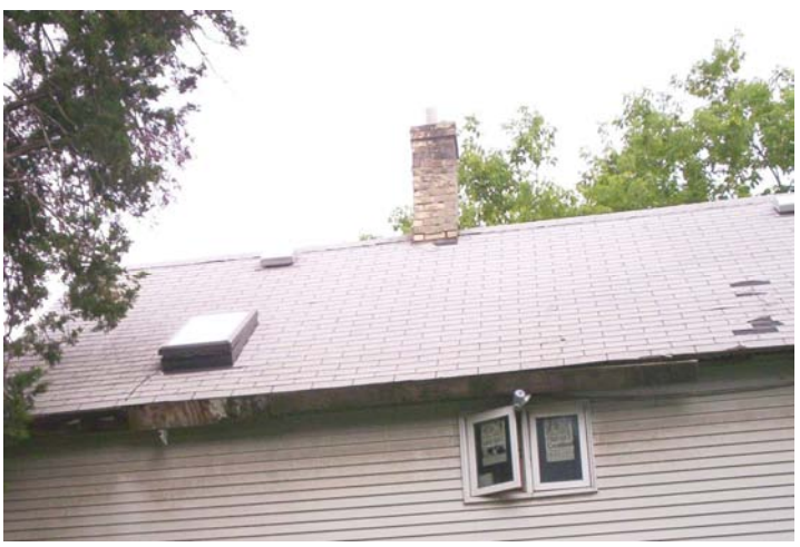
Missing shingles and chimney flashing (closer view)