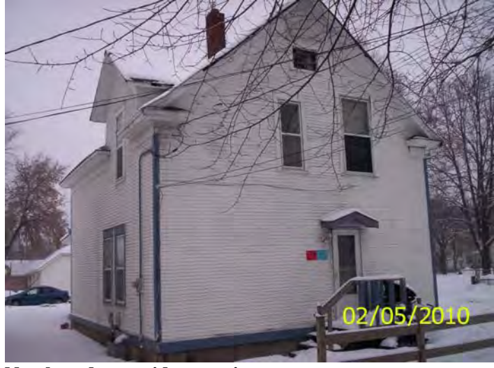
North and west sides, posting