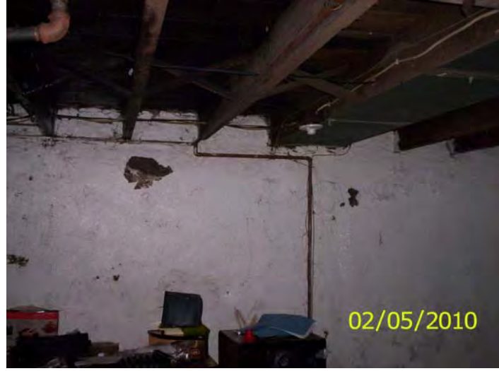
Bubbling, flaking paint