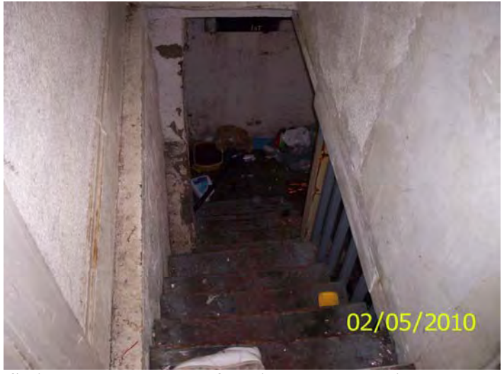
Stair way to basement, flooding, no hand rail