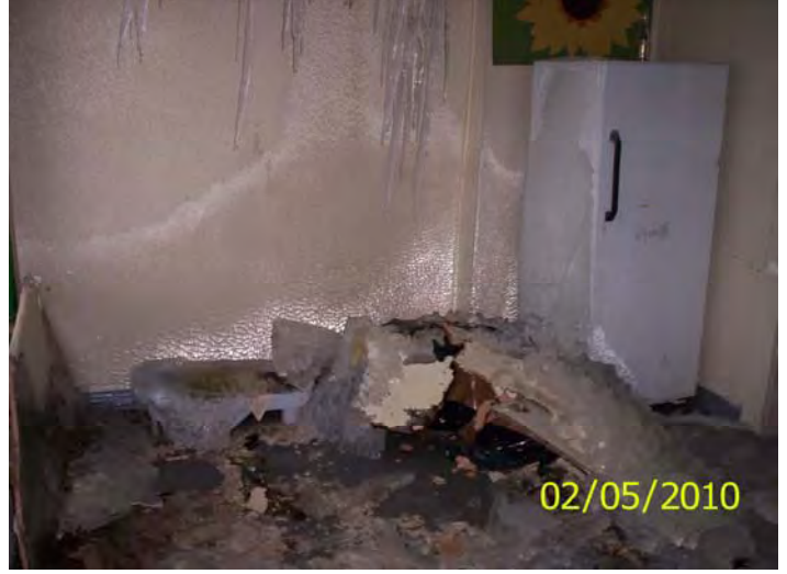
Kitchen, ice covered appliance, wall, floor