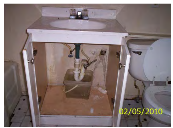
Improper trap repair, leaking

HP District: Property Name: Survey Info: