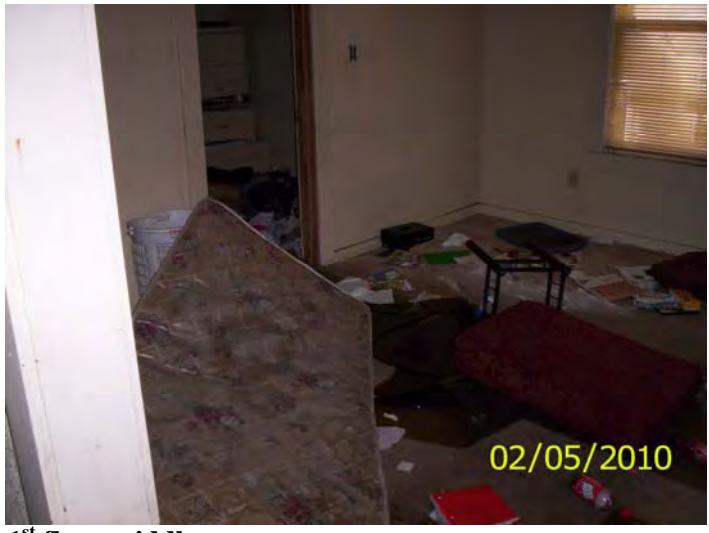
1<sup>st</sup> floor middle room