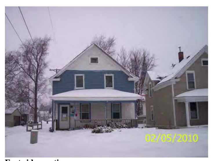
East side, postings