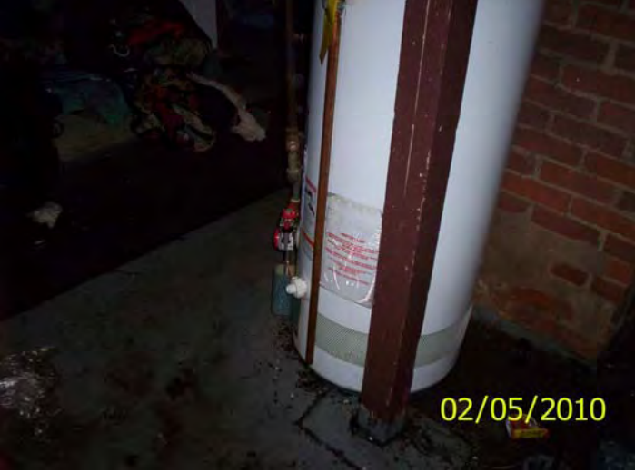
Improper post installation, improper spill tube, no handle on gas shut off