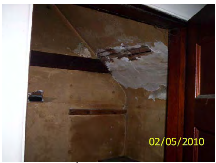
Damaged ceiling 2<sup>nd</sup> floor bathroom