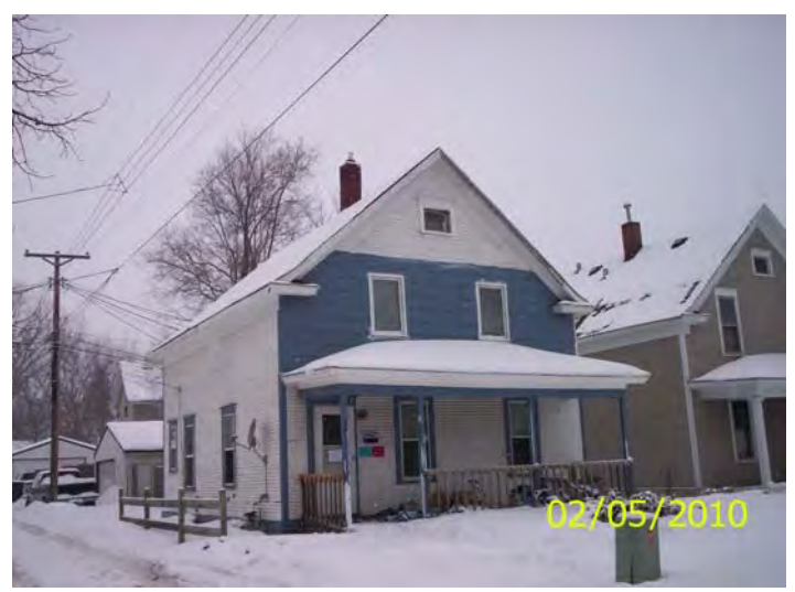
South and east sides, postings