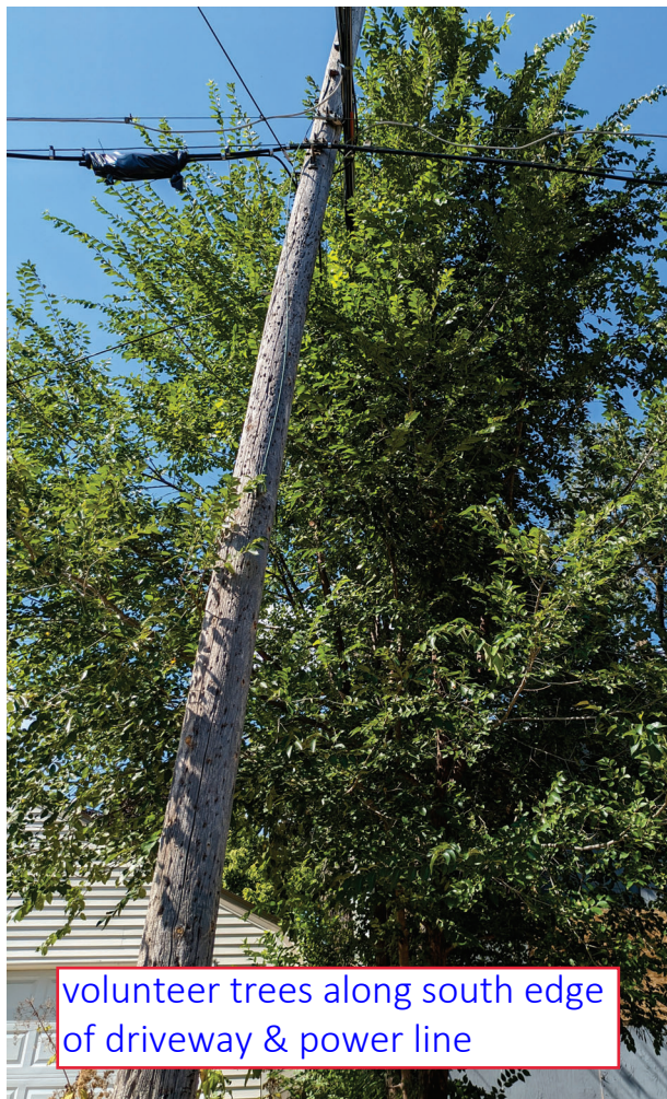
volunteer trees along south edge of driveway & power line