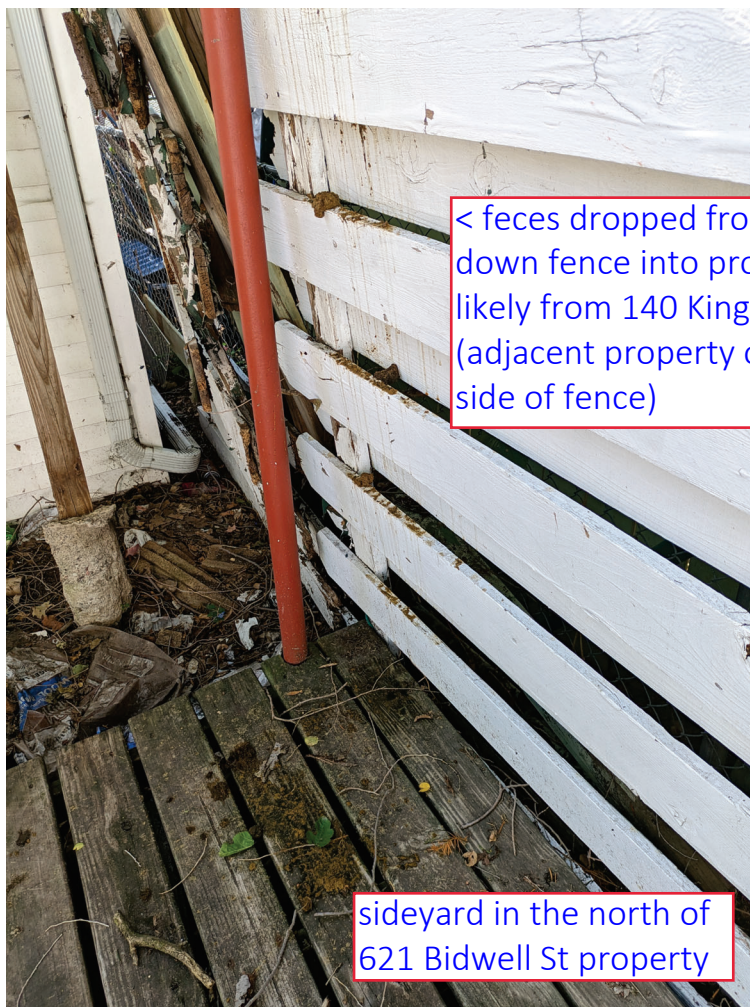
< feces dropped from above down fence into property, likely from 140 King St W (adjacent property on other side of fence)