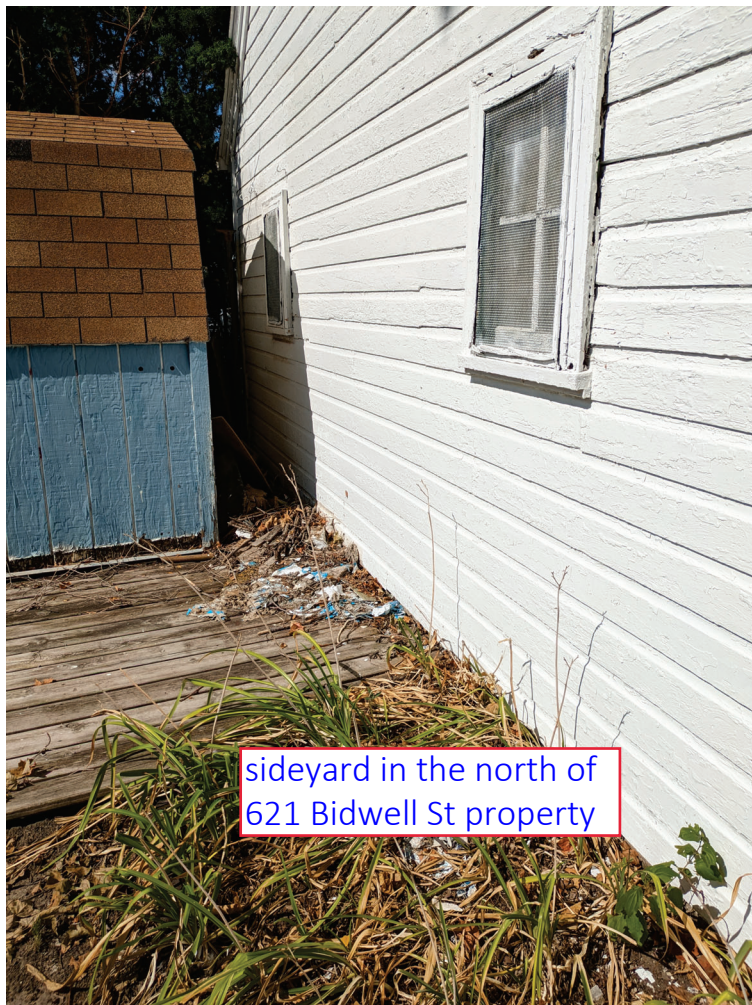
sideyard in the north of 621 Bidwell St property