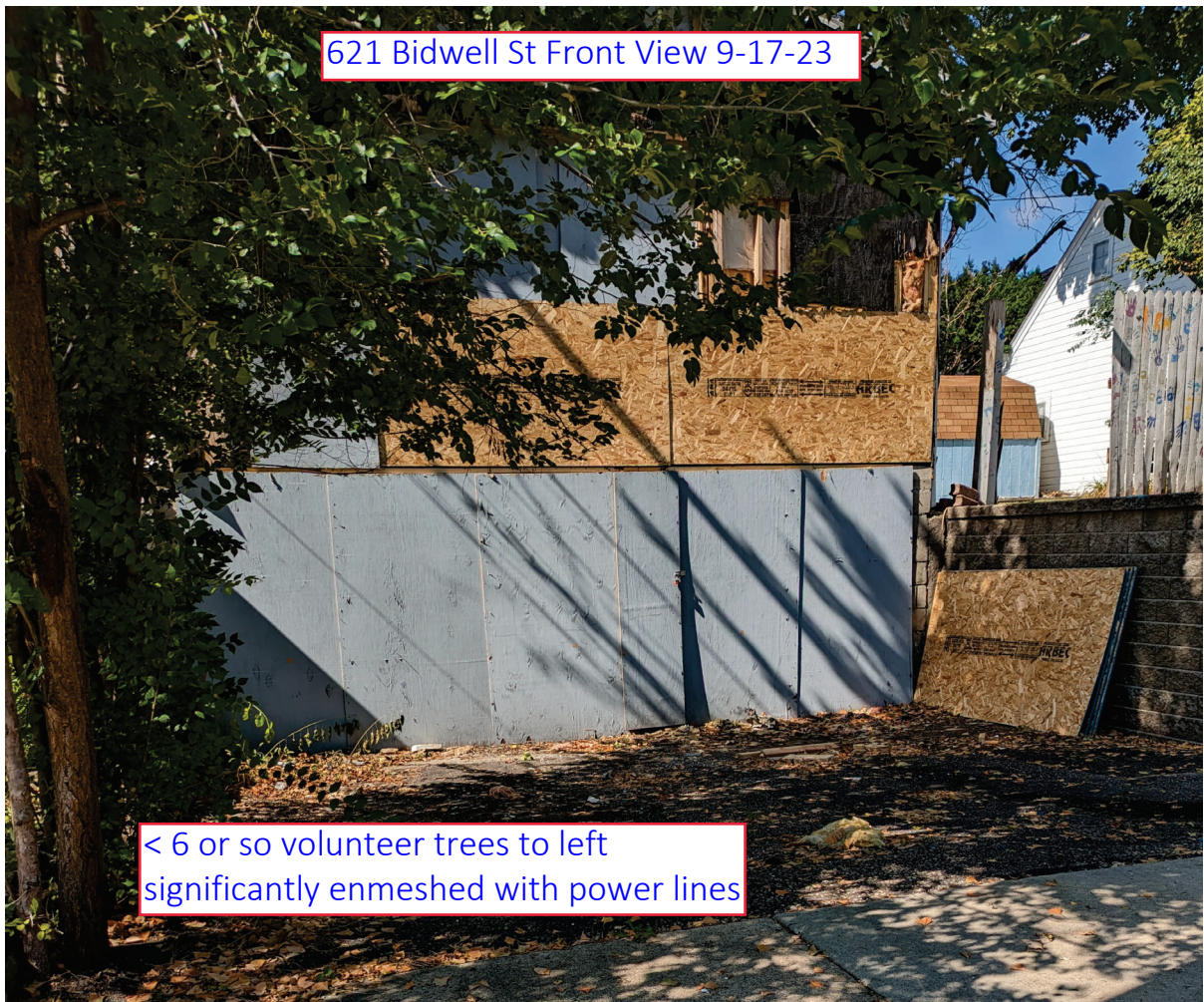
621 Bidwell St Front View 9-17-23

< 6 or so volunteer trees to left significantly enmeshed with power lines