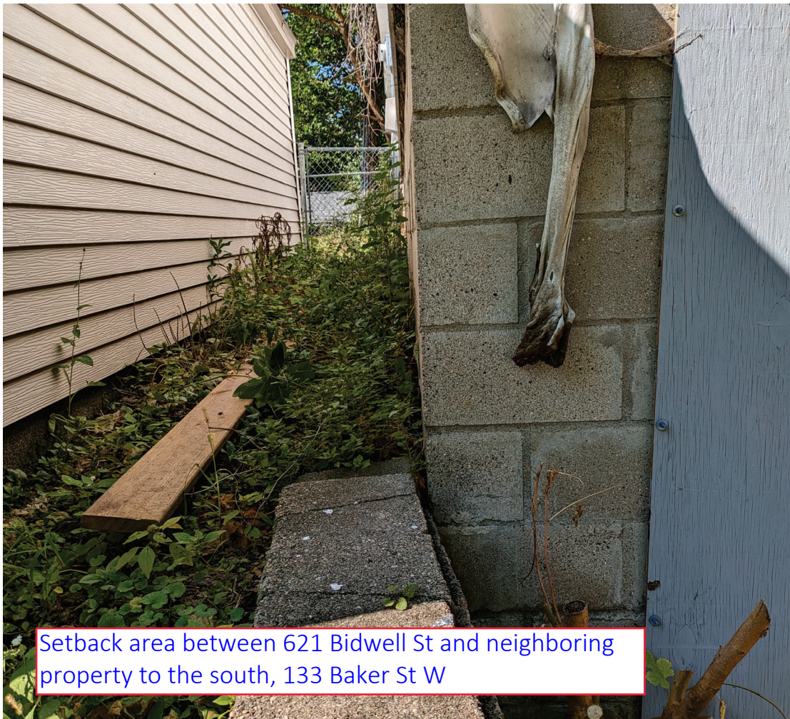
Setback area between 621 Bidwell St and neighboring property to the south, 133 Baker St W