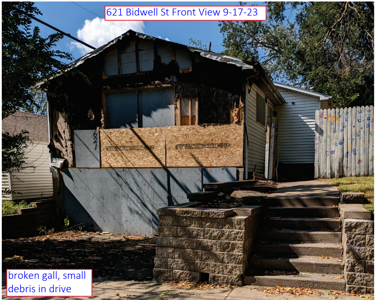
621 Bidwell St Front View 9-17-23