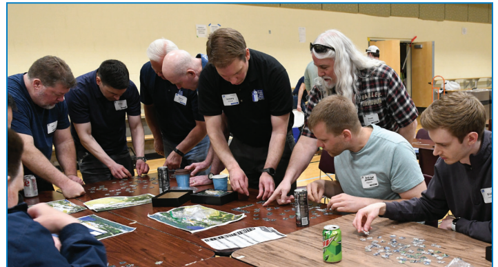
Left, Employees listen to the financial fitness discussion held in the afternoon. Above, production staff put together puzzles of the new and old treatment plants as part of teambuilding during the division hour.