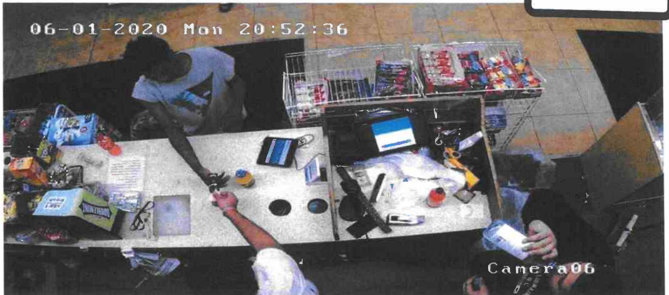
EXHIBIT tabbies 2-100