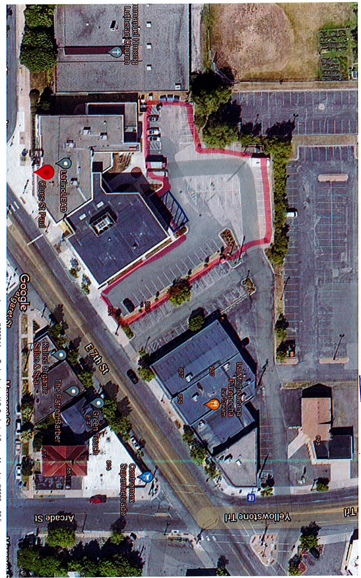
50 ft I