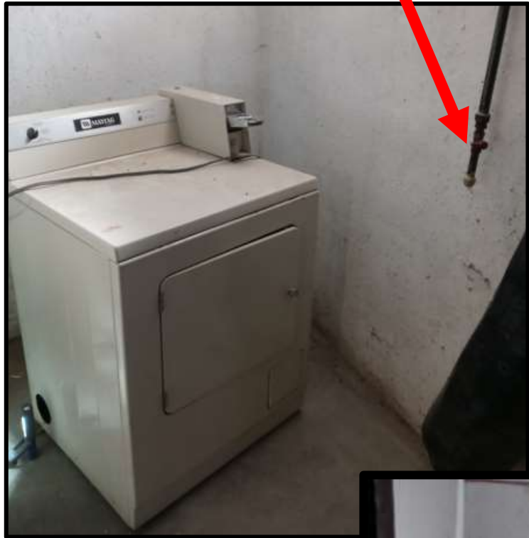
Gas Dryer inoperable – gas line capped