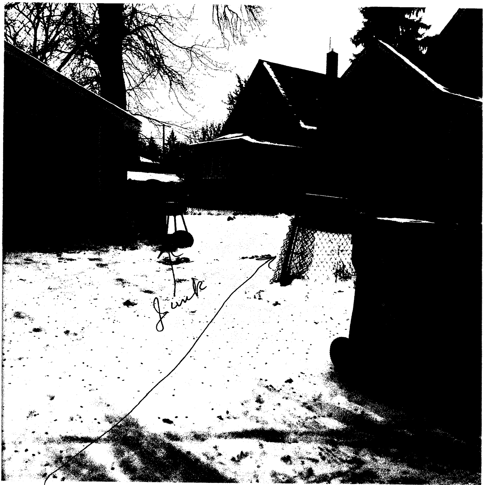
Broken fence 1140 Jackson