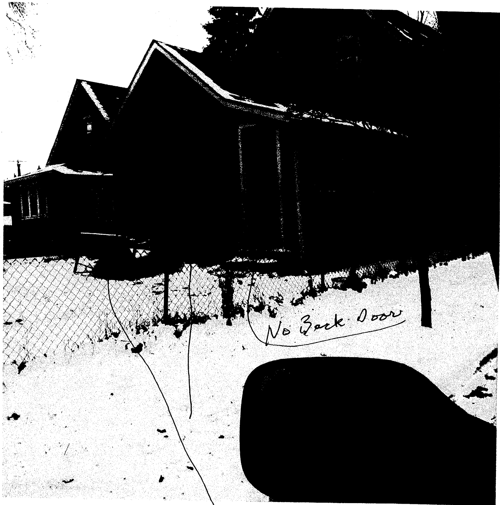
Tank in yard 1140 Jackson