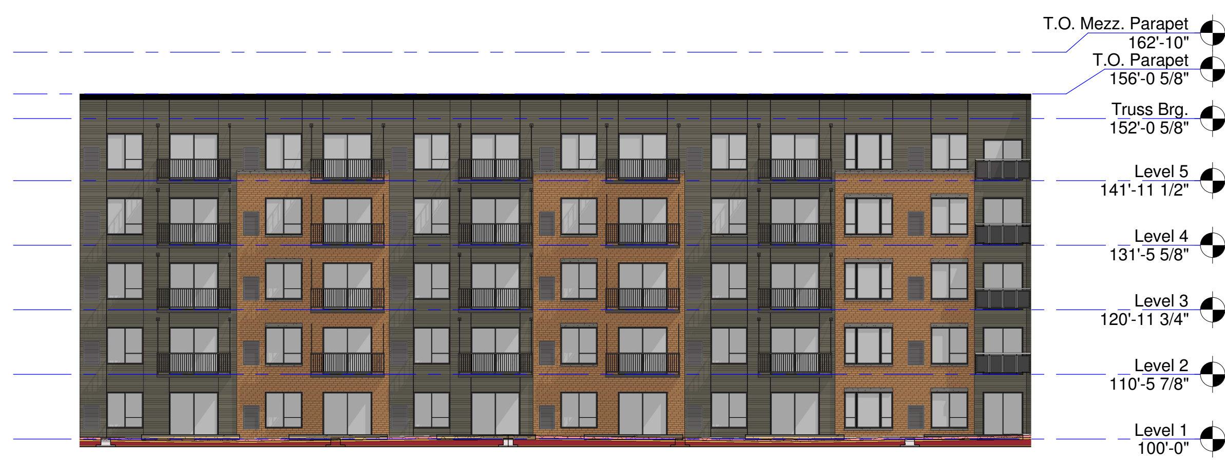
③ CY Elevation 3 1/16" = 1'-0"