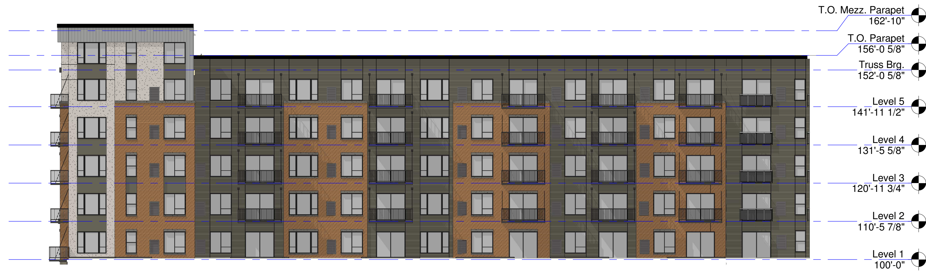
① CY Elevation 1 Marketing 1/16" = 1'-0"