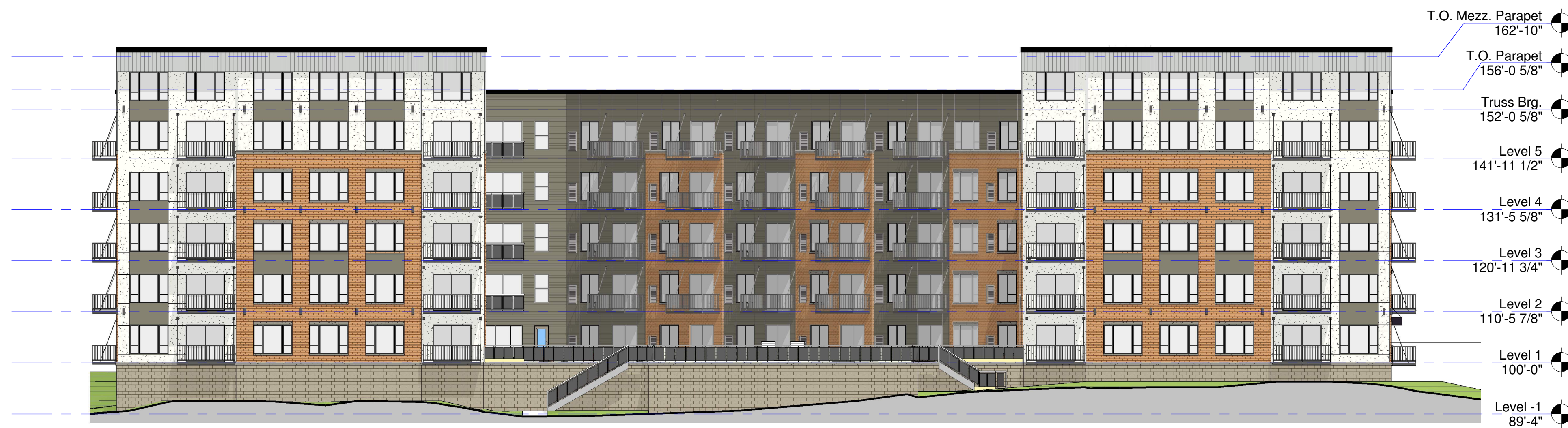
⑤ SE Elevation Marketing 1/16" = 1'-0"