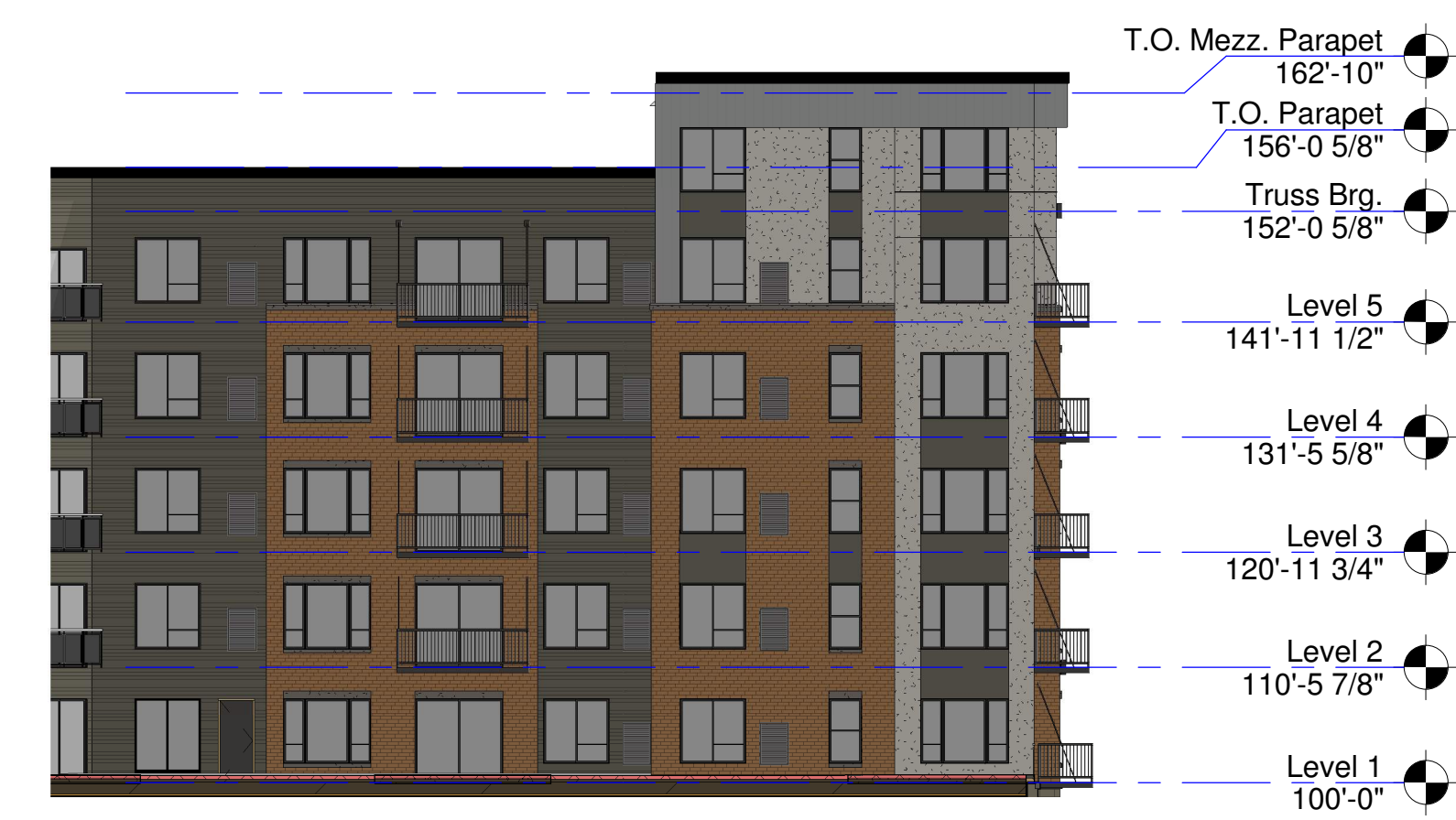
④ CY Elevation 4 1/16" = 1'-0"