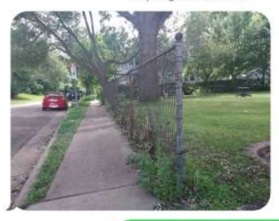
Fri, Aug 9 at 1:46 PM

Wasn't Seeger late? You just deposited it.