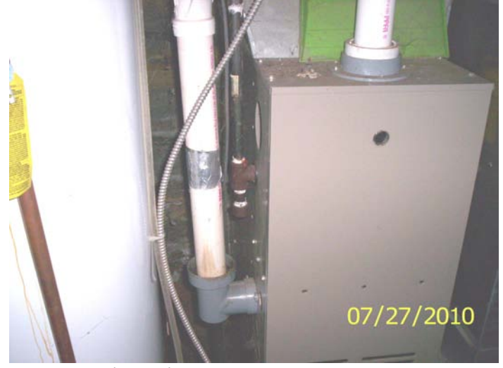
Improper pipe union

HP District: Property Name: Survey Info: