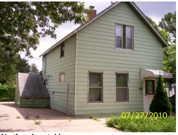
North and west sides