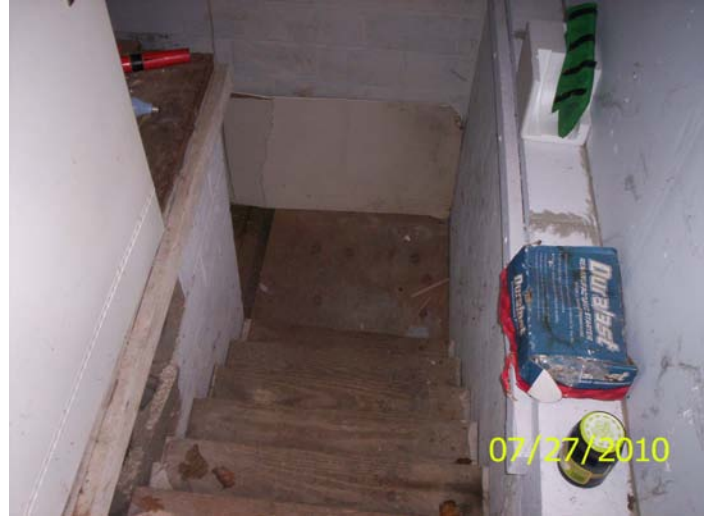
Stairs to basement, no hand rail