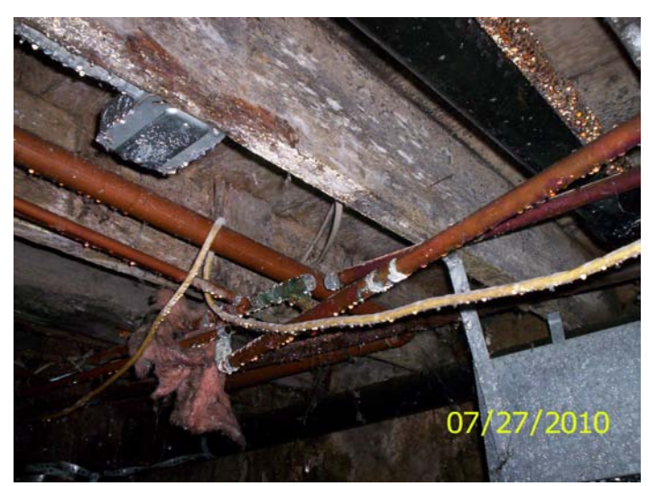
Improper electrical wiring, no permit for work