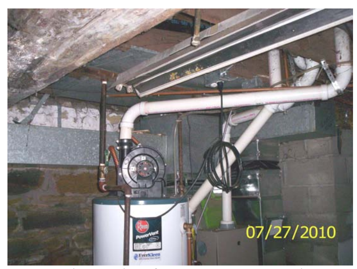
Improper installation of water heater, no permit