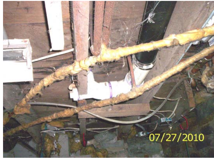
New plumbing and electrical installations, no permit