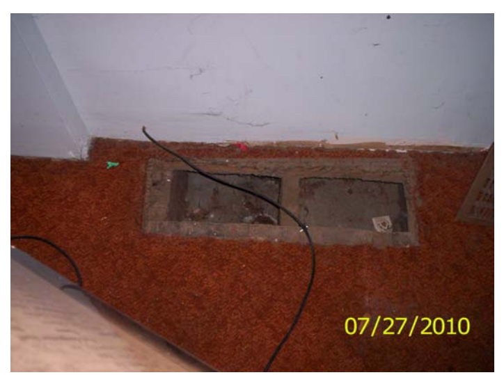
Open heating vent