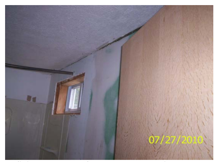
Unfinished remodel of bathroom, no permits