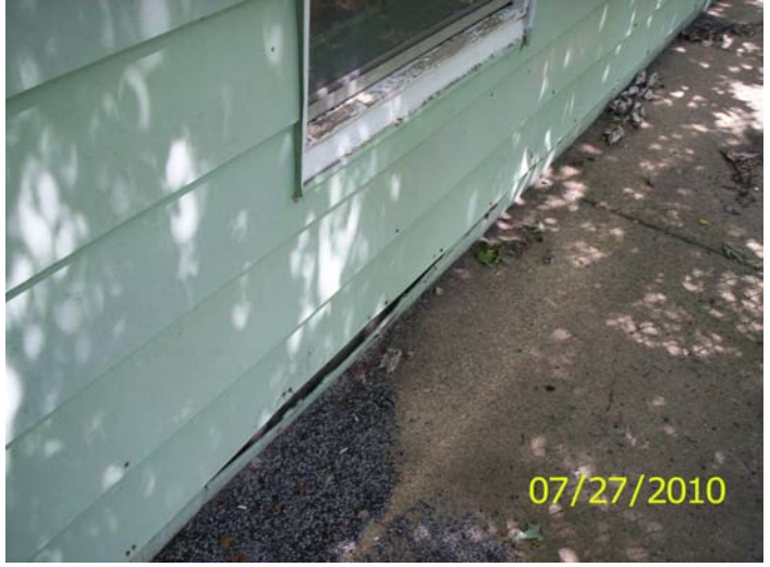
Siding/trim coming off of wall