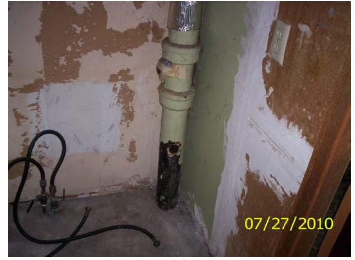
Open main plumbing stack, improper repair