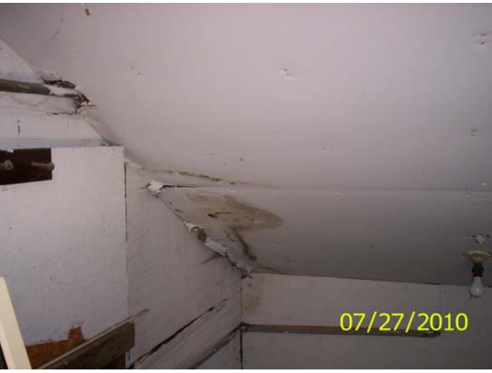
Water damage to ceiling in stair way to basement