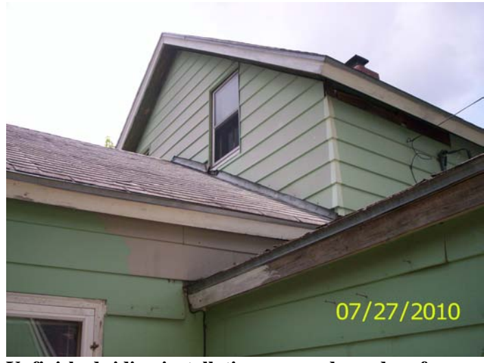
Unfinished siding installation, exposed wood surfaces, Improper flashing