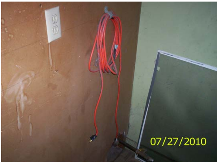
Extension cord wiring