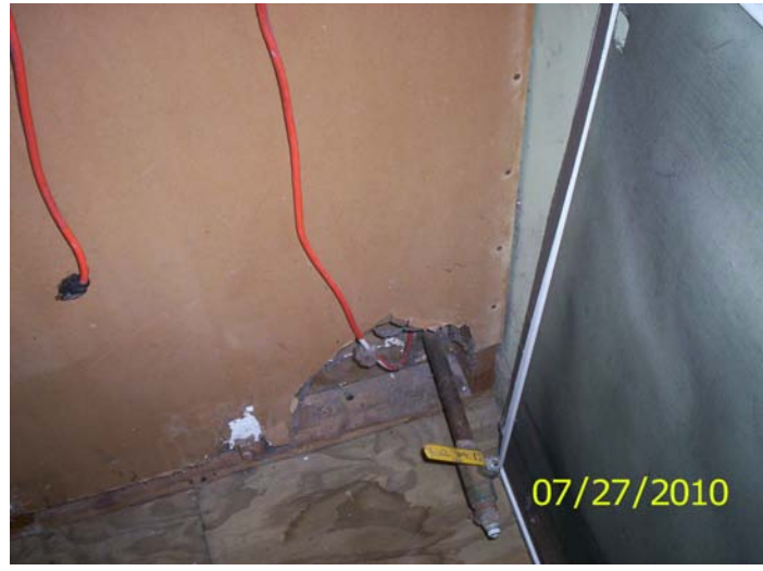
Extension cord wiring going into wall