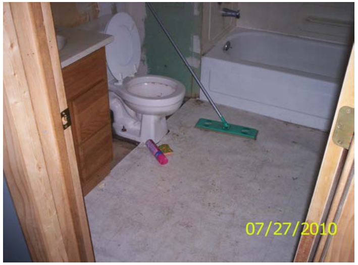
Unfinshed bathroom floor, no permit