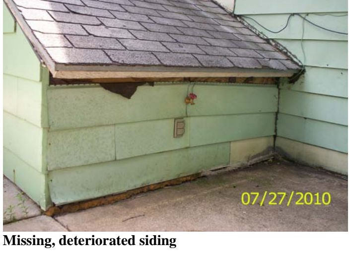
Open wall, improper electrical installation, no permits