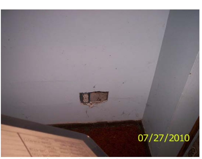
Hole in wall for electrical outlet installation, no permit