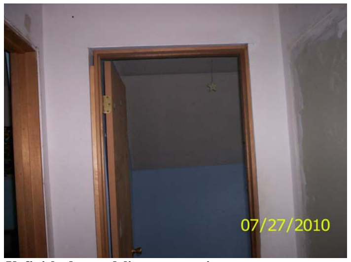
Unfinished remodeling, no permits