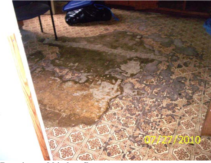
Deteriorated kitchen floor