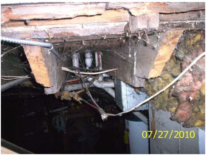
Improperly terminated floor joists, extension cord wiring