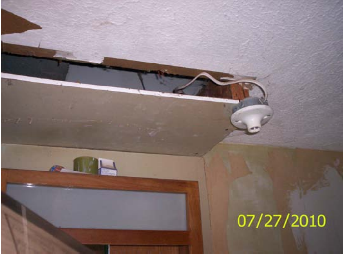
Improper electrical wiring in bathroom, no permit