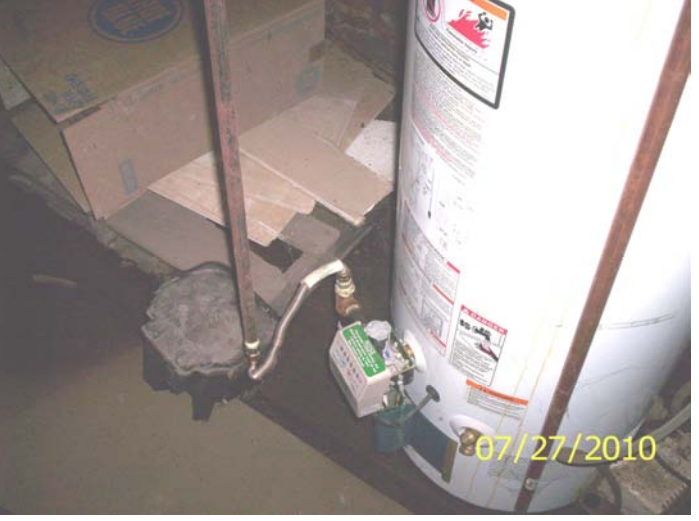
Fexible gas line connection crimped at both ends, t/p valve spill tube too close to floor, no permit for work