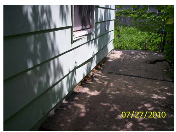
Siding coming off of wall