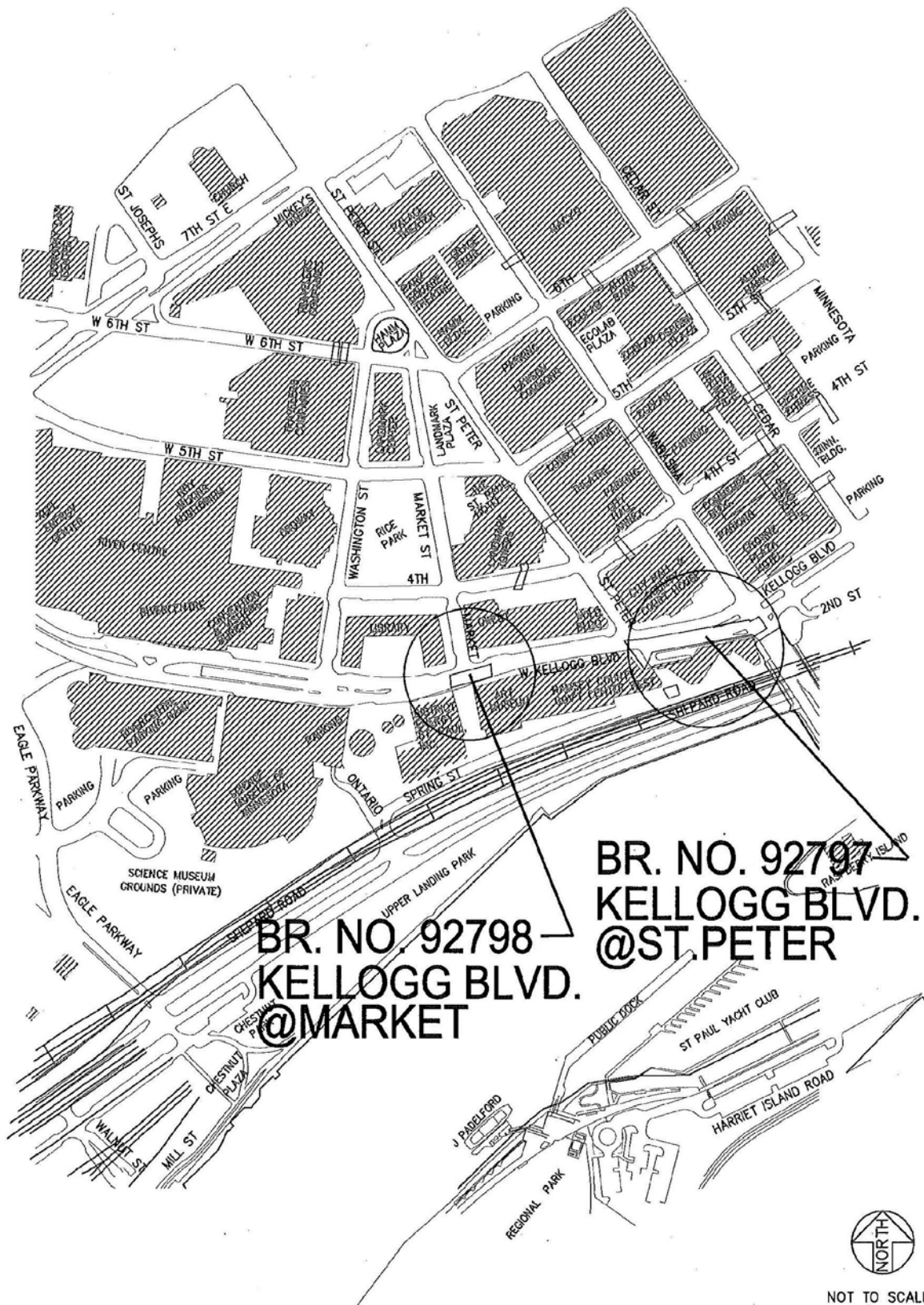
Figure 1. Existing Kellogg Boulevard Bridges Nos. 92797 and 92798