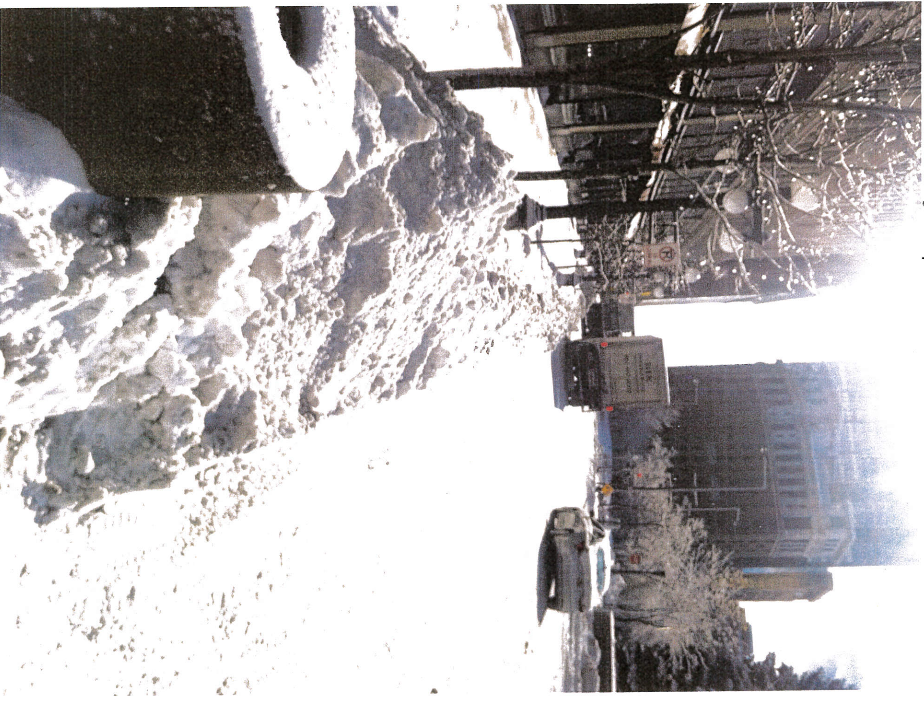
on a snowy, winter day