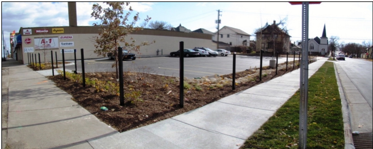
The HRA paved its property at St. Albans and University and is leasing it to two adjacent businesses for the cost of operating and maintaining it.