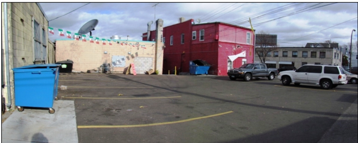
East and West Beauty Salon and Victoria's Best Steak House developed a shared parking lot at 860-866 University Avenue West.