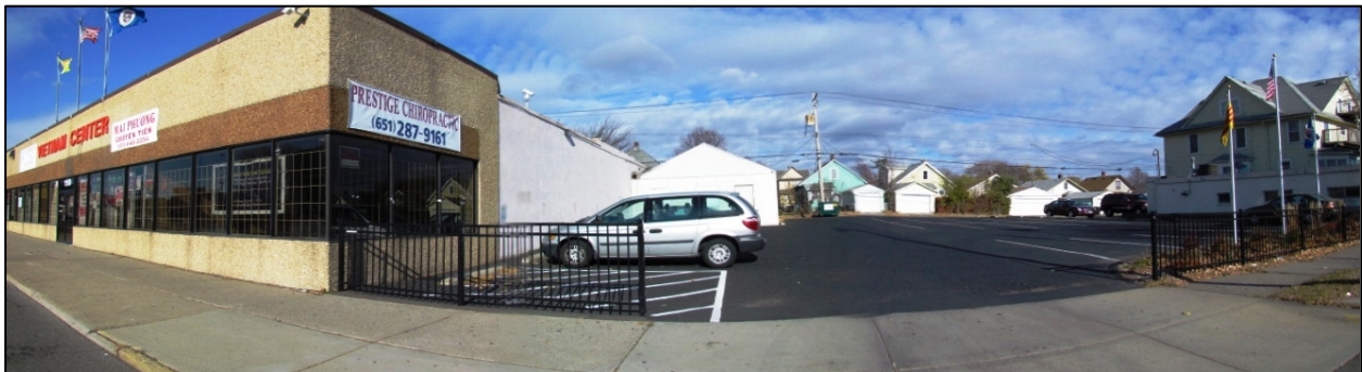
The Vietnam Center at 1159 University Avenue.