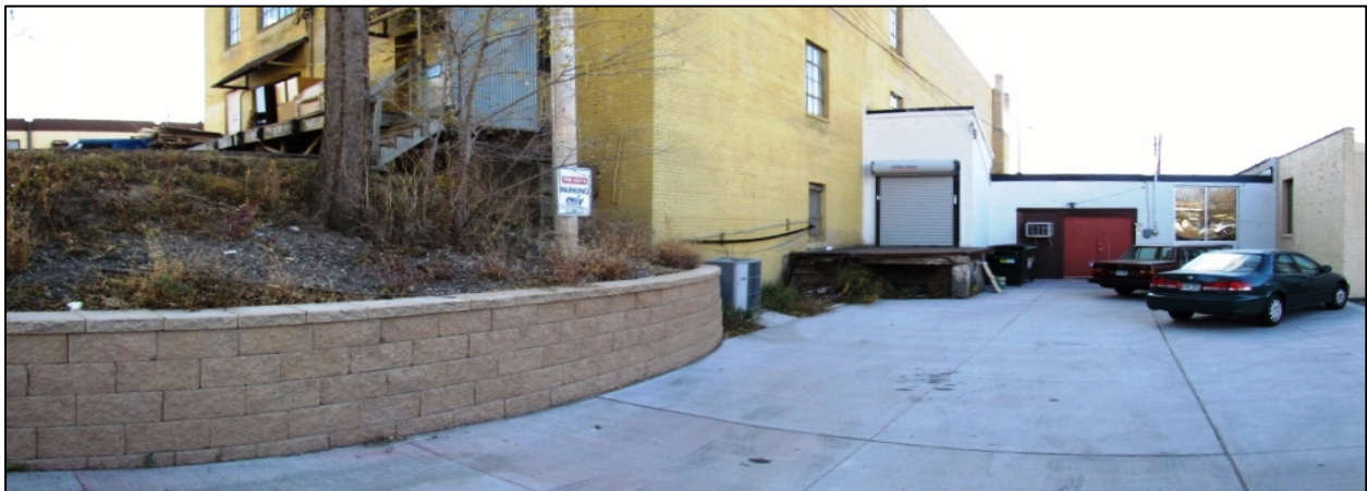
Design Press at 2447 University built a retaining wall and paved their parking lot.