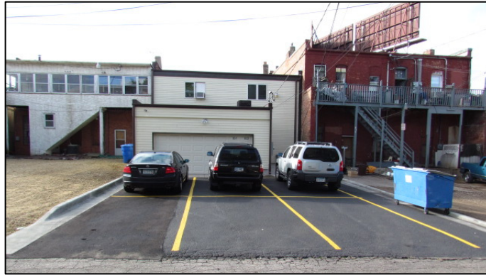
Safety Care Minnesota at 933 University.