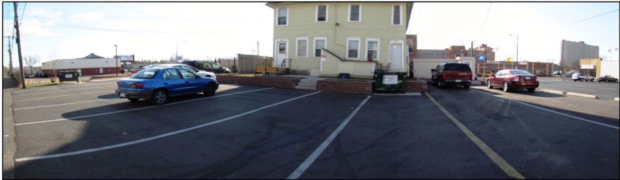
Three adjoining properties at 1133, 1137, and 1141 University share stacked parking.