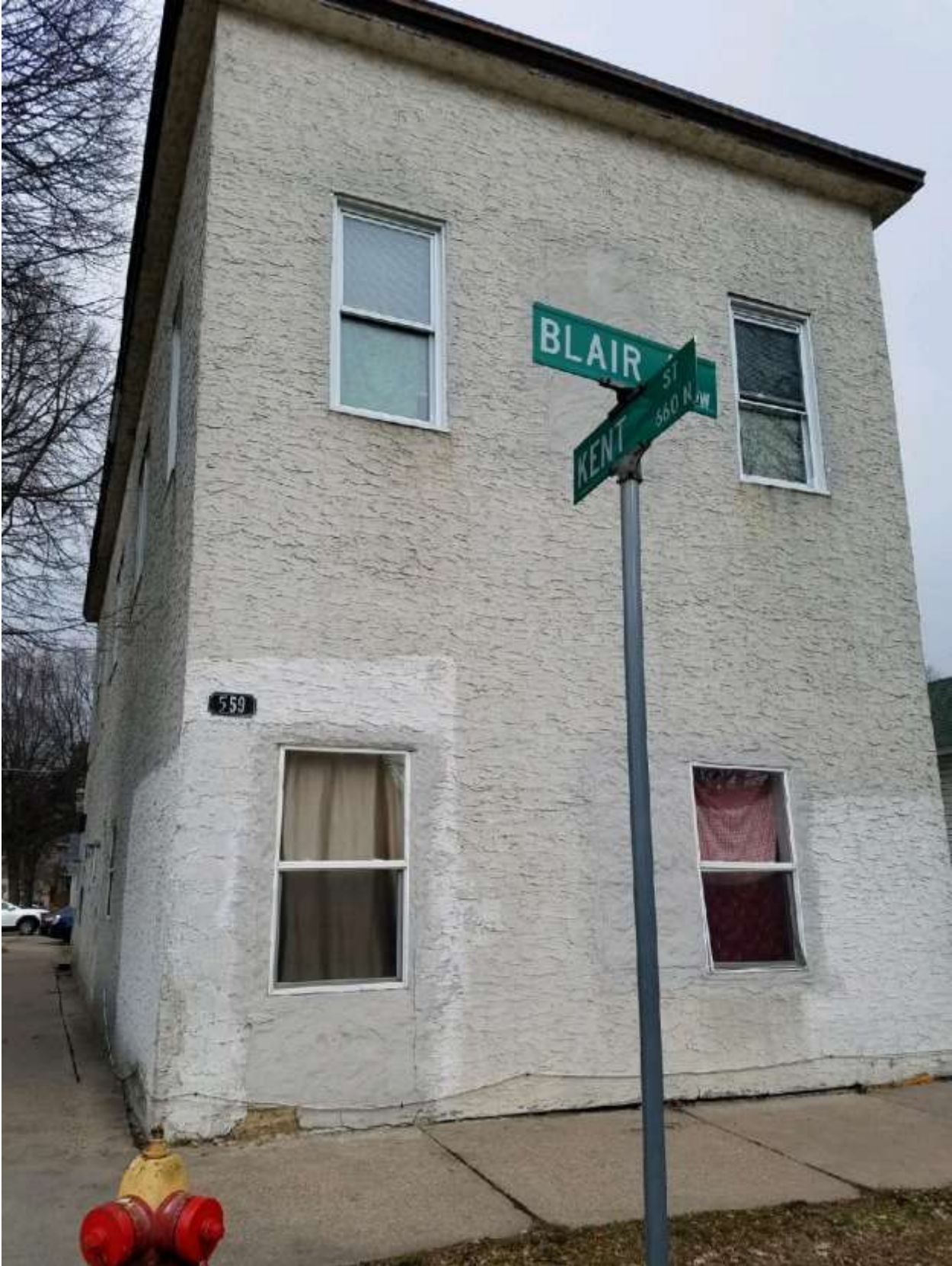
559 Blair Avenue.