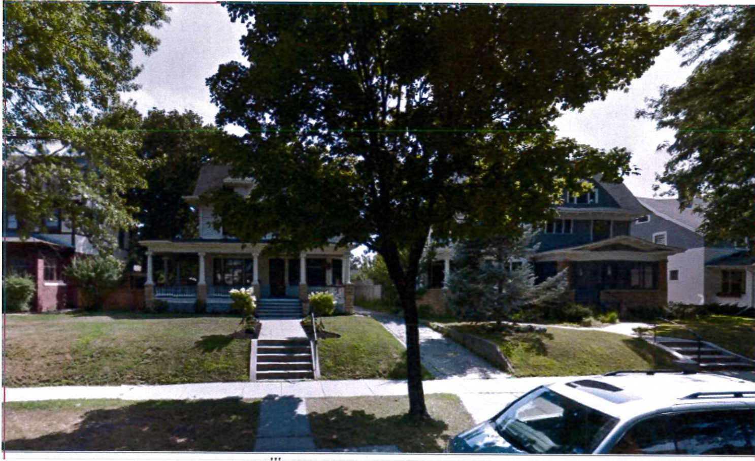
1186 Lincoln Avenue Is white house on left.