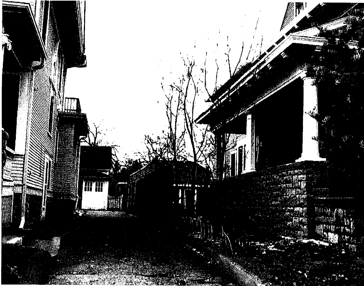
1186 Lincoln Avenue Photo of our driveway, Which is not shared. Fence is owned/maintained By occupants of 1188 Lincoln