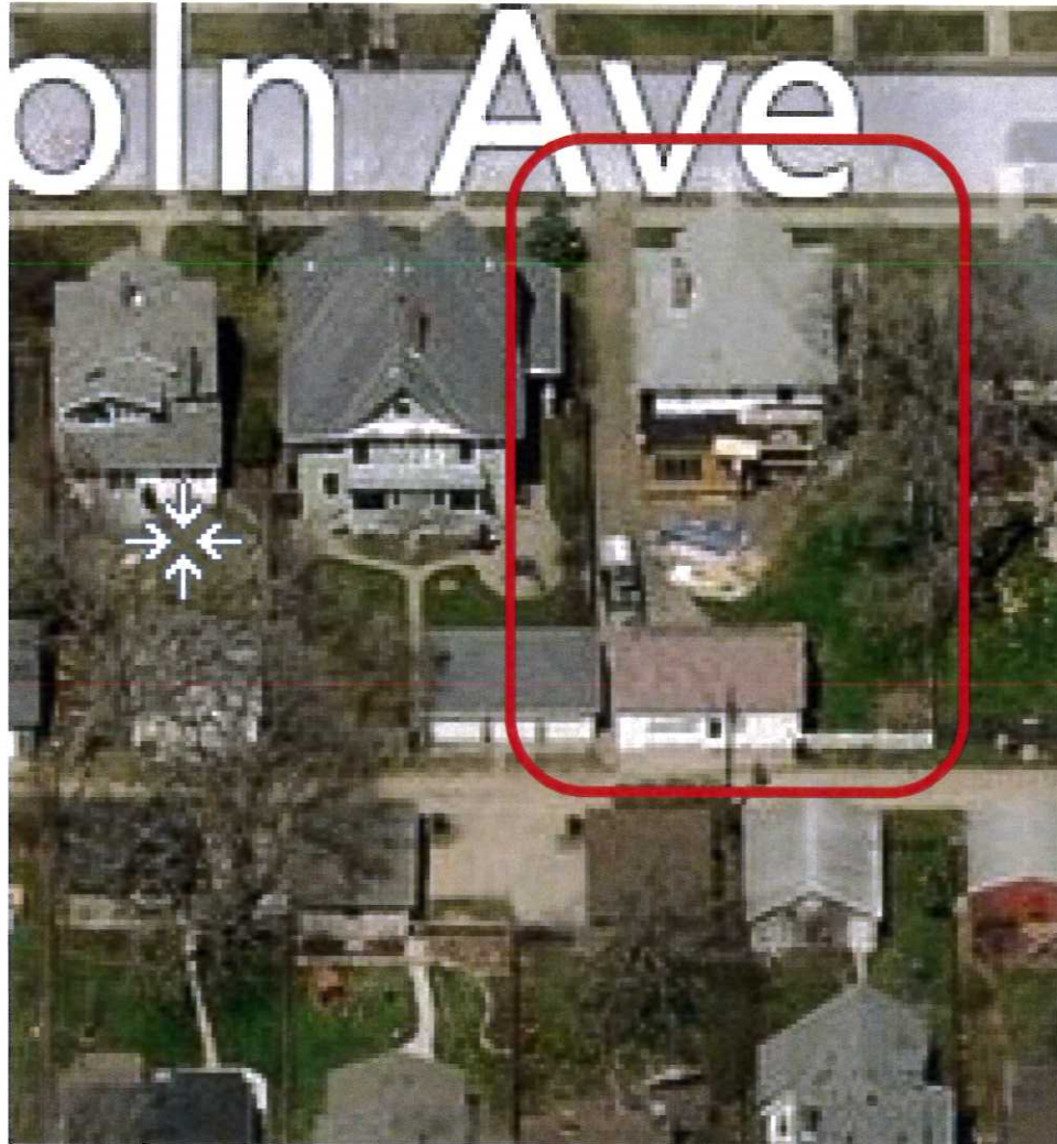
1186 Lincoln Avenue