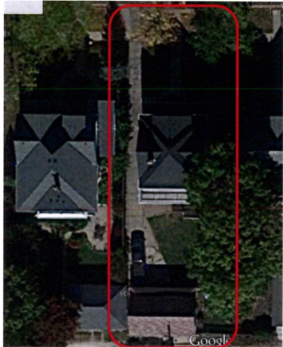
1186 Lincoln Avenue