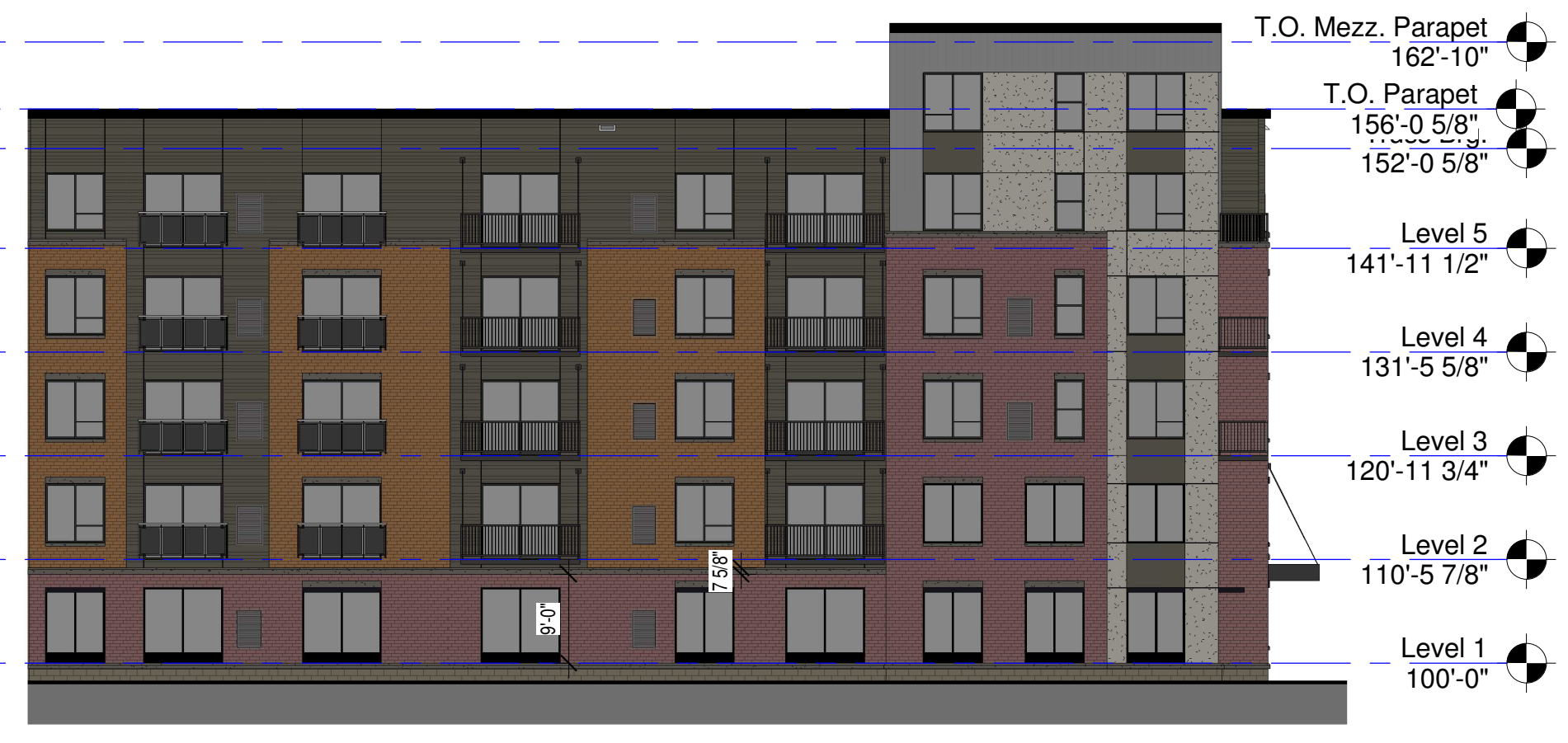
③ NW Elevation Marketing 1/16" = 1'-0"