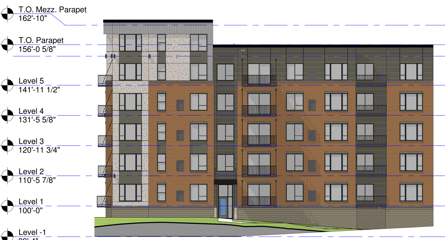
① NE Elevation Marketing 1/16" = 1'-0"