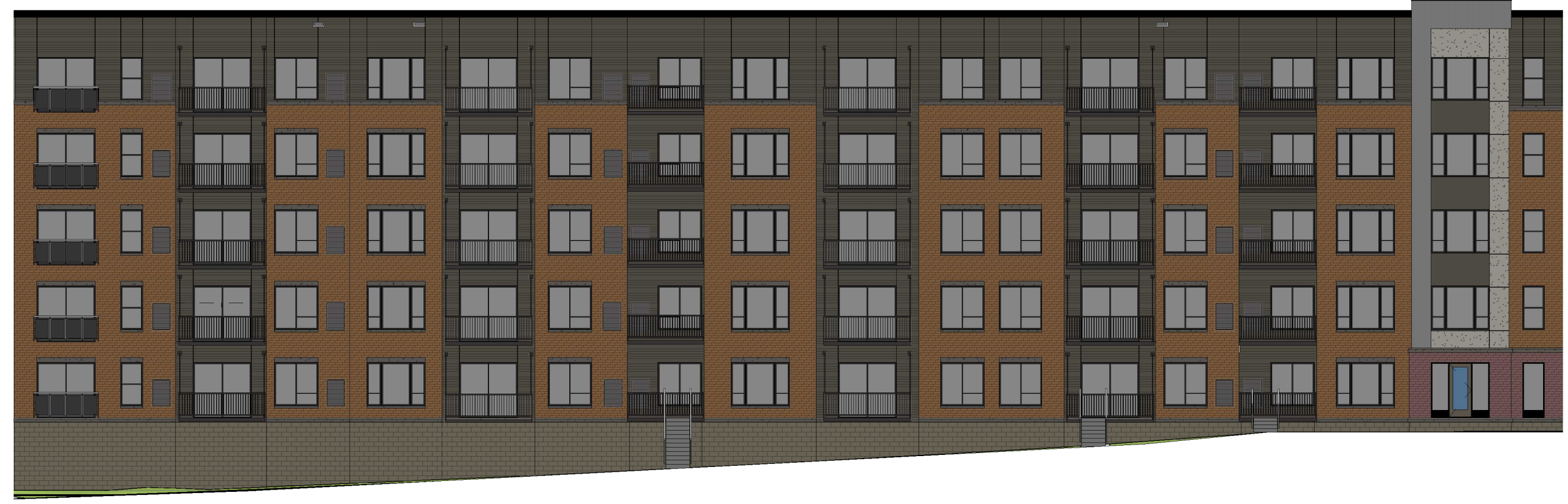
④ North Elevation Marketing 1/16" = 1'-0"