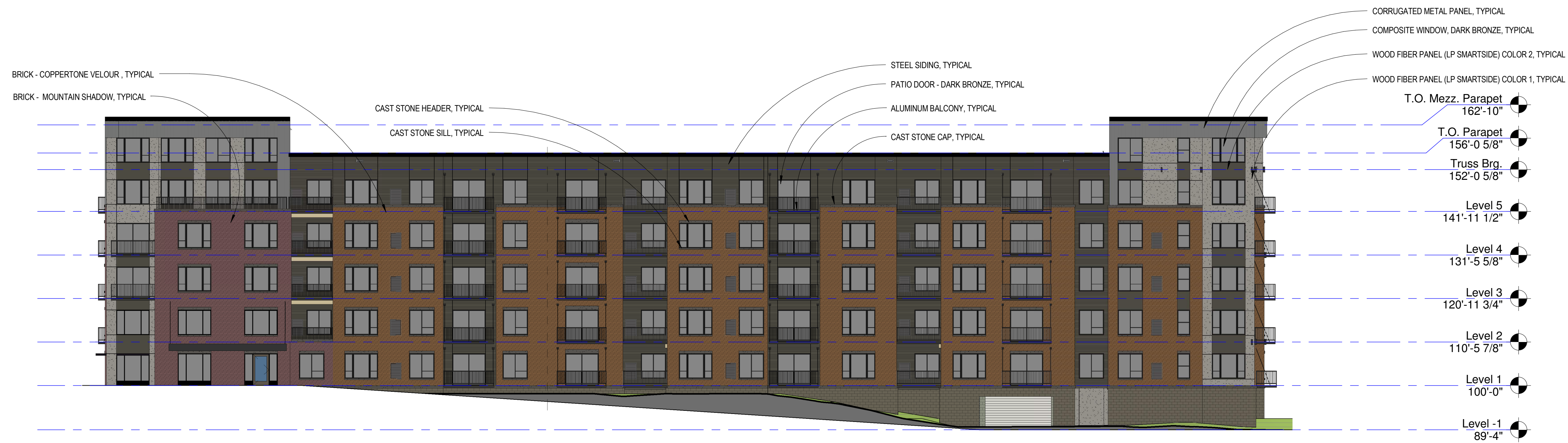
② SW Elevation Marketing 1/16" = 1'-0"