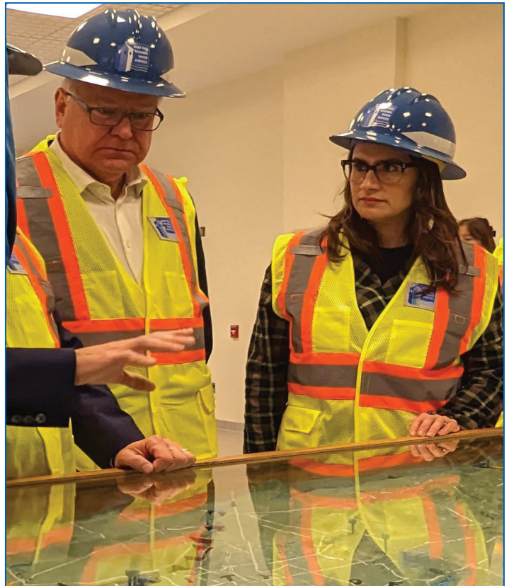
Governor Tim Walz and Lieutenant Governor Peggy Flanagan visit the treatment plant prior to their press conference at the water utility on Jan. 26.