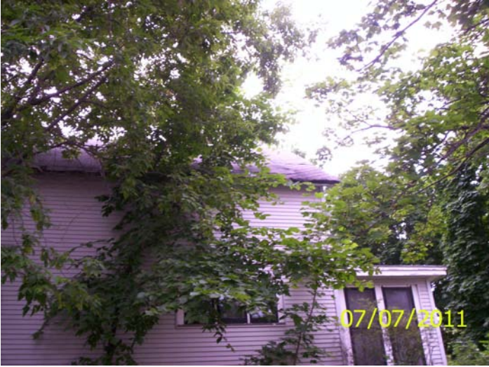
Missing shingles, damaged, open eave

HP District: Property Name: Survey Info: