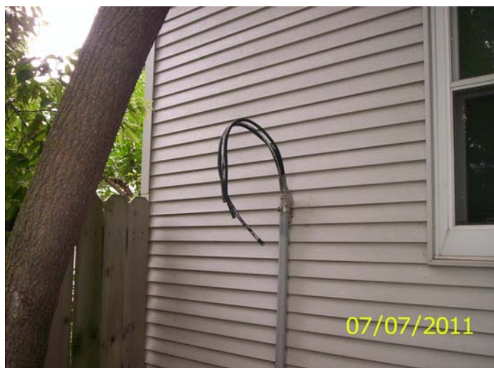
Unfinished electrical upgrade