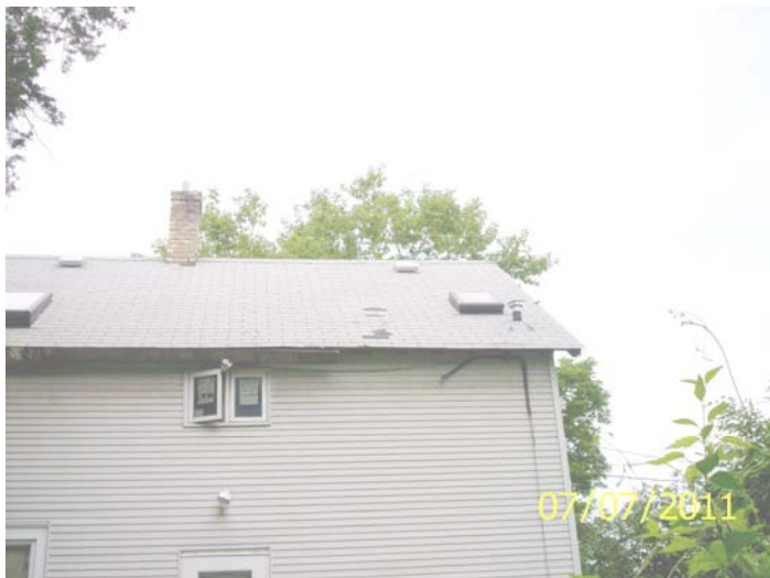
damaged, open eave