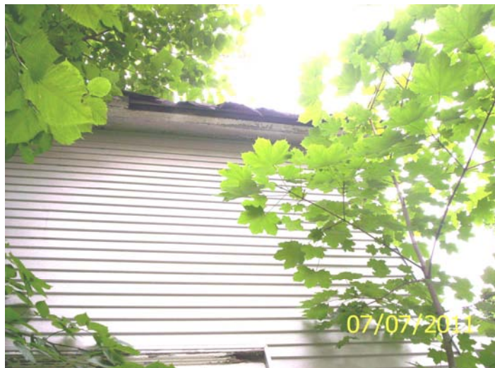
Damaged, open eave and roof