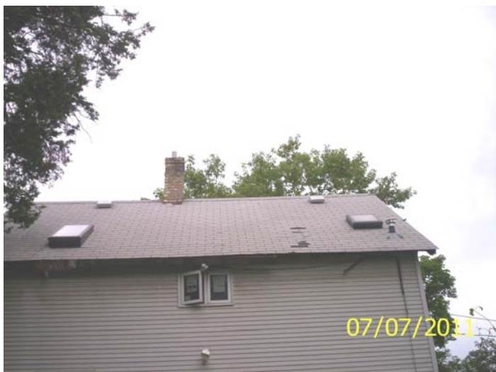
Missing shingles and chimney flashing