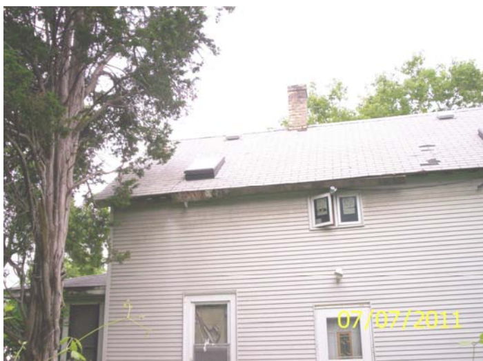
Rot damaged, open eave