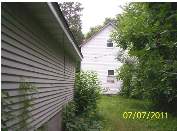
30-amp electrical service drop

HP District: Property Name: Survey Info: