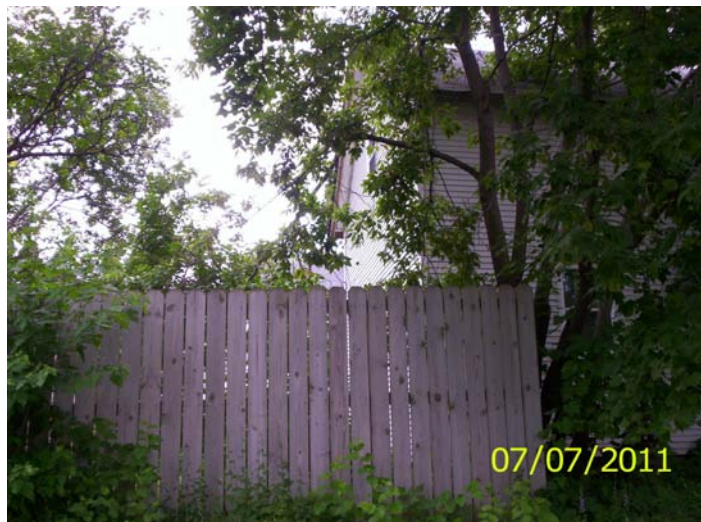
Eave and roof damage