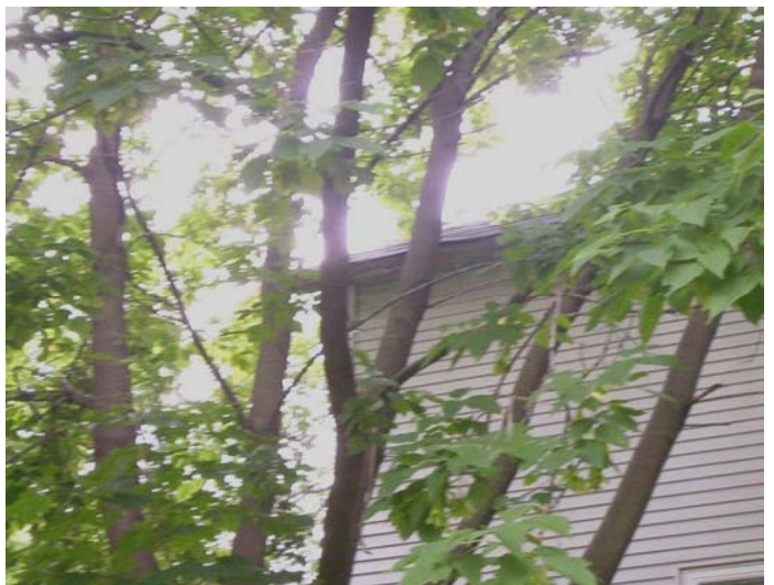
Eave damaged by tree and rot