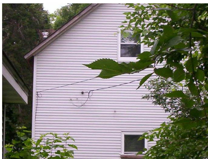
30-amp service drop (closer view)