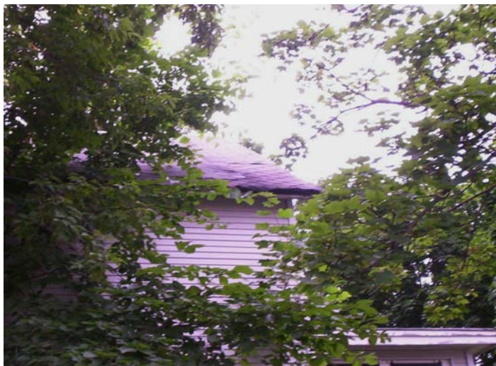
Closer view of missing shingles and damaged eave

HP District: Property Name: Survey Info: