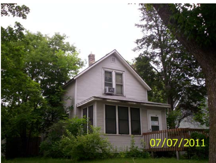
North and west sides