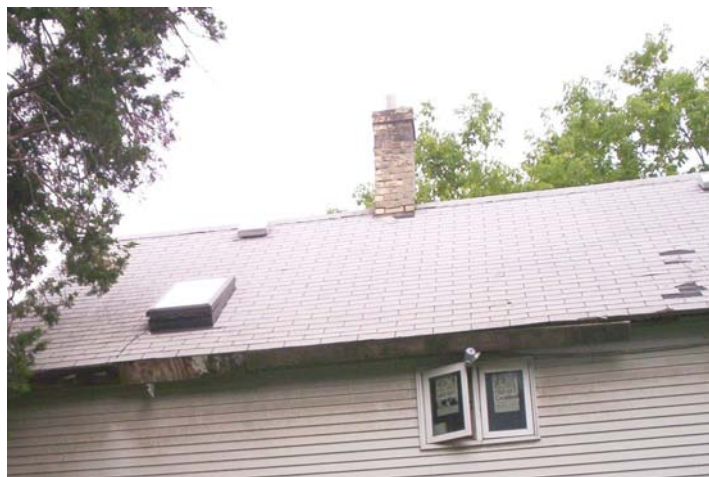
Missing shingles and chimney flashing (closer view)