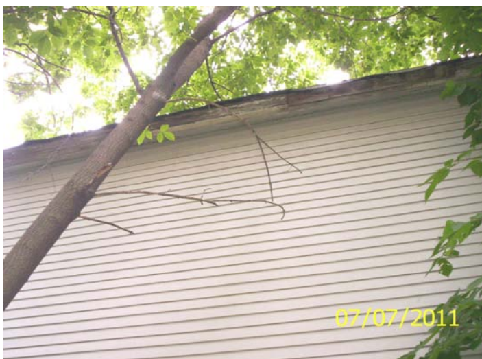
Damaged, open eave