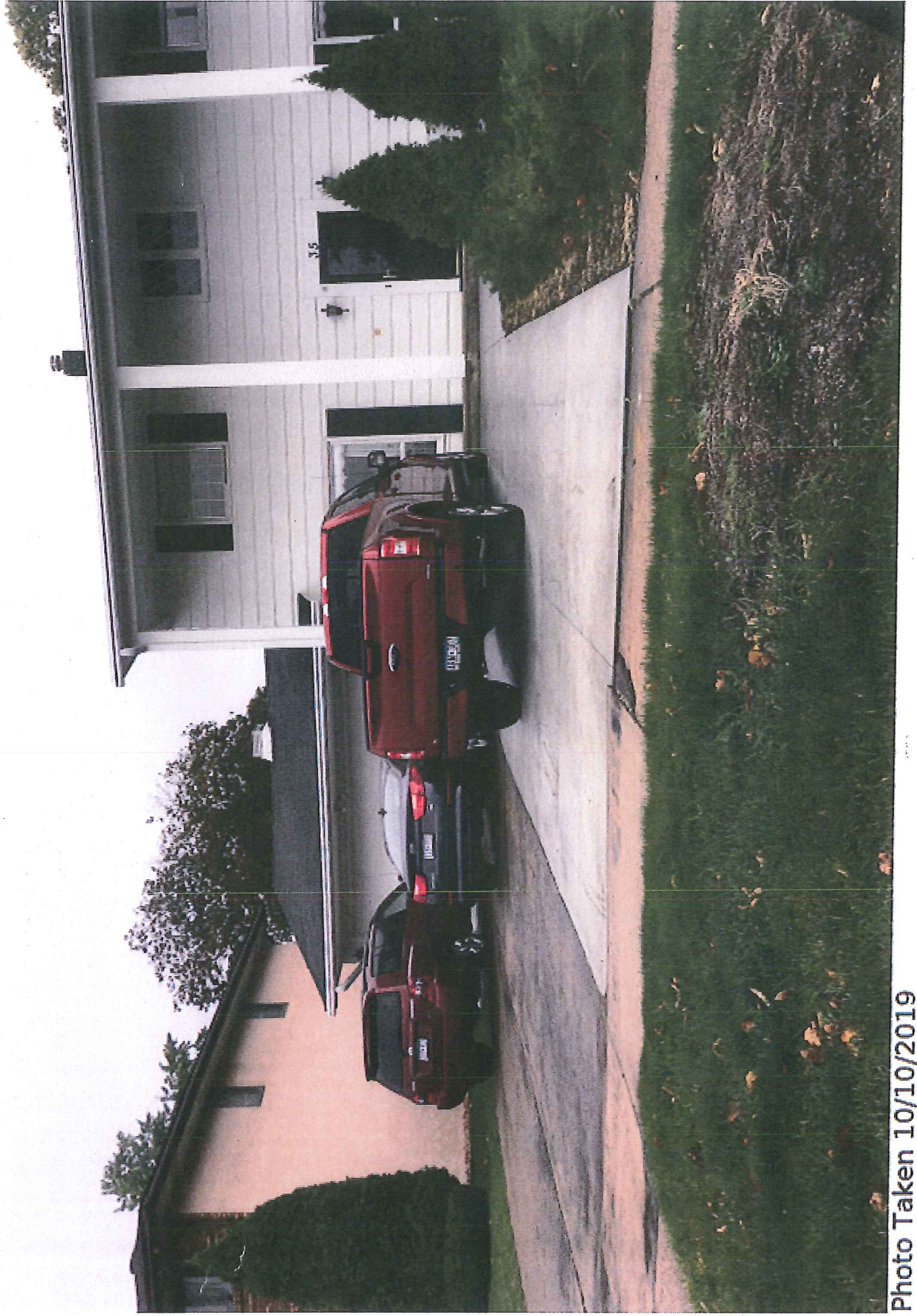
Photo Taken 10/10/2019