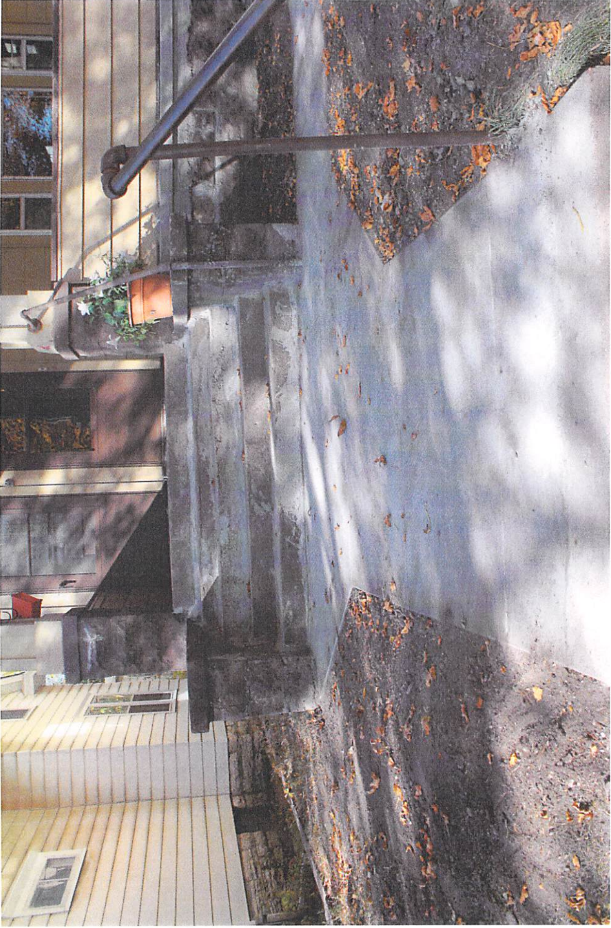
New Side walk - Inspected - Approved (Todd Suttex)