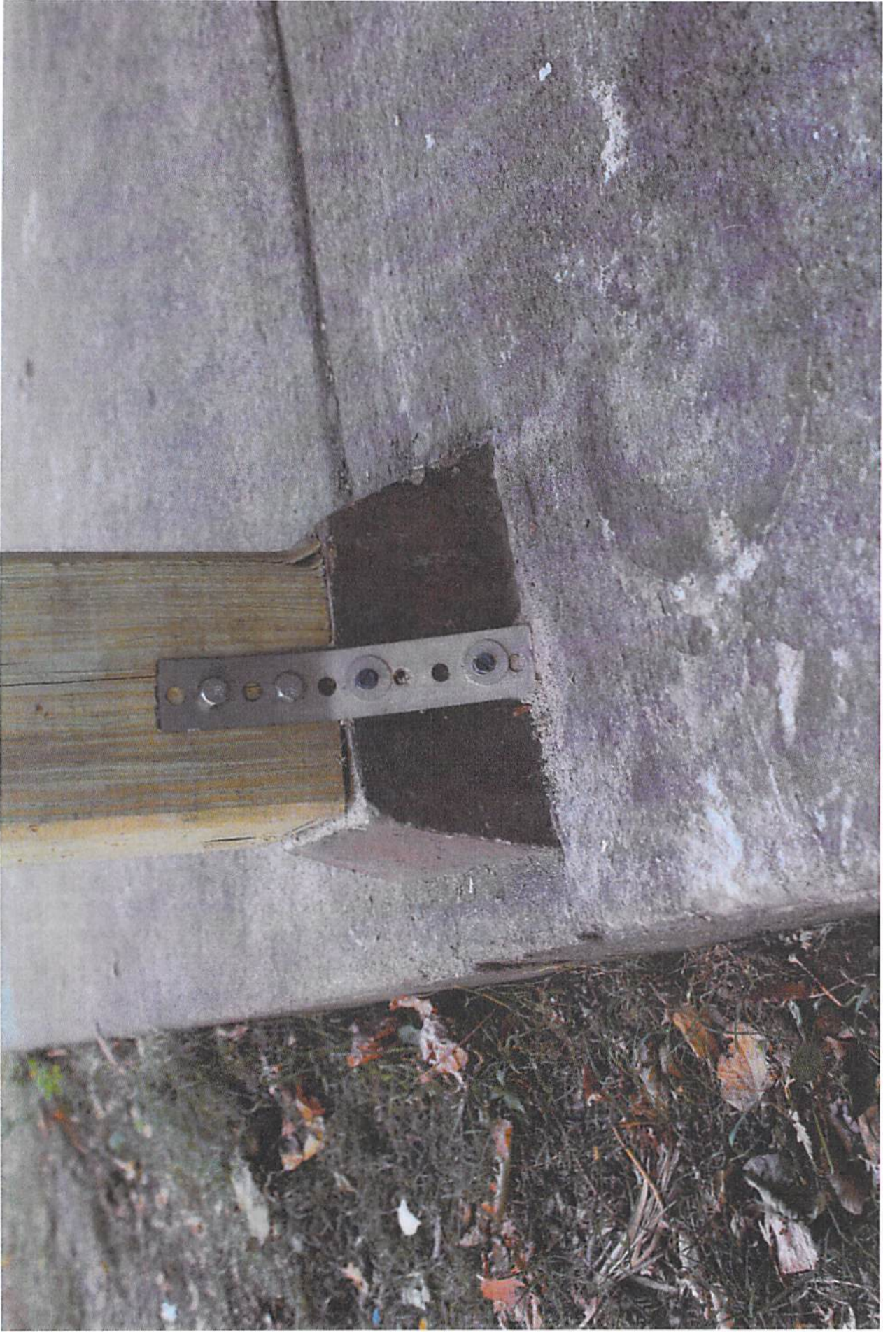
Post & Latch Repair Inspected & Approved