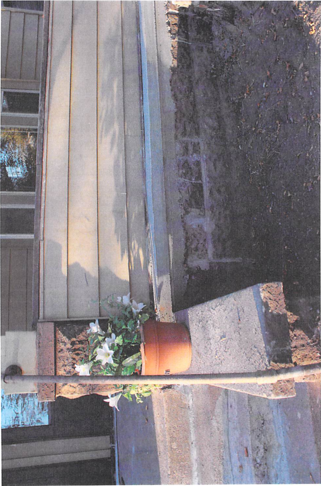
Front porch Repaired, Inspected, Approved