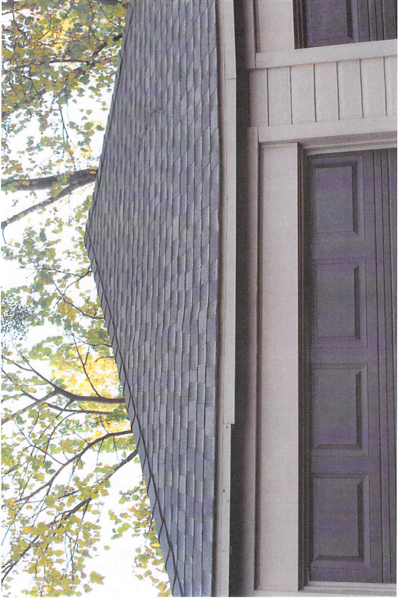
New Roof on Garage AND on House Inspected AND Approved.