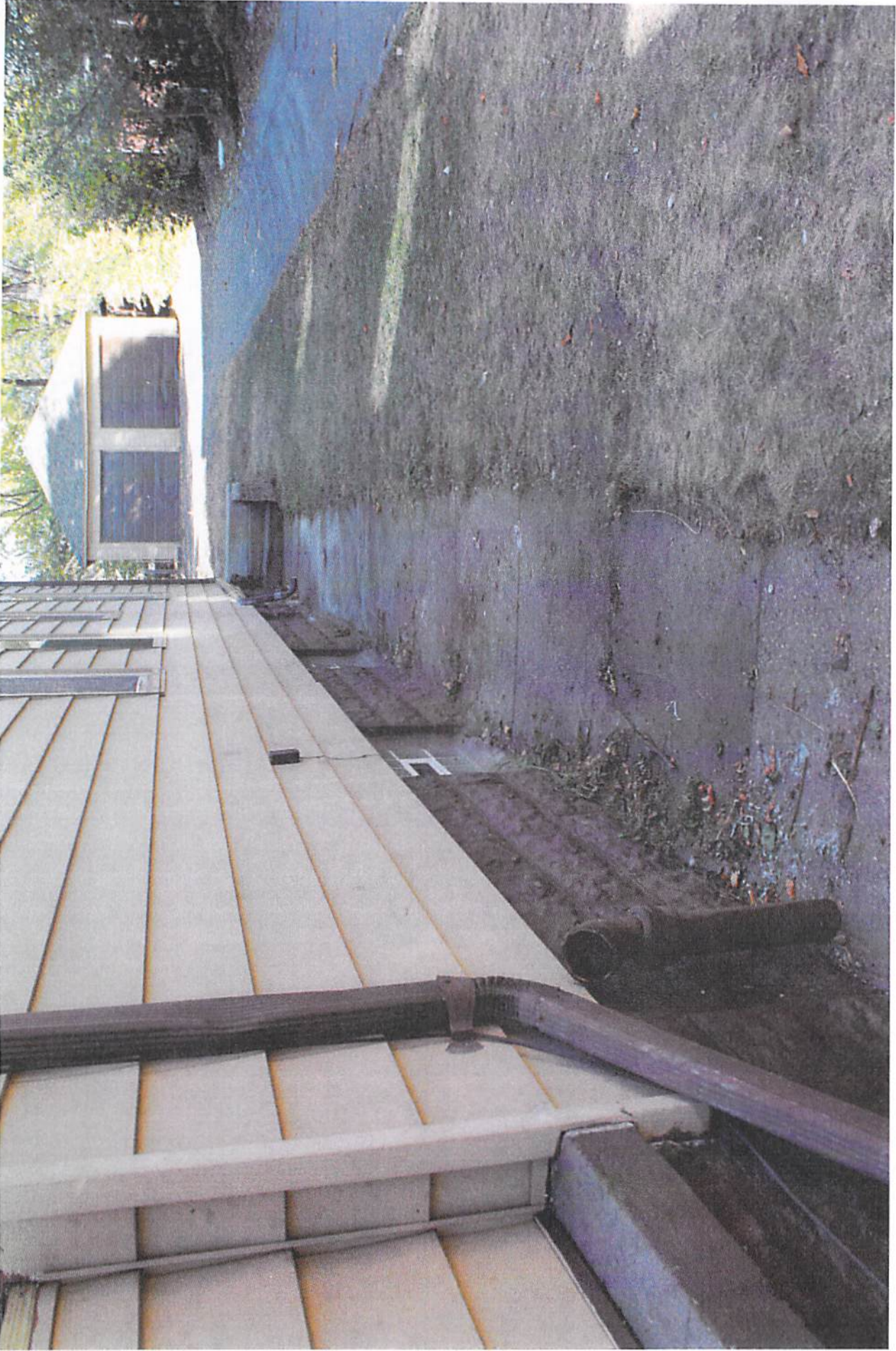
EAST Side Debris removed