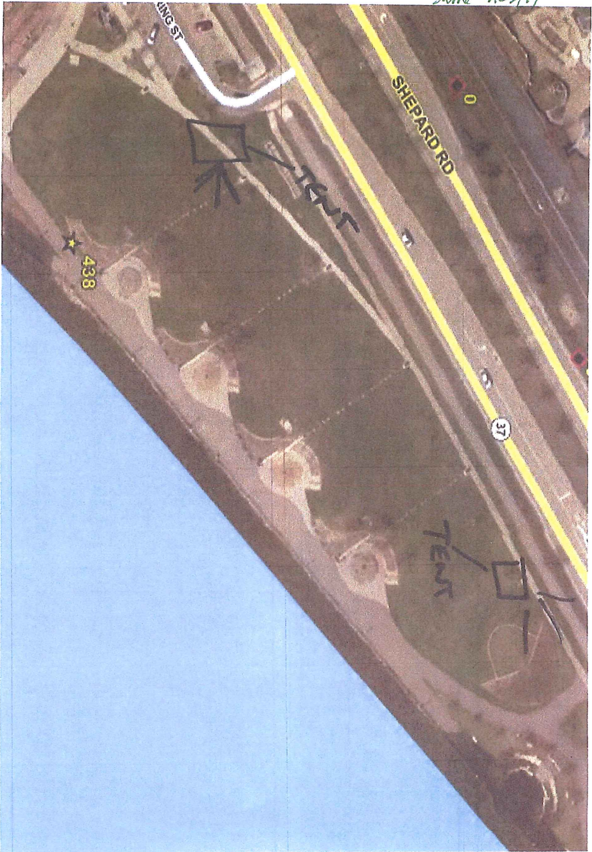
Upperlanding Park - Monster Dash