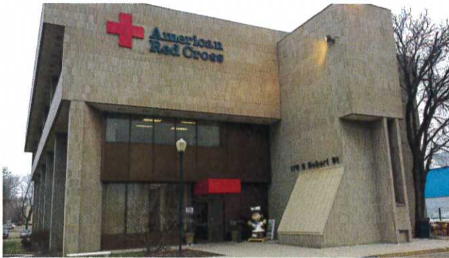
St. Paul Blood Donation Center – Plato Boulevard