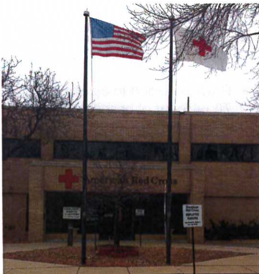
North Central Blood Services Fillmore Avenue