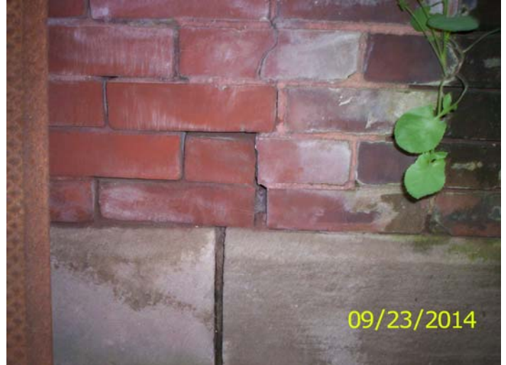
Deteriorated mortar joints, movement in bricks