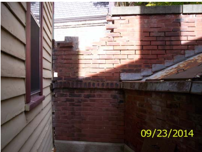
Deteriorated mortar joints