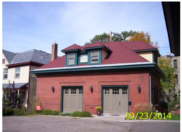
South and east sides