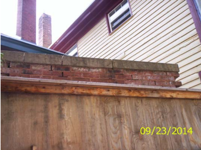
Deteriorated mortar joints

HP District: HPL-Hill Property Name: Survey Info: