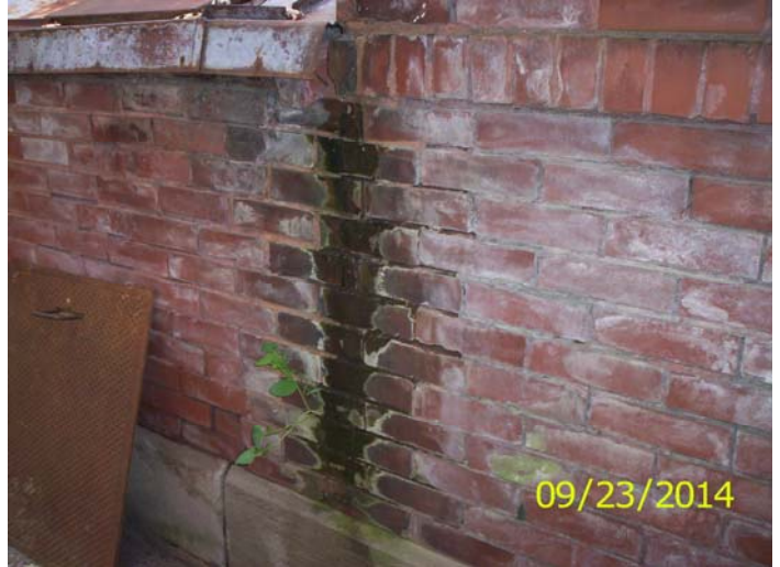
Water damage to masonry