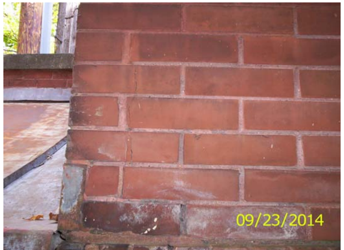
Vertical cracking through brick face