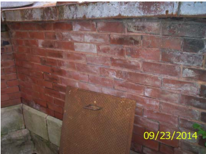
Deteriorated mortar joints