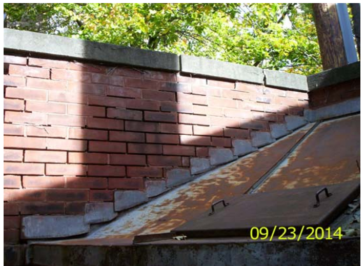
Deteriorated mortar joints