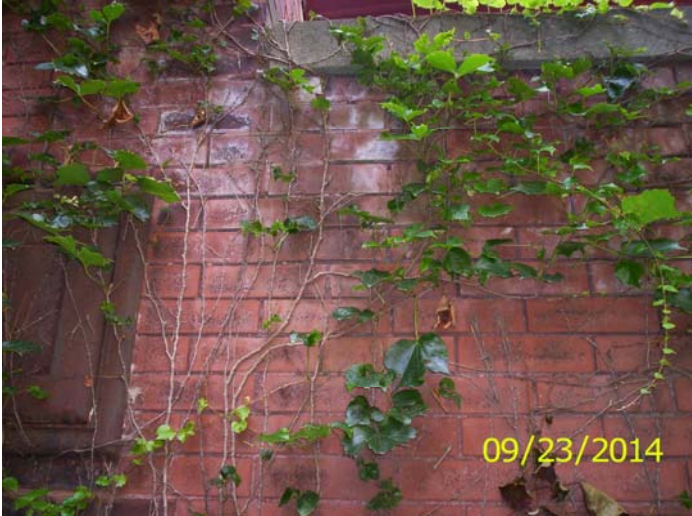
Deteriorated mortar joints

HP District: HPL-Hill Property Name: Survey Info: