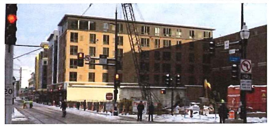
Eastbound view of Washington Ave in Stadium Village

development along Snelling Avenue South. However, increased density leading to higher property tax revenues can still be achieved with T2 zoning. Opening up all of South Snelling Avenue to T3 zoning along its length will destroy the fabric of Macalester Groveland community and divide it in two. This is why T3 zoning is a bad idea for