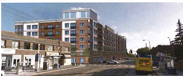
Perspective of LeCesse development at Snelling/St. Clair Avenues

will look like if T3 Zoning is approved. Snelling Avenue will be lined with Big Box apartment buildings, creating a canyon appearance, in the same way that Stadium Village near the University is becoming walled in with six-story apartment buildings. Residents of Macalester Groveland have spoken out against the 71-foot tall LeCesse structure nearly one block long . We do not want Snelling Avenue to look like this! It is important to note that residents do not oppose higher density or commercial