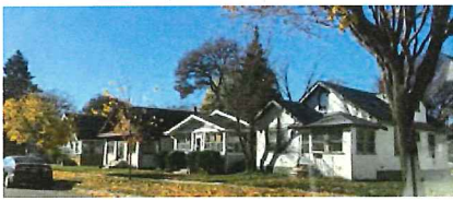
One and a half story single family dwellings on Snelling south of St. Clair Ave.

I am writing to express my opposition to the potential rezoning of Snelling Avenue South toward higher density development. Macalester-Groveland is a one to two-story residential neighborhood. Perhaps