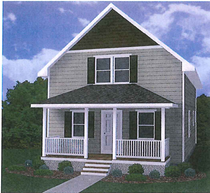
IMAGE MAY NOT REFLECT ACTUAL CONSTRUCTED HOUSE