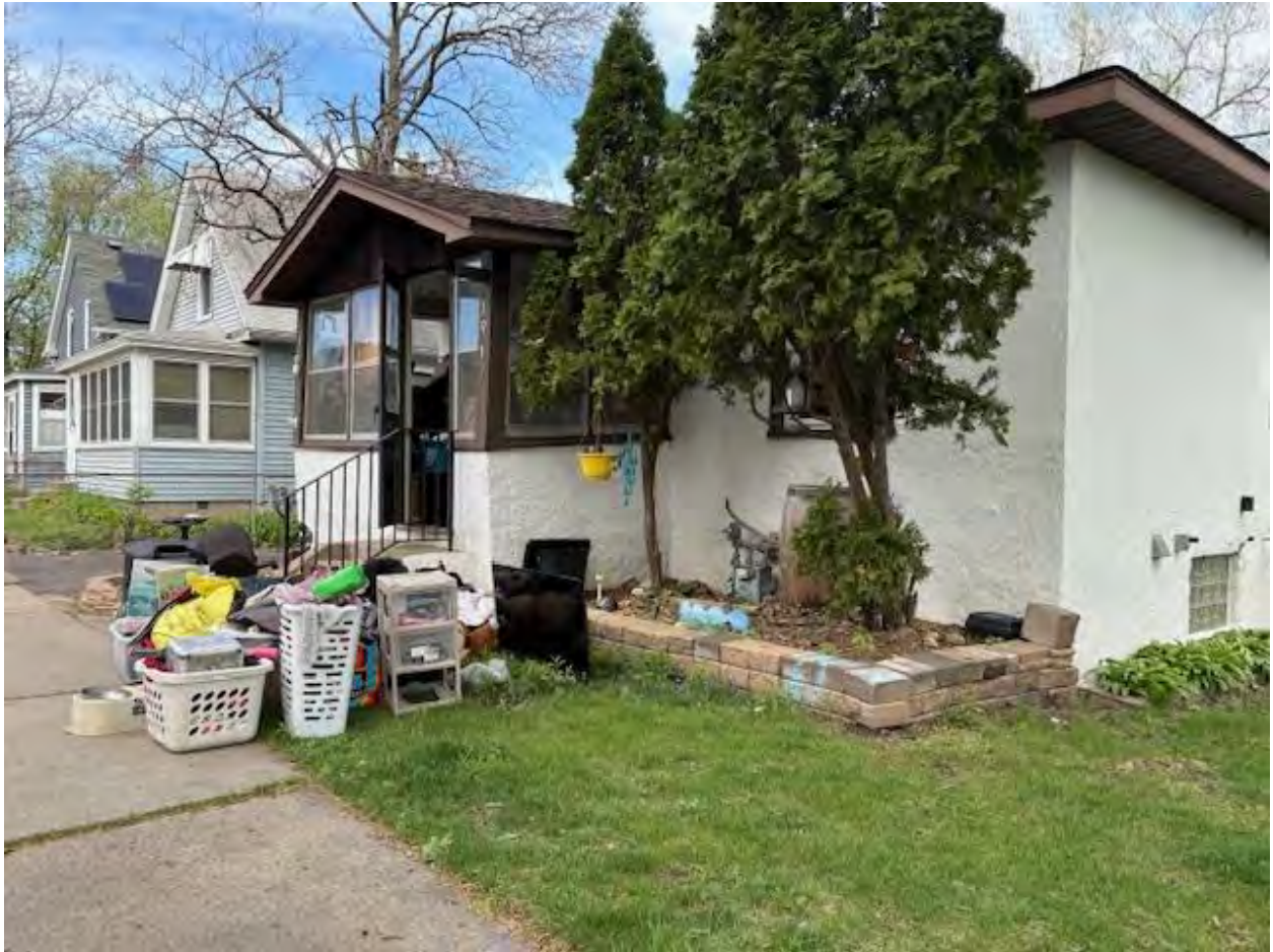
1917 Taylor Ave April 29, 2026, Images