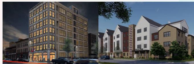
Pictured: Rendering of Bimosedaa and Emerson Village