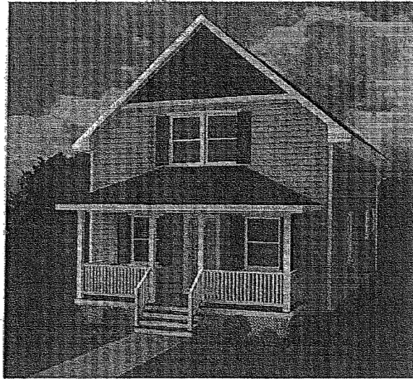
IMAGE MAY NOT REFLECT ACTUAL CONSTRUCTED HOUSE