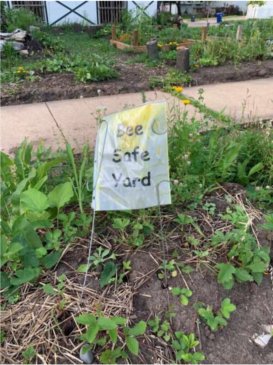
199 Duke St