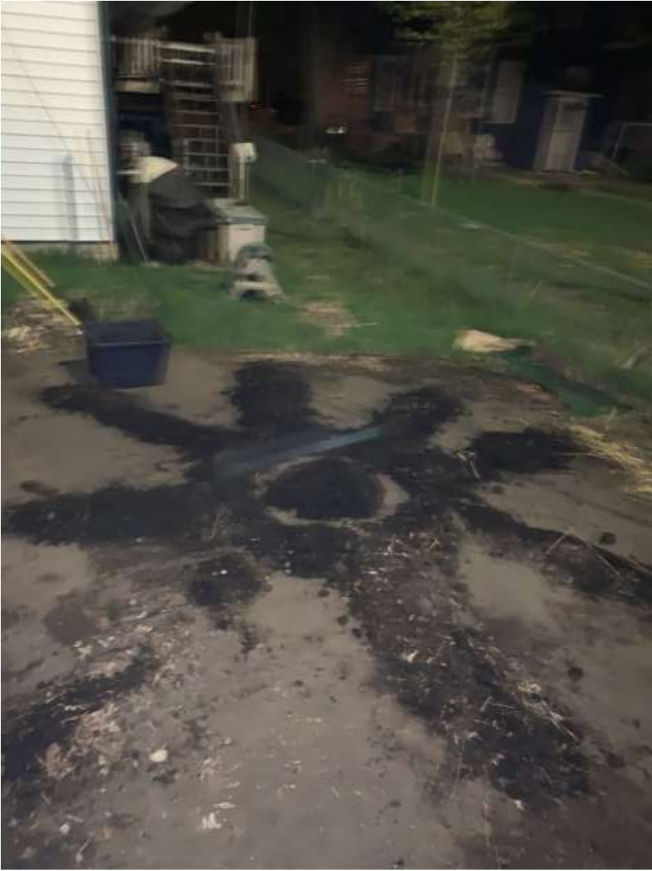
Three Sisters Backyard Garden