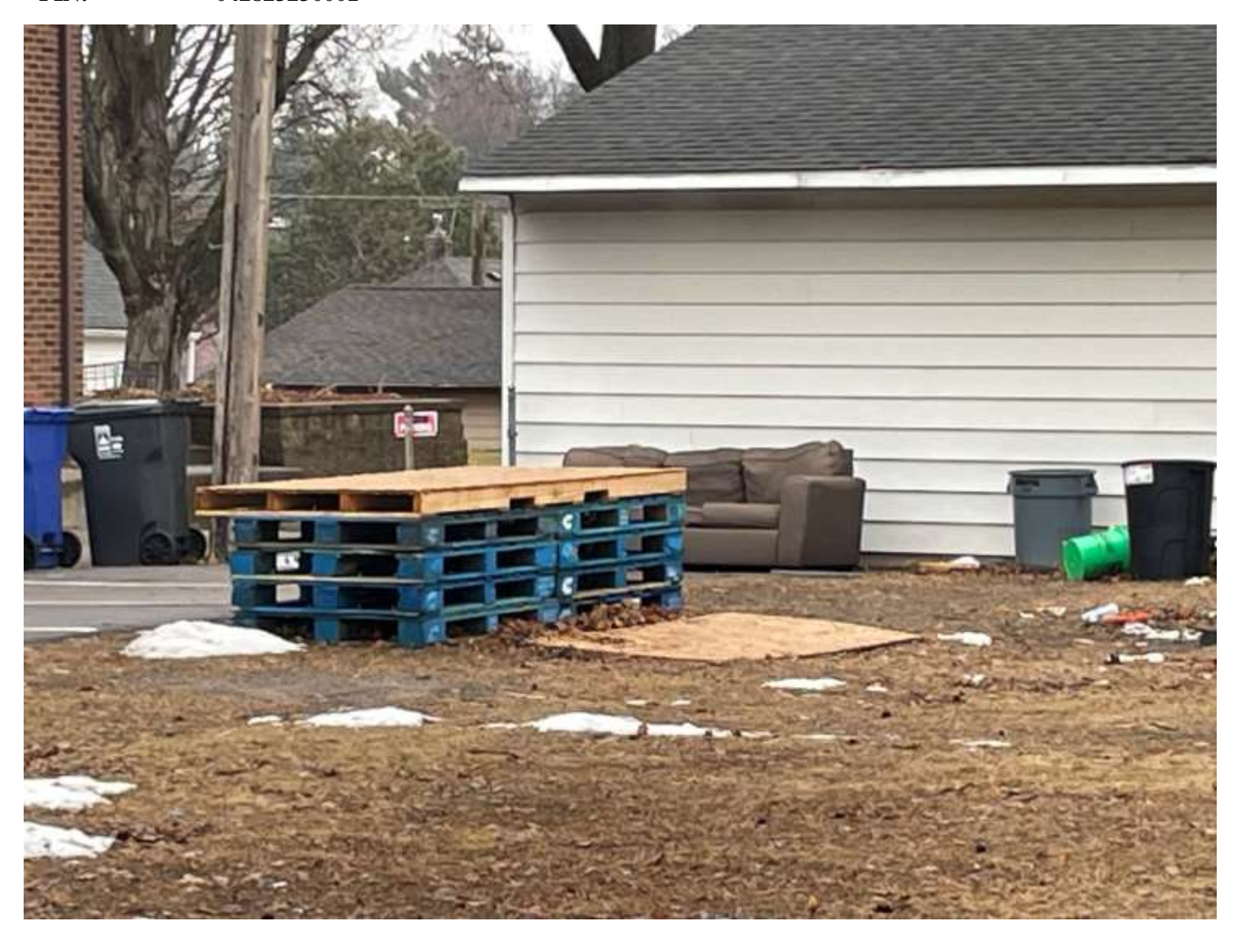
BEFORE PHOTO. Appellant stated the brown couch on this photo was taken, which belonged to the neighbor