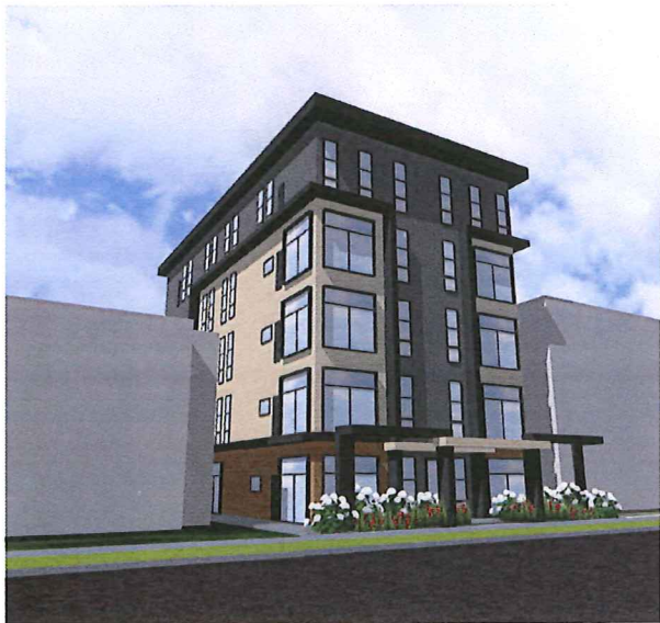
view from Grand