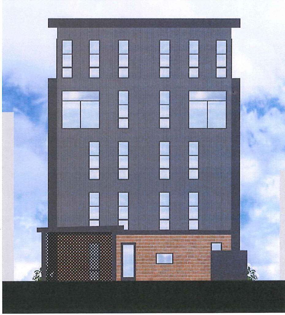
SOUTH (GRAND AVE) ELEVATION