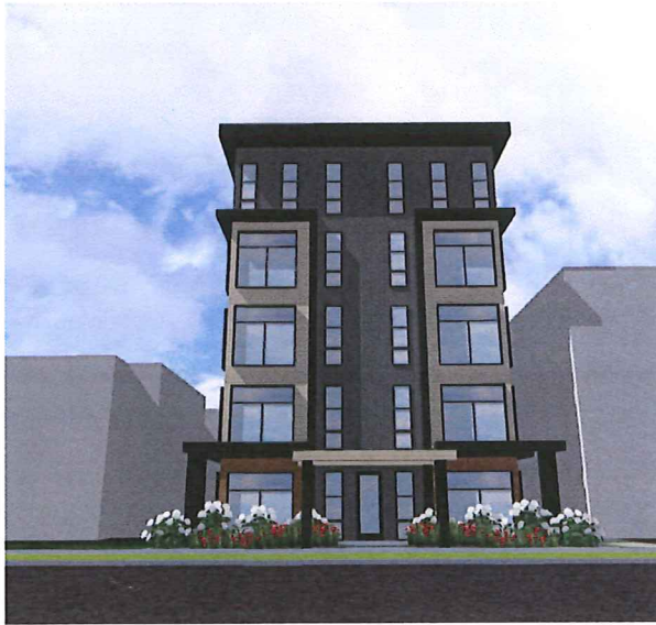
south elevation (Grand)