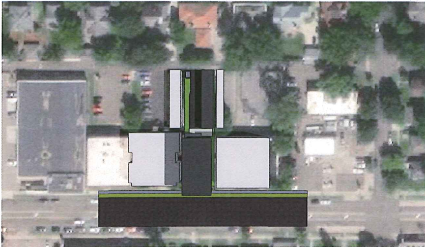
June 21st 9am