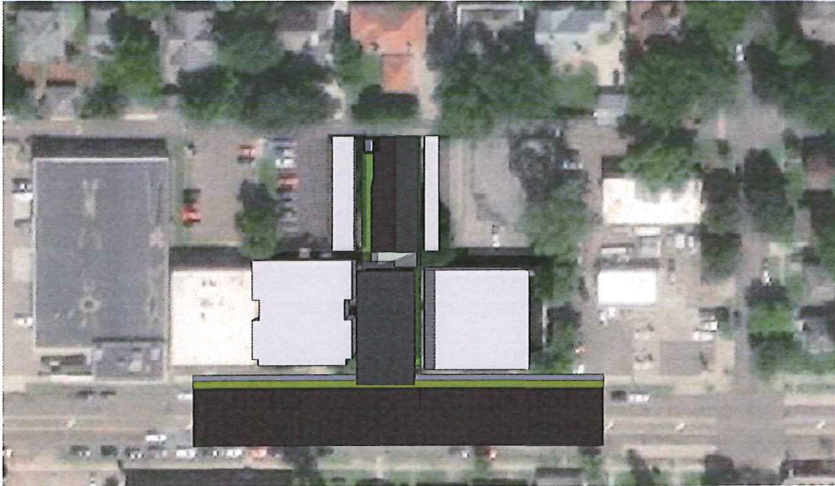
June 21st 3pm