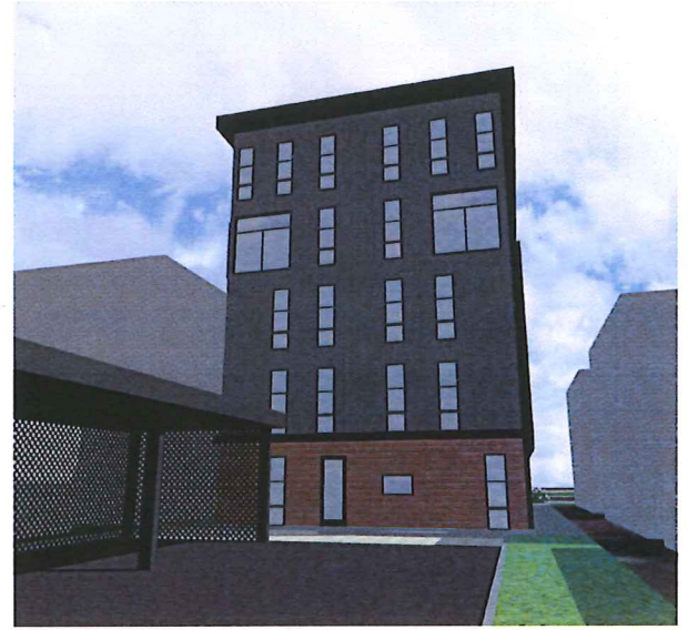
view from back of building