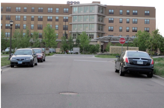
View northwest from center of Madson Street.