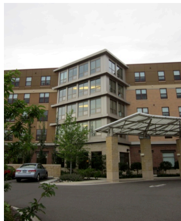
View of Senior Living Campus (2008 drawing with Views to River Bluff labeled). The five-story glass element containing a sunroom lounge on each resident floor is aligned with Madson Street right-of-way.