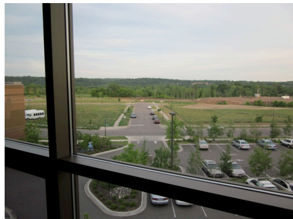
View from fourth floor (approximately 35 feet high).

Hundreds of current and former residents and family members of the Shaller Campus obtained great pleasure and fulfillment in watching the changing of the seasons and nature beauty of the distant river bluffs. These views will be forever blocked for thousands of future residents under the current master plan that allows buildings of 65 feet in height to be constructed across previously defined public right-of-way.