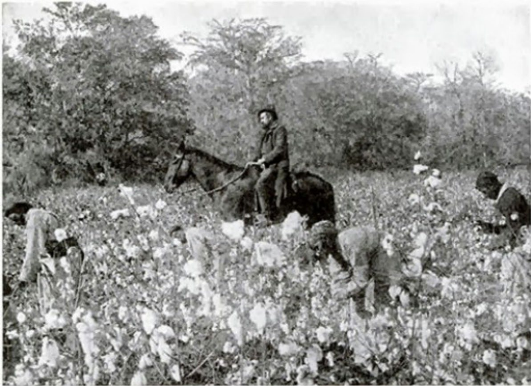
PICKING COTTON From Department of Agriculture Bulletin, "The Cotton Plant."

View: https://www.youtube.com/watch?v=83eJfEFFZ74 (The Rise of Cotton: Crash Course Black American History)