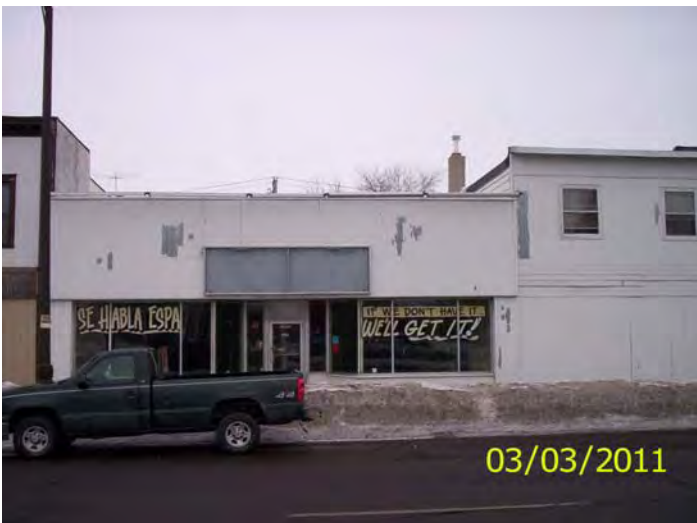
South side, posting