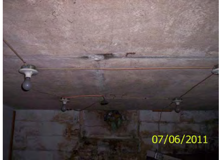
Water damaged ceiling and wall, mold