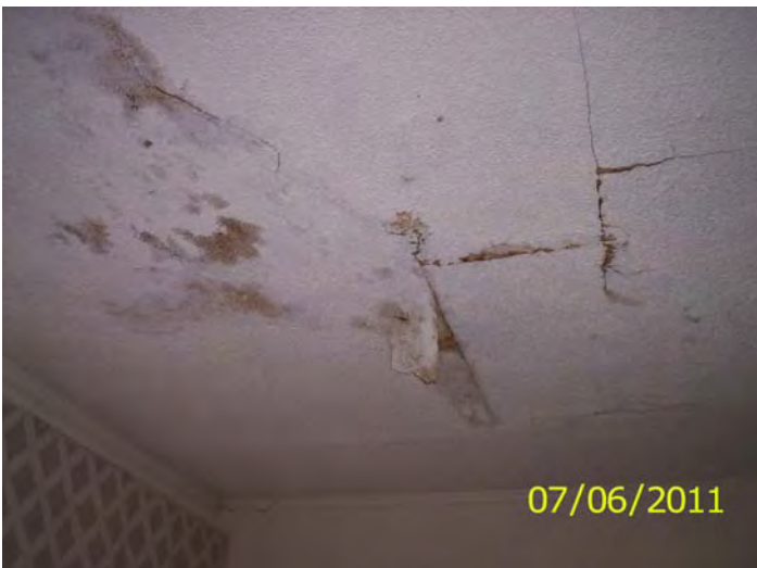
Water damaged ceiling, apartment