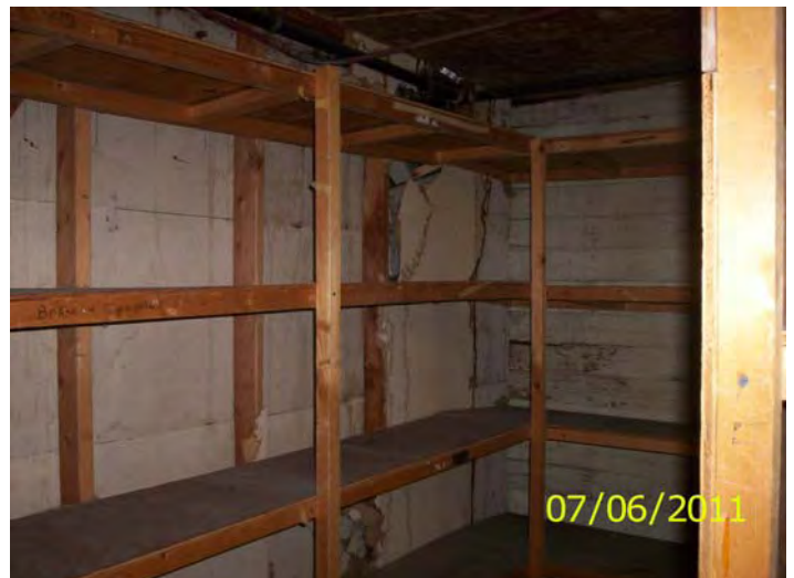
Water damaged wall