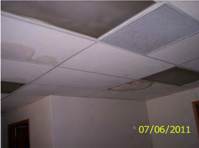
Water damaged ceiling

HP District: Property Name: Survey Info: