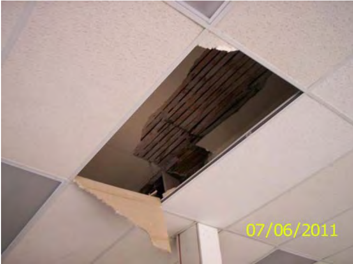
Water damaged and partially collapsed ceiling

HP District: Property Name: Survey Info: