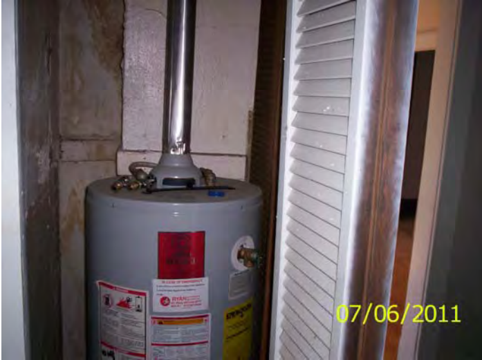
Water heater installation

HP District: Property Name: Survey Info: