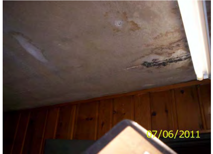
Water damaged ceiling, mold