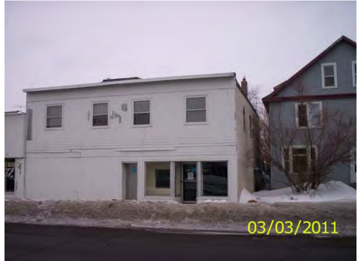
East and south sides