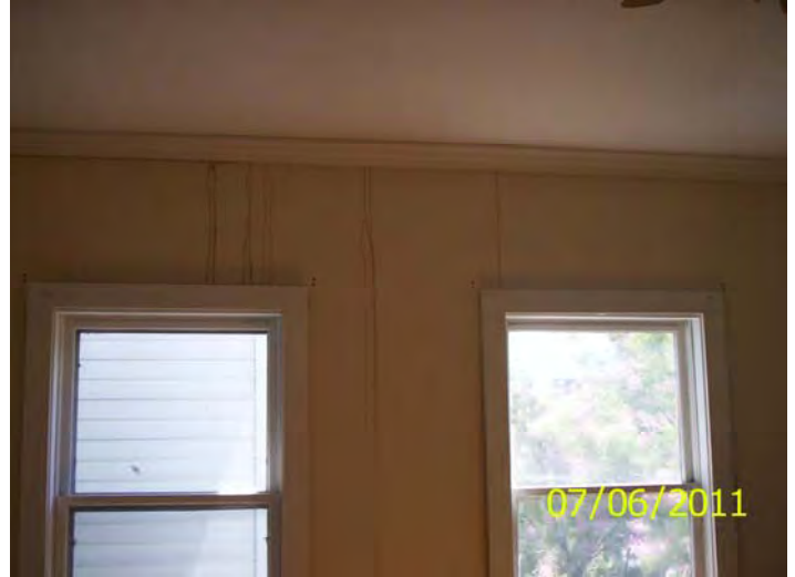
Water damaged ceiling and wall, apartment