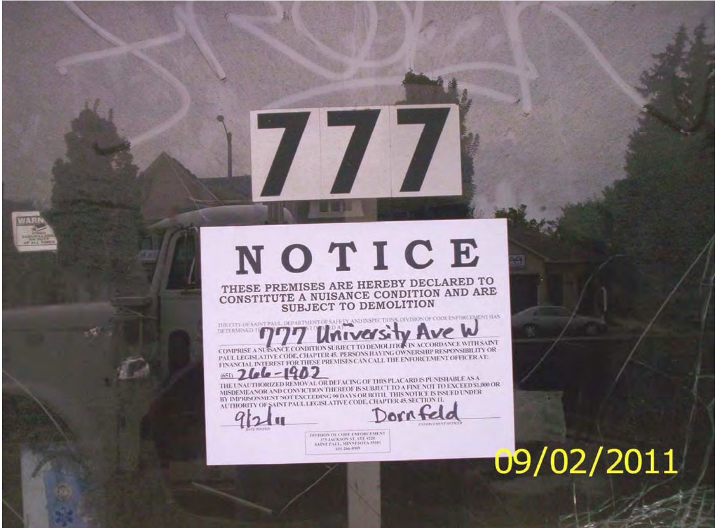
OTA posting on front door

HP District: Property Name: Survey Info: