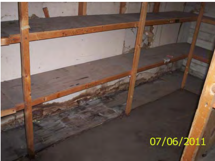
Water damaged wall and wood work, mold