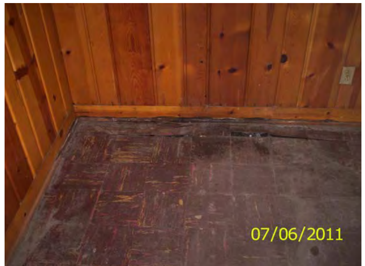
Water damaged walls and floor covering, mold