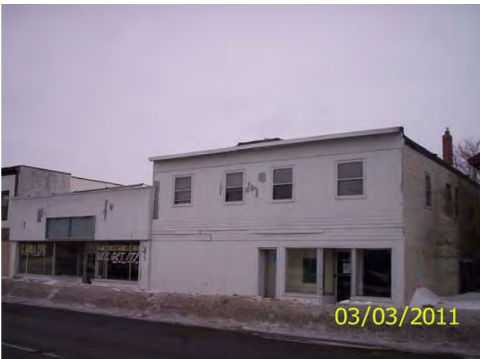
East and south sides