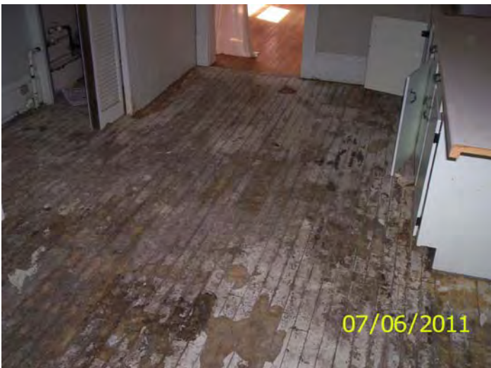
Apartment kitchen floor