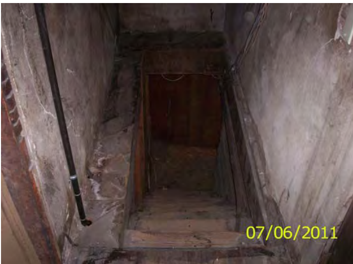
Basement steps - no hand rail