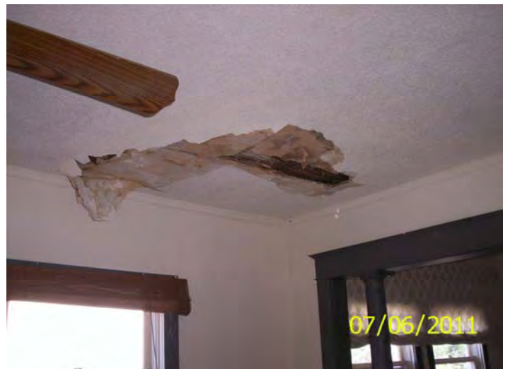
Water damaged, partially collapsed apartment ceiling