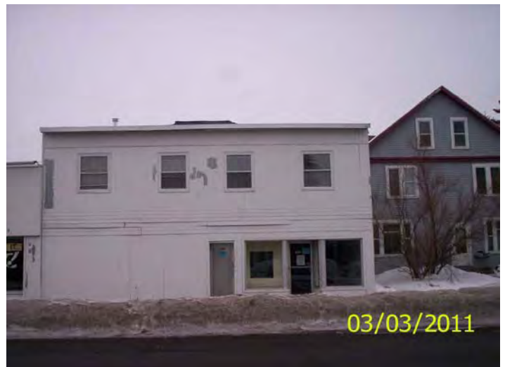
South side, posting