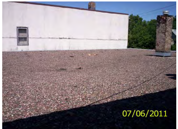
Sagging flat roof