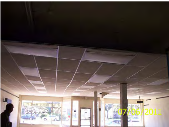
Sagging ceiling panels