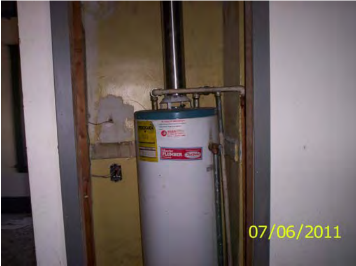
Water heater installation

HP District: Property Name: Survey Info: