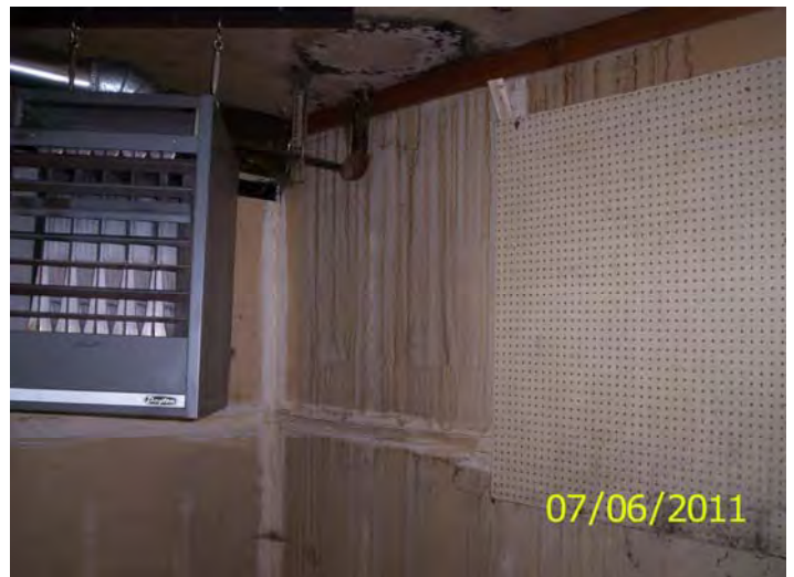
Water damaged wall and ceiling, mold