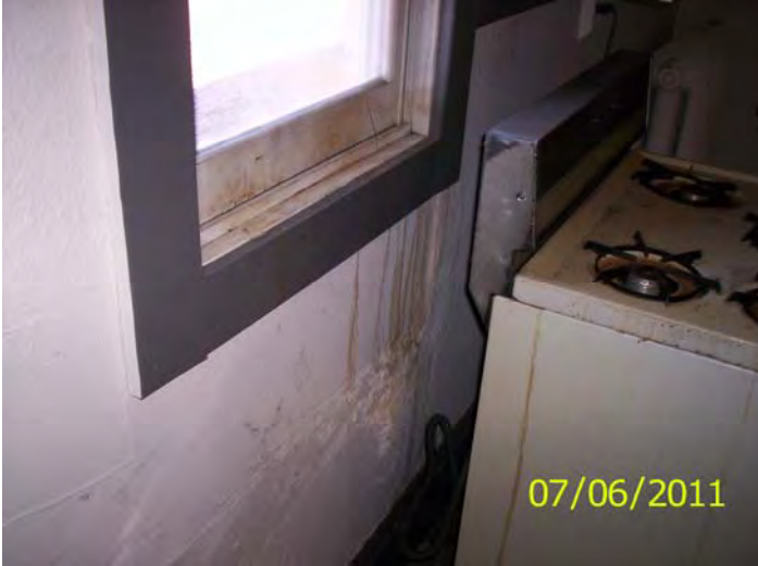
Water damaged window and wall

HP District: Property Name: Survey Info: