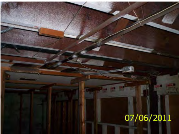
Unapproved and open electrical wiring