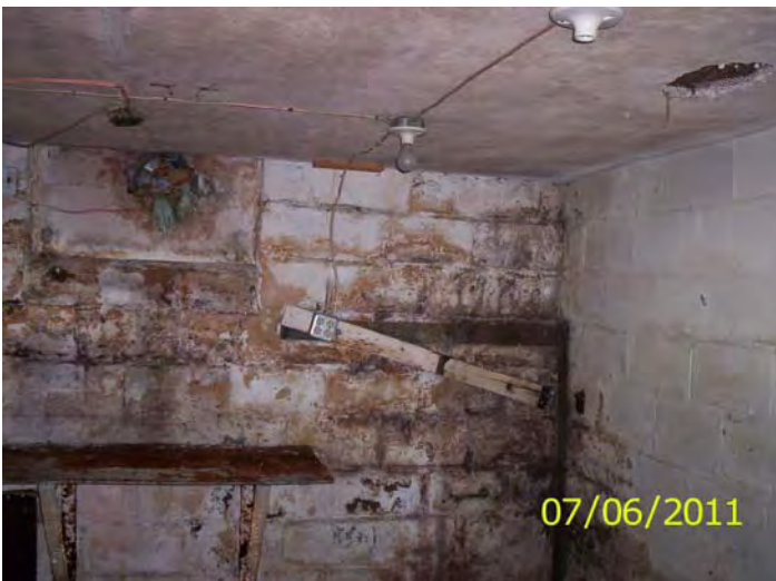
Water damaged walls and ceiling, mold