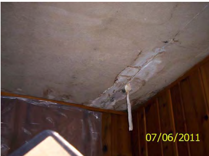
Water damaged, partially collapsed ceiling