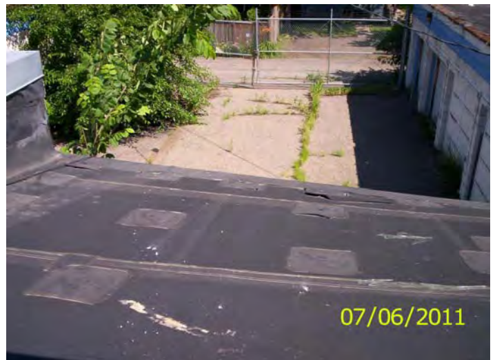
Deteriorated, open roof