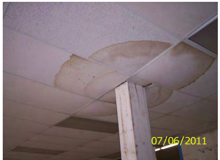
Water damaged ceiling panels