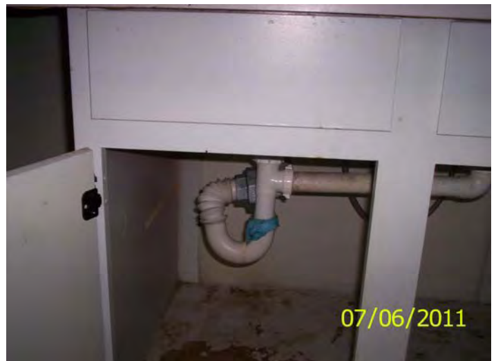
Unapproved, leaking plumbing, apartment