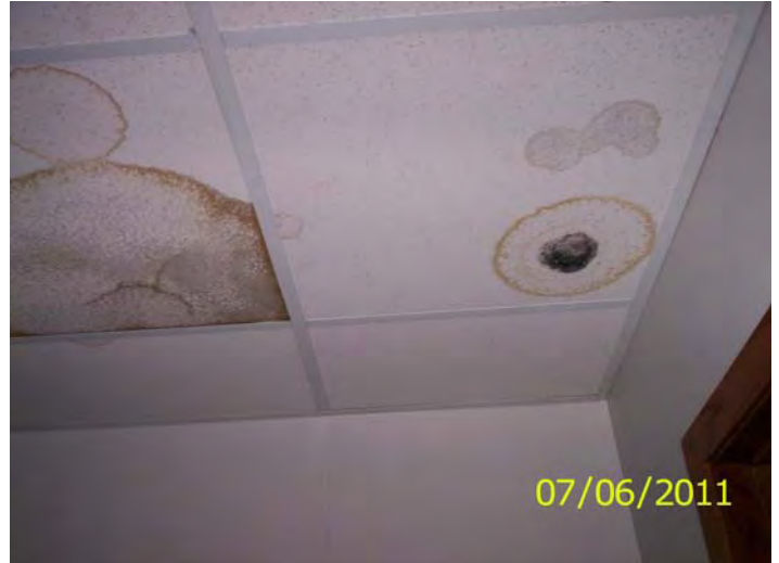
Water damaged ceiling, mold