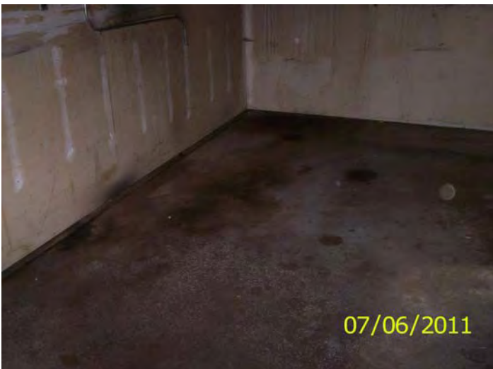
Water damaged walls, mold