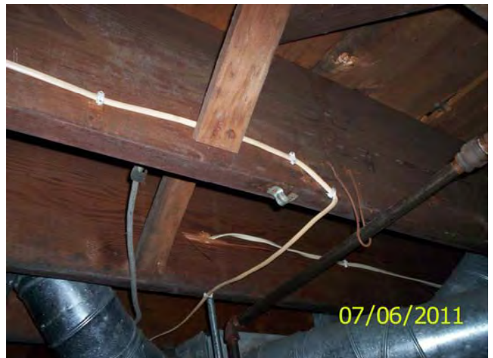
Unapproved electrical wiring