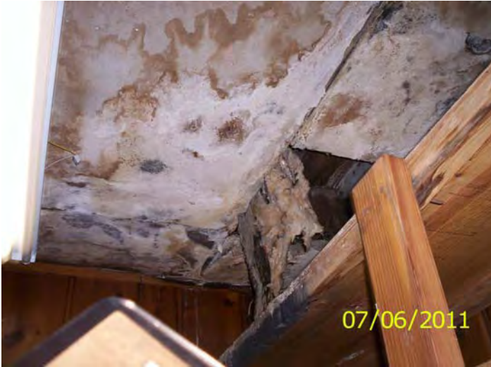
Water damaged, partially collapsed ceiling, mold

HP District: Property Name: Survey Info: