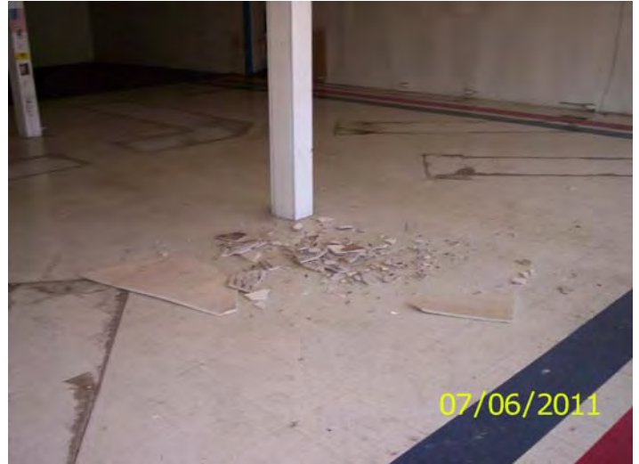
Ceiling debris on floor