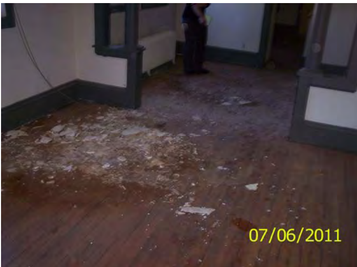
Ceiling debris on apartment floor