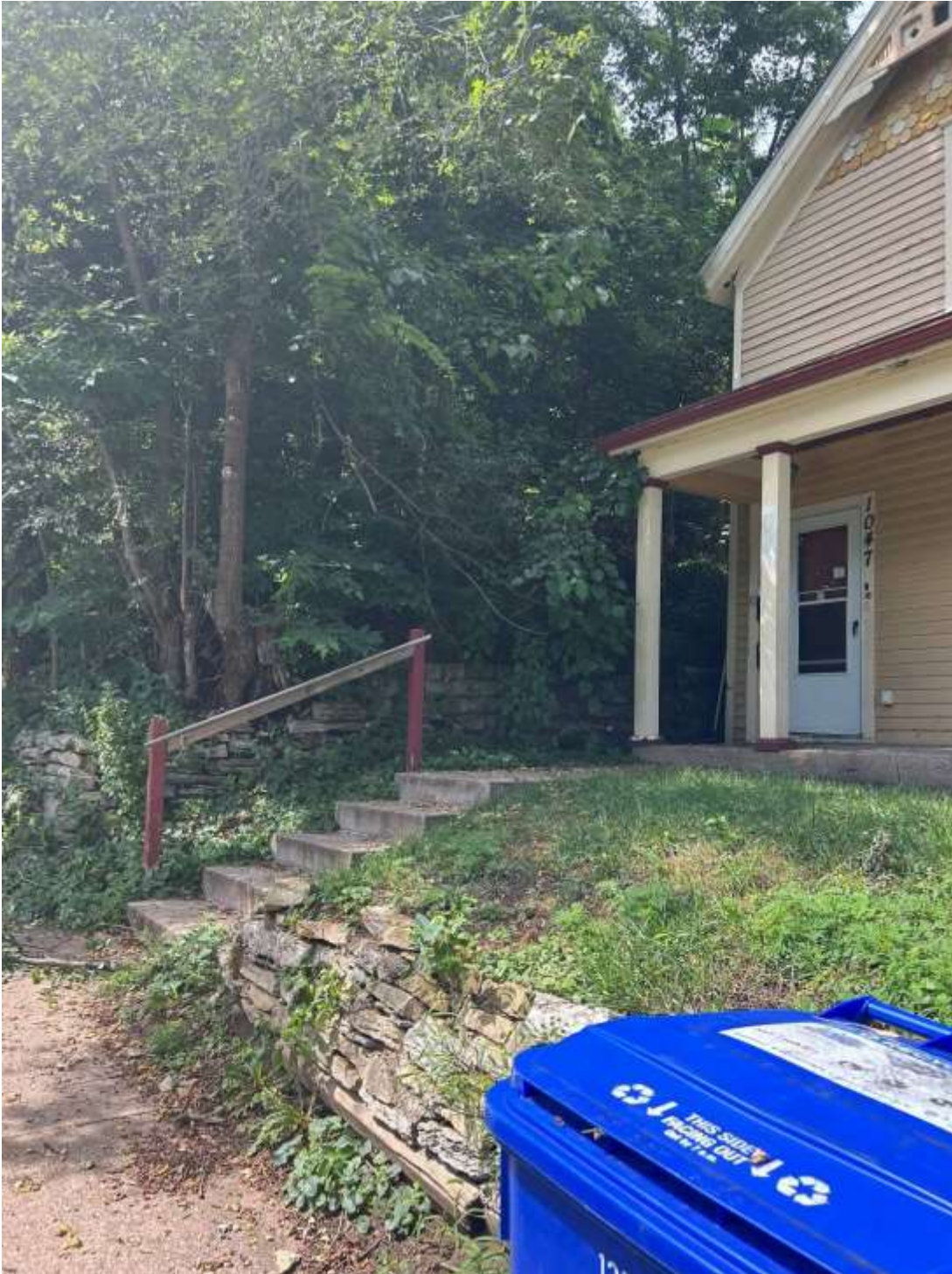
photo of the house

HP District: Property Name: Survey Info: