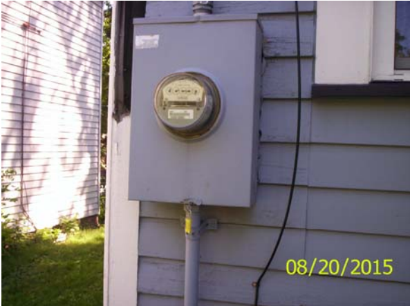
Electric meter yellow tagged off

HP District: Property Name: Survey Info: