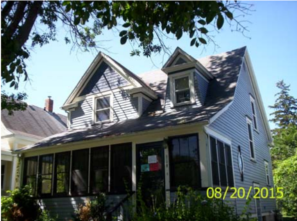
East and north sides, postings

HP District: Property Name: Survey Info: