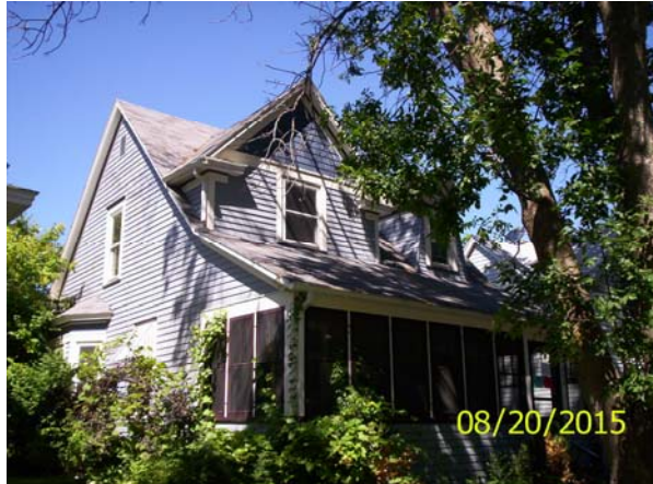
South and east sides