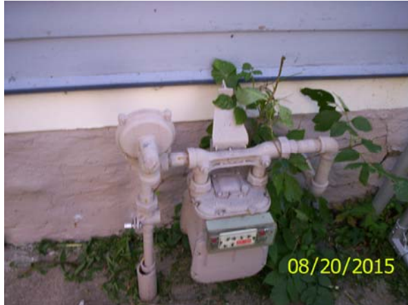
Gas meter locked off