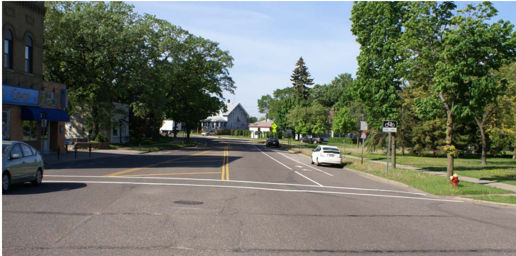
Before Raymond Ave Phase I project, looking south at Raymond Avenue at Hampden Ave

Below are before and after pictures from Raymond Avenue Phase I project, at the corner of Raymond and Hampden, demonstrating the improvements to be made by and general design of Raymond Avenue Phase II.