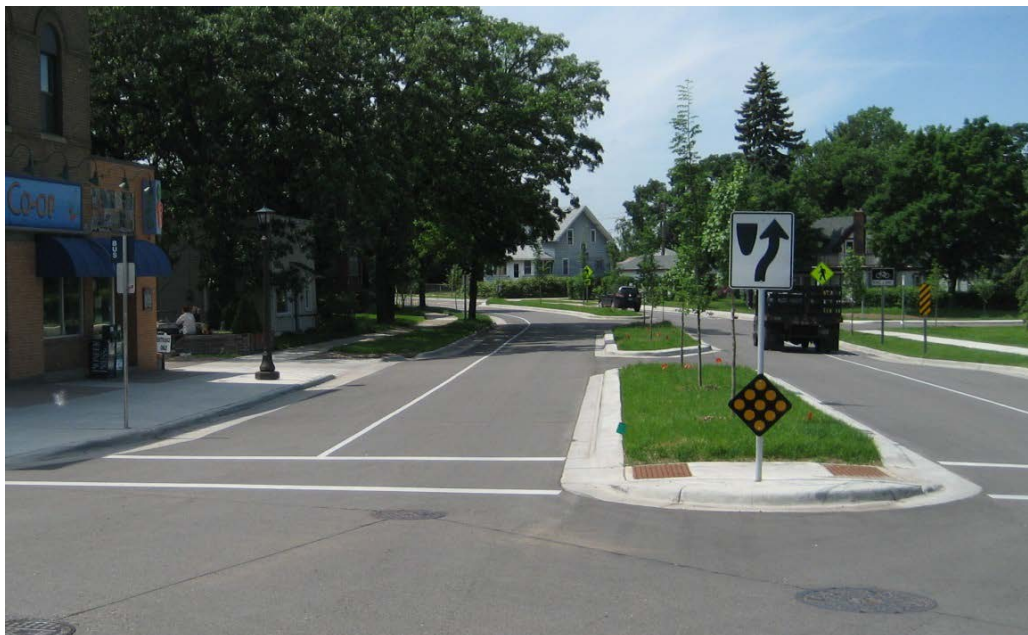
After Raymond Ave Phase I project