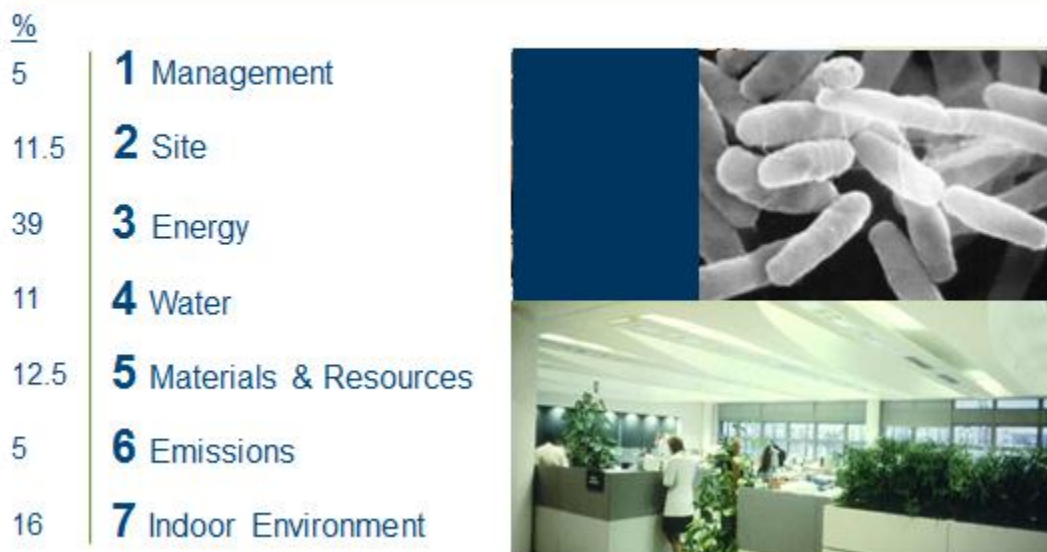
FIGURE 1-GREEN GLOBES ENVIRONMENTAL ASSESSMENT AREAS