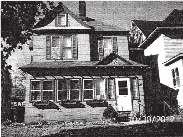
East side, posting

HP District: Property Name: Survey Info: