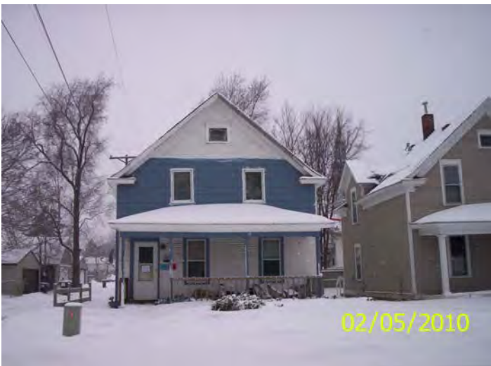
East side, postings