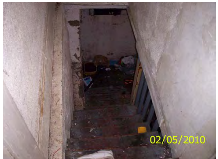
Stair way to basement, flooding, no hand rail