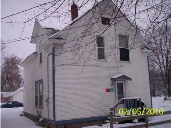
North and west sides, posting

HP District: Property Name: Survey Info: