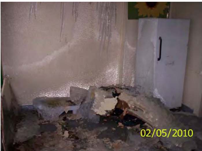
Kitchen, ice covered appliance, wall, floor