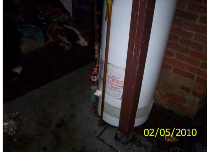
Improper post installation, improper spill tube, no handle on gas shut off