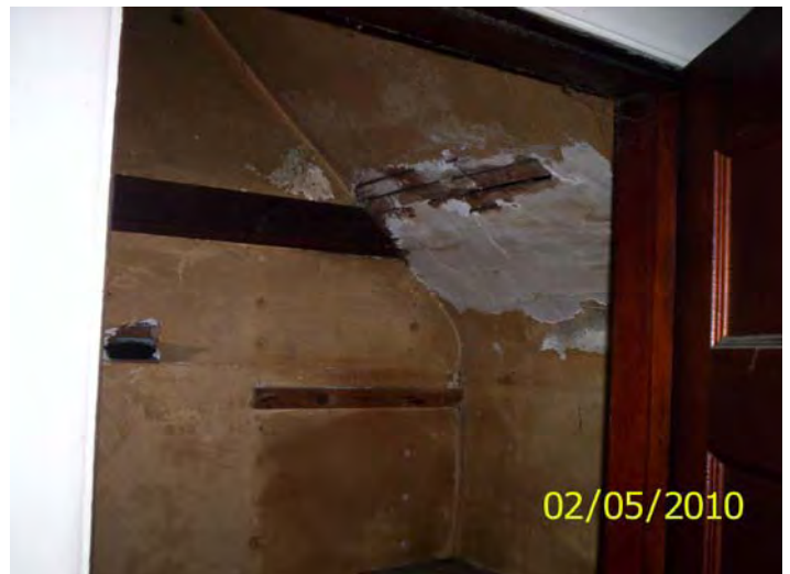
Damaged ceiling 2 nd floor bathroom