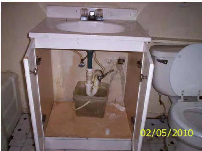
Improper trap repair, leaking