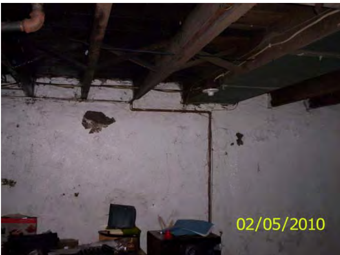
Bubbling, flaking paint