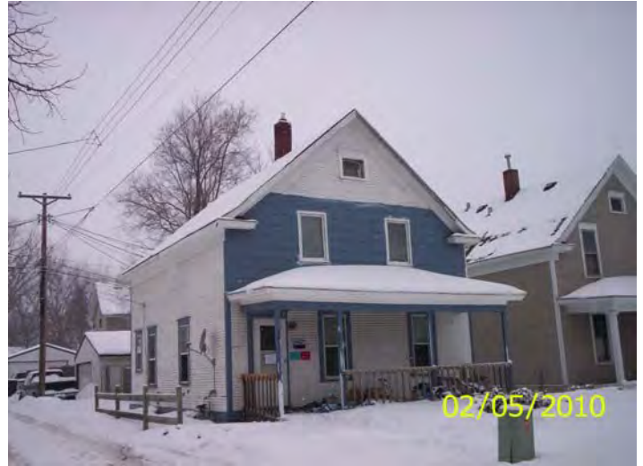
South and east sides, postings