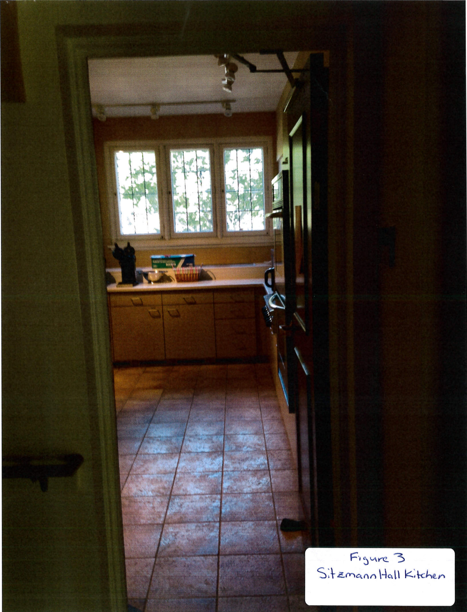
Figure 3 Sitzmann Hall Kitchen