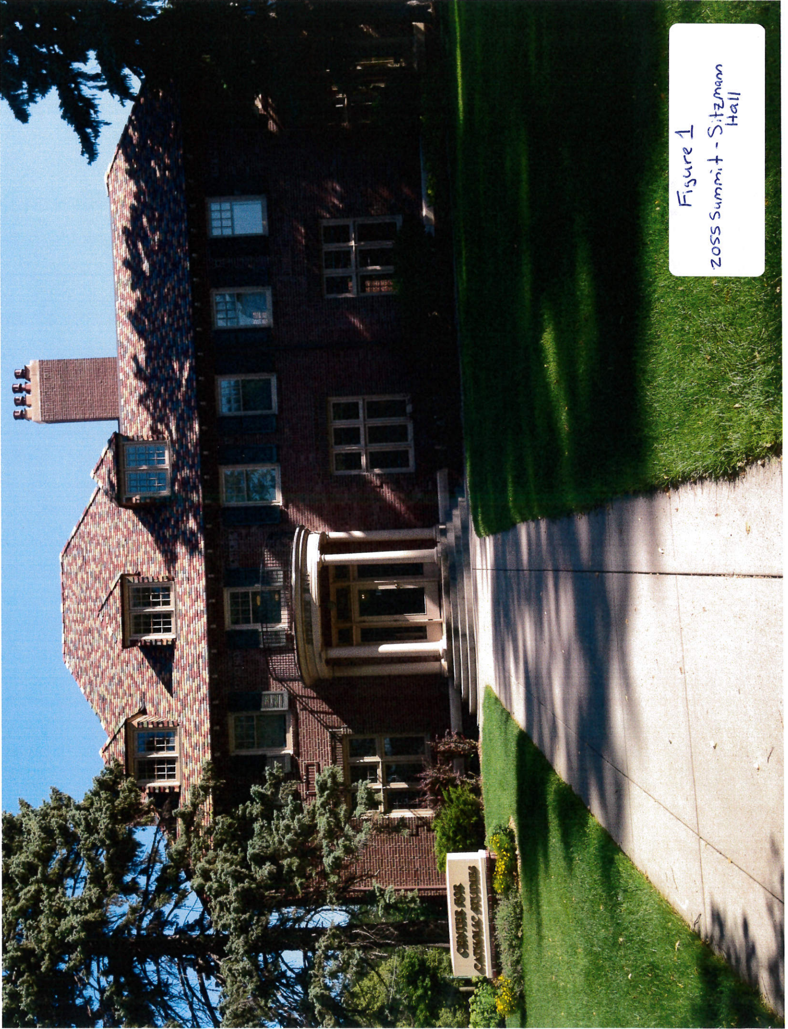
Figure 1 ZOSS Summit - Sitzmann Hall