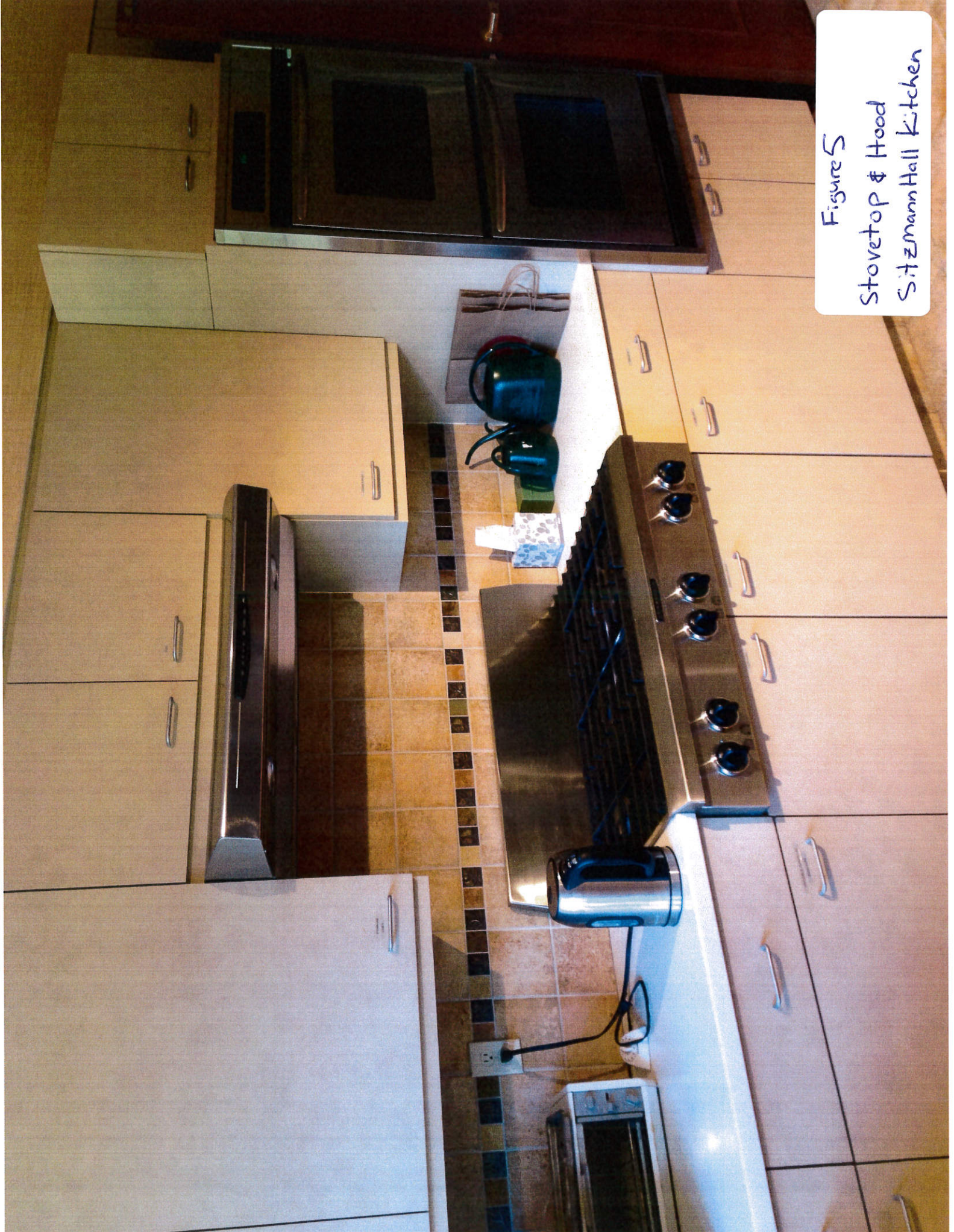
Figure 5 Stovetop & Hood Sitzmann Hall Kitchen