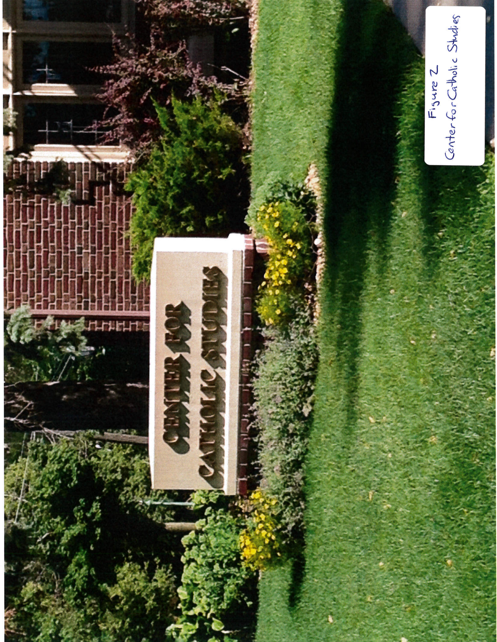
Figure 2 Center for Catholic Studies