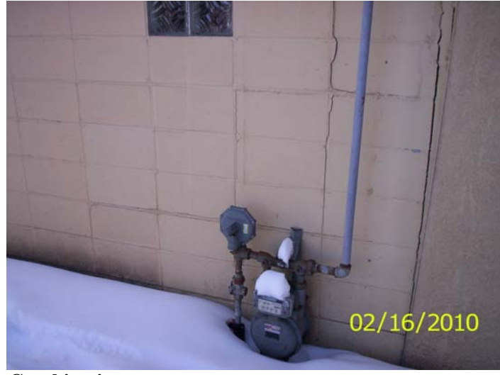
Cracking in masonry