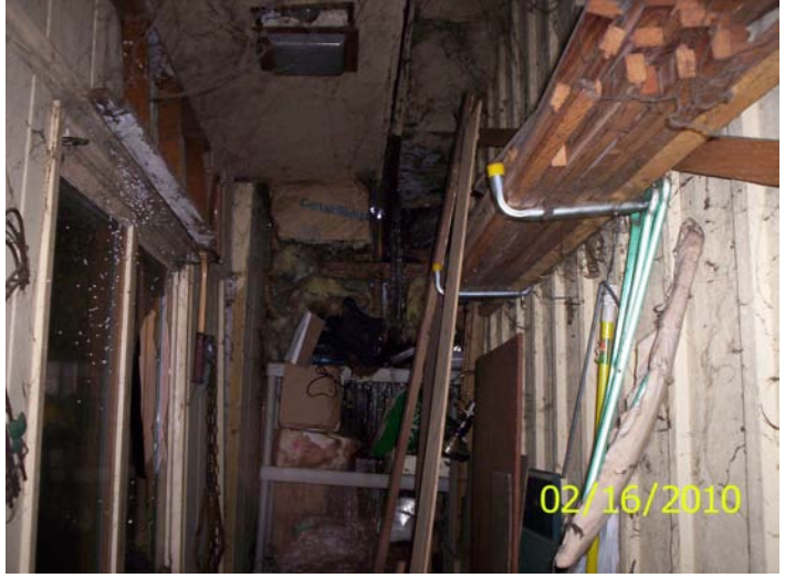
Inside screen porch