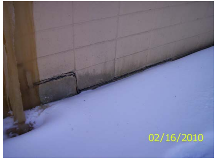
Large separating shifting crack

HP District: Property Name: Survey Info: