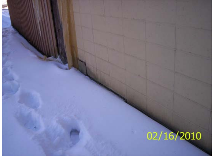
Large separating shifting crack