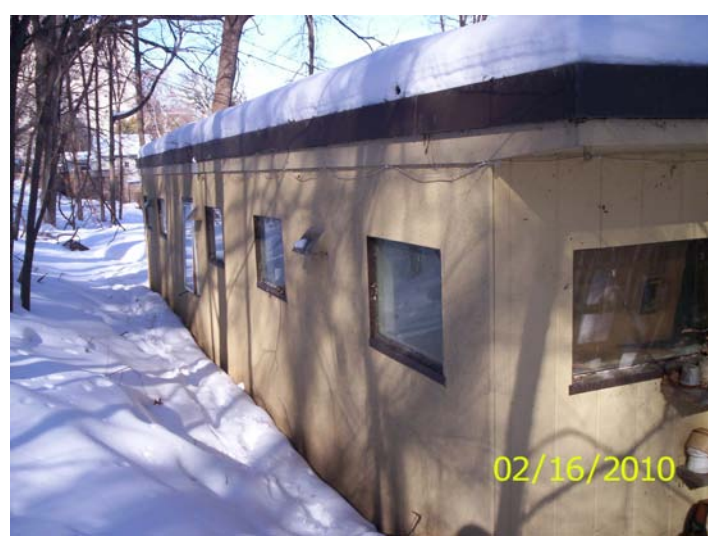
West side house