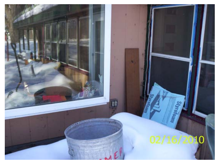
Open electrical outlet