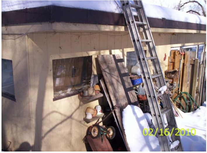
South side house