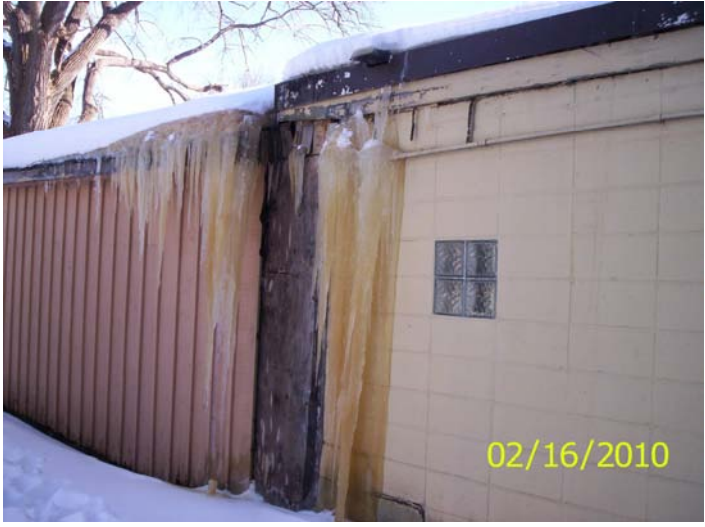
Rotted eaves house and garage, rotted wall