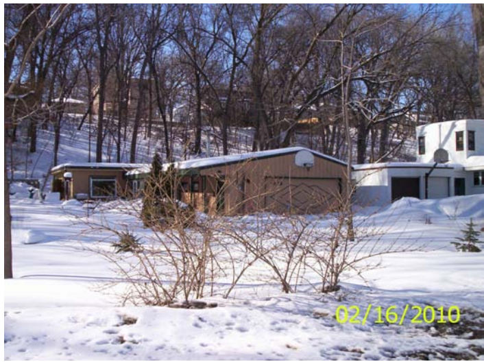
East and south side