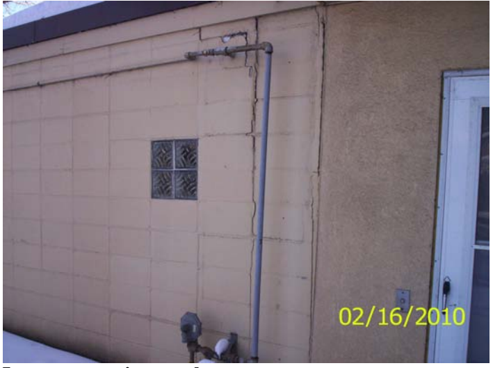
Large separating crack