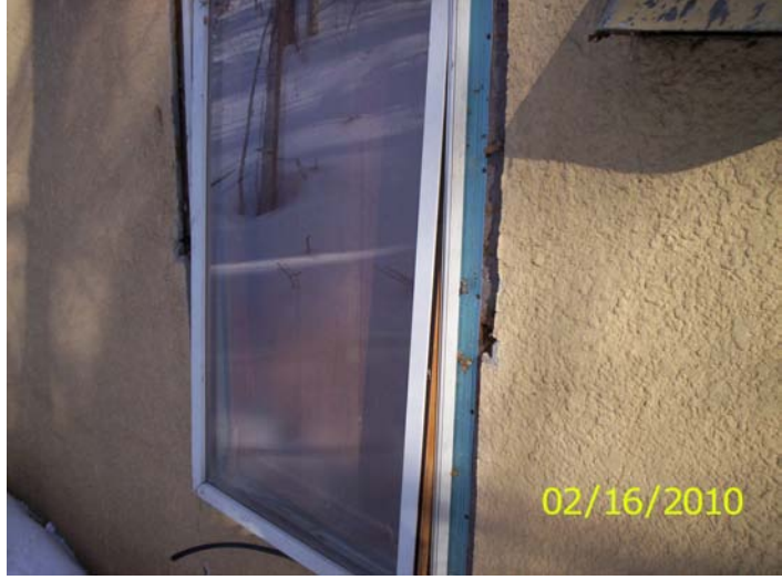
Unfinished window installation, boarded on interior

HP District: Property Name: Survey Info: