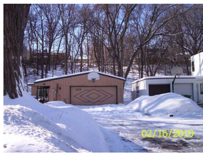
East side house and garage

HP District: Property Name: Survey Info: