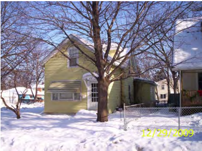
West and south sides