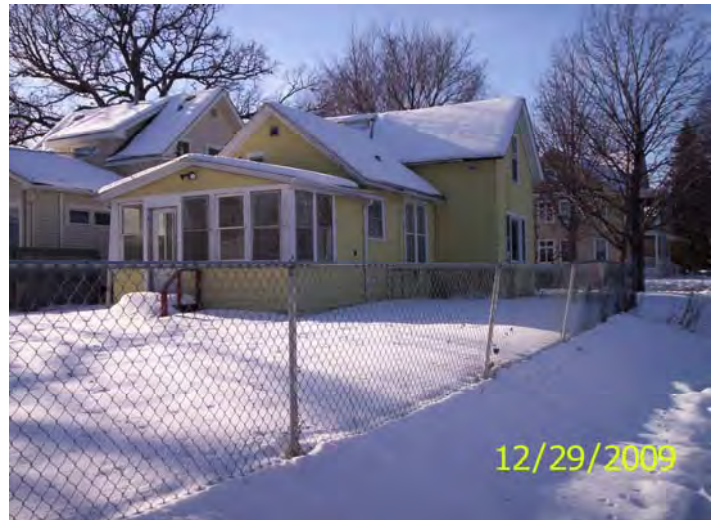
East and north sides