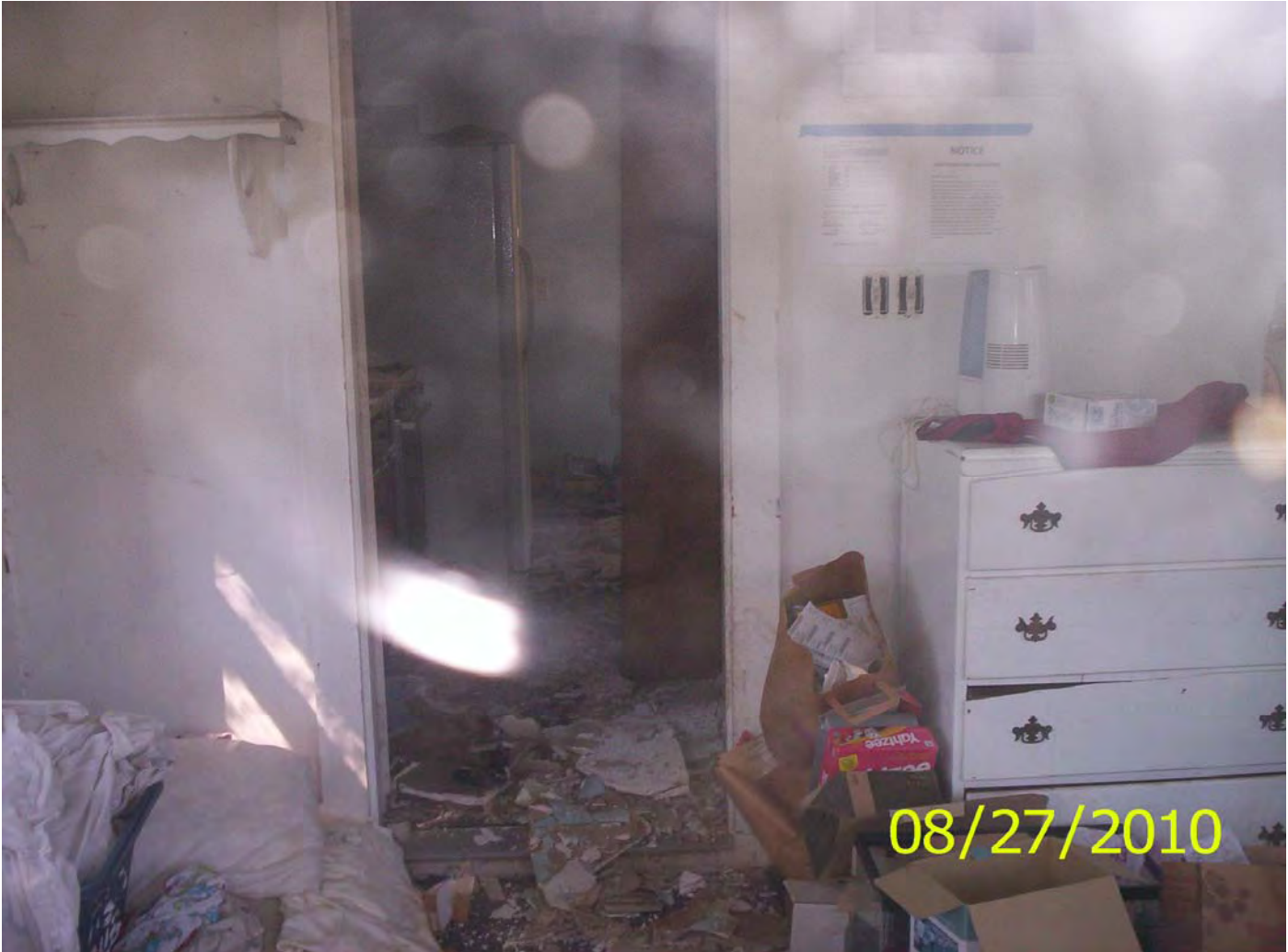
Debris from apparent ceiling collapse

HP District: Property Name: Survey Info: