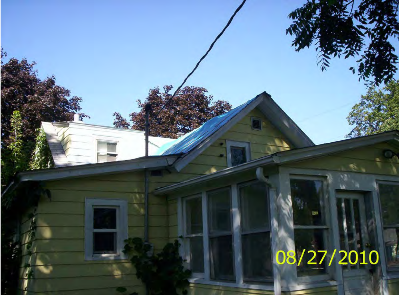
Roof covered by blue tarp

HP District: Property Name: Survey Info: