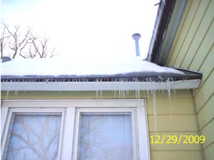
Rot damaged open eave

HP District: Property Name: Survey Info: