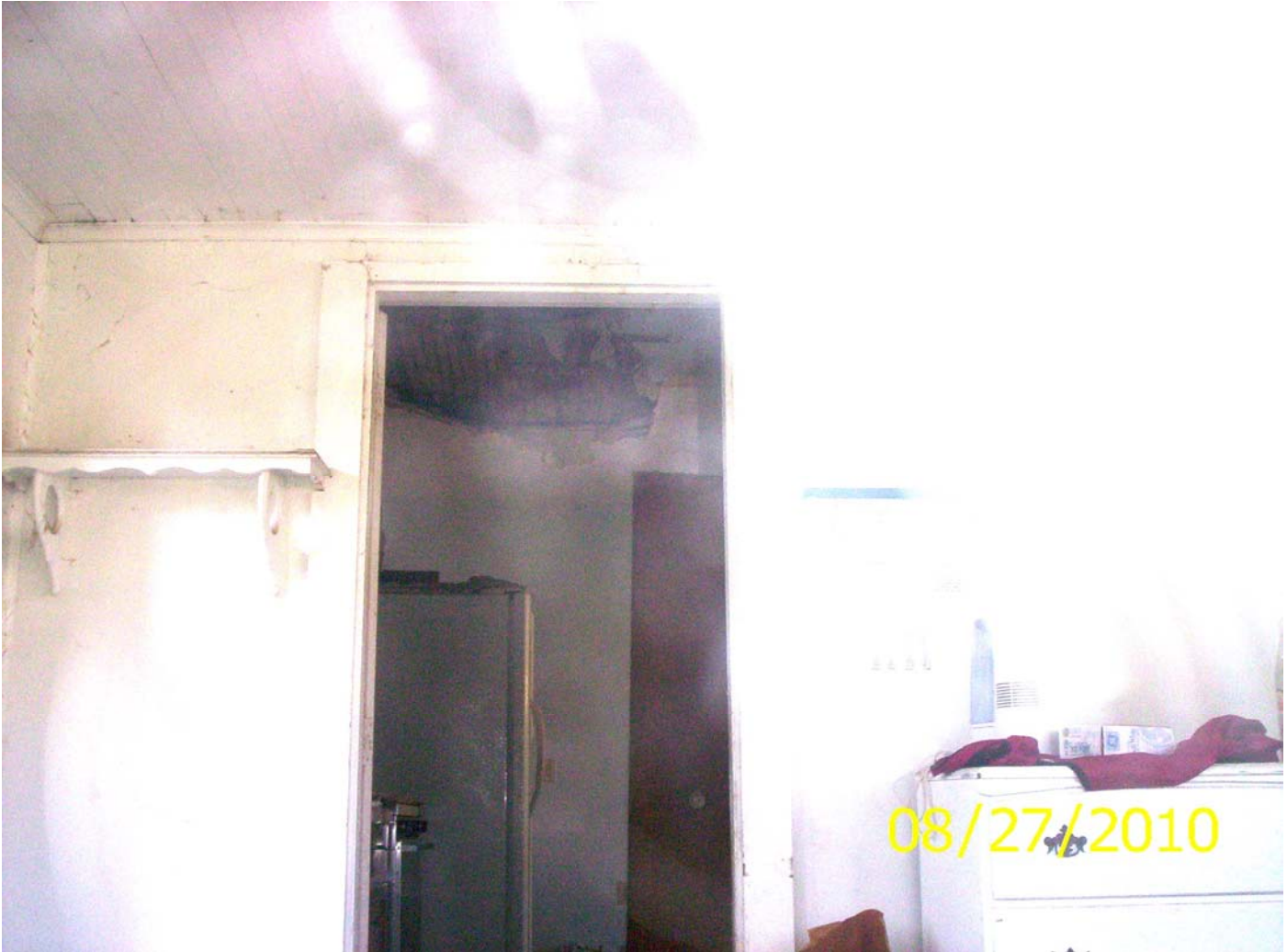
Damage from apparent ceiling collapse

HP District: Property Name: Survey Info: