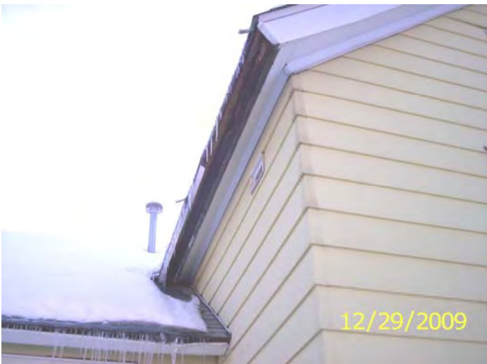
Rot/rodent damaged open eave - nesting