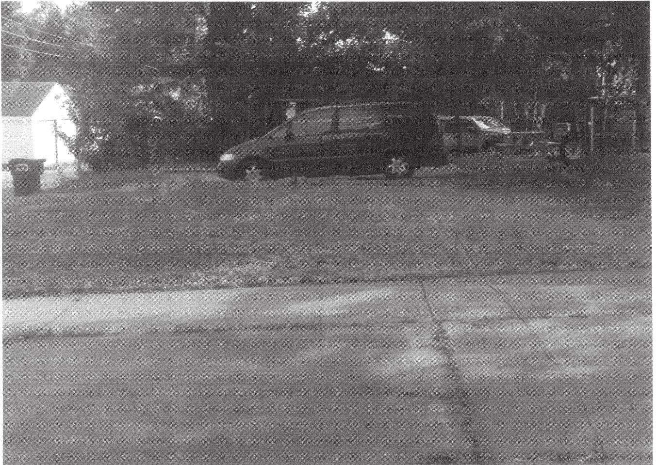
Class 5 Gravel Driveway Property next door.