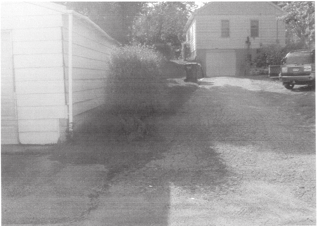
Property in same alley whos driveway is almost up to property line