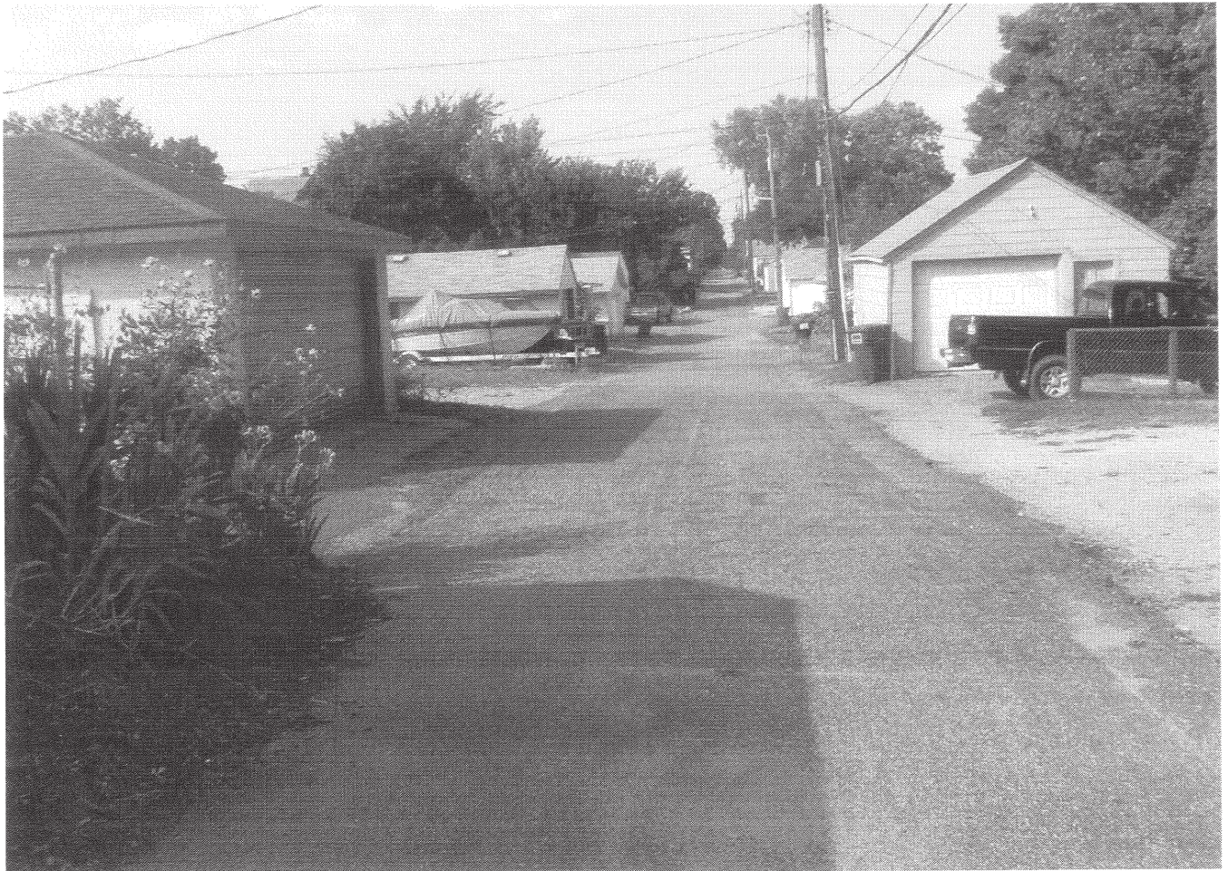
Photo of alley of my property at 1098 Marion St. in St. Paul.