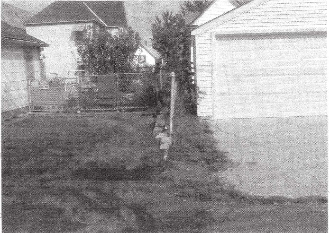
Directly across alley from Property my driveway