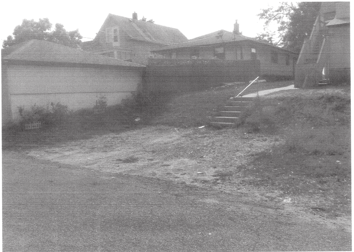
Gravel Class 5 driveway same alley