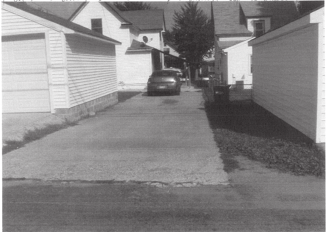
Non code compliant driveway within 4' of easement - same alley