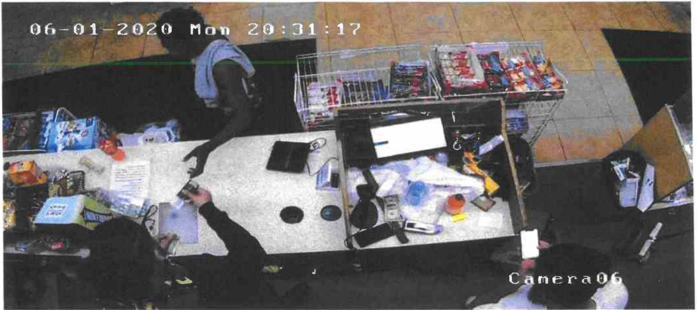
'Swisher Sweet' Grape Cigars and a Carton of 'Newport 100's' Cigarettes in the trash can, circled in red below.