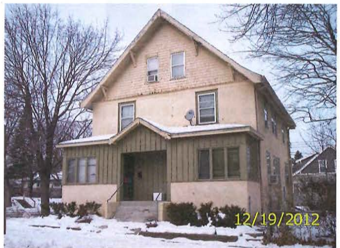
South and east sides