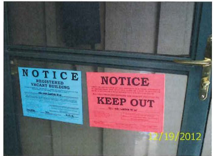
423 unit posting