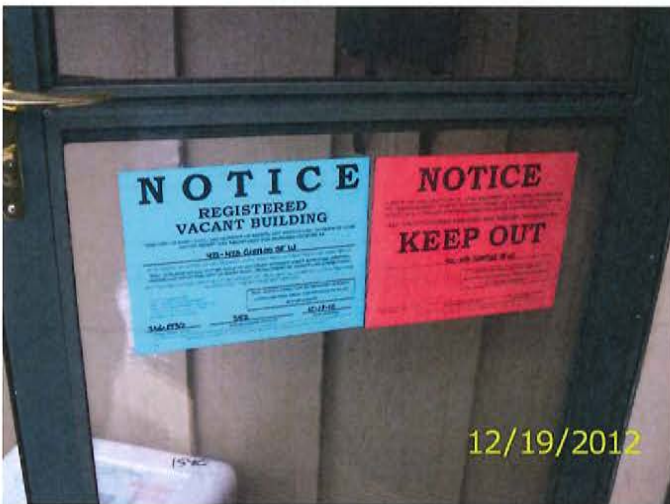
421 unit posting