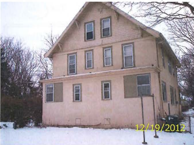
North and west sides