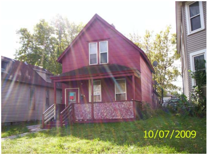
North and west sides, posting