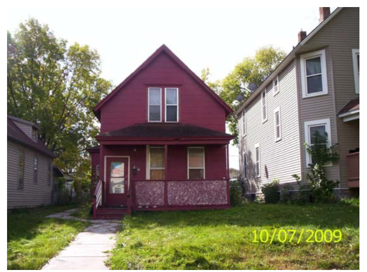
North side, posting