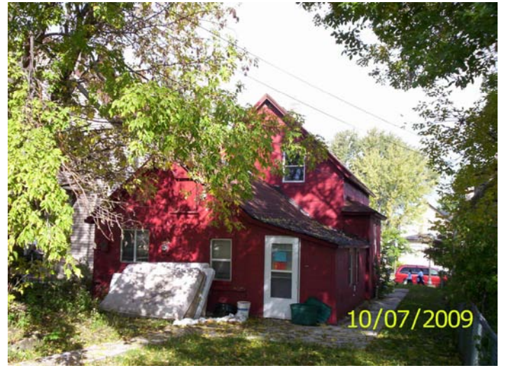
South and east sides, posting